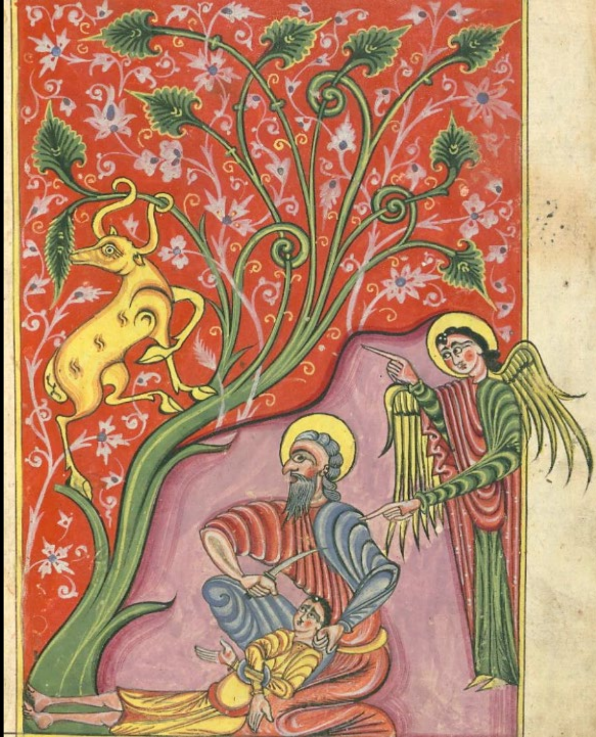
Sacrifice of Isaac Follow Gospels Walters Art Museum Baltimore, MD