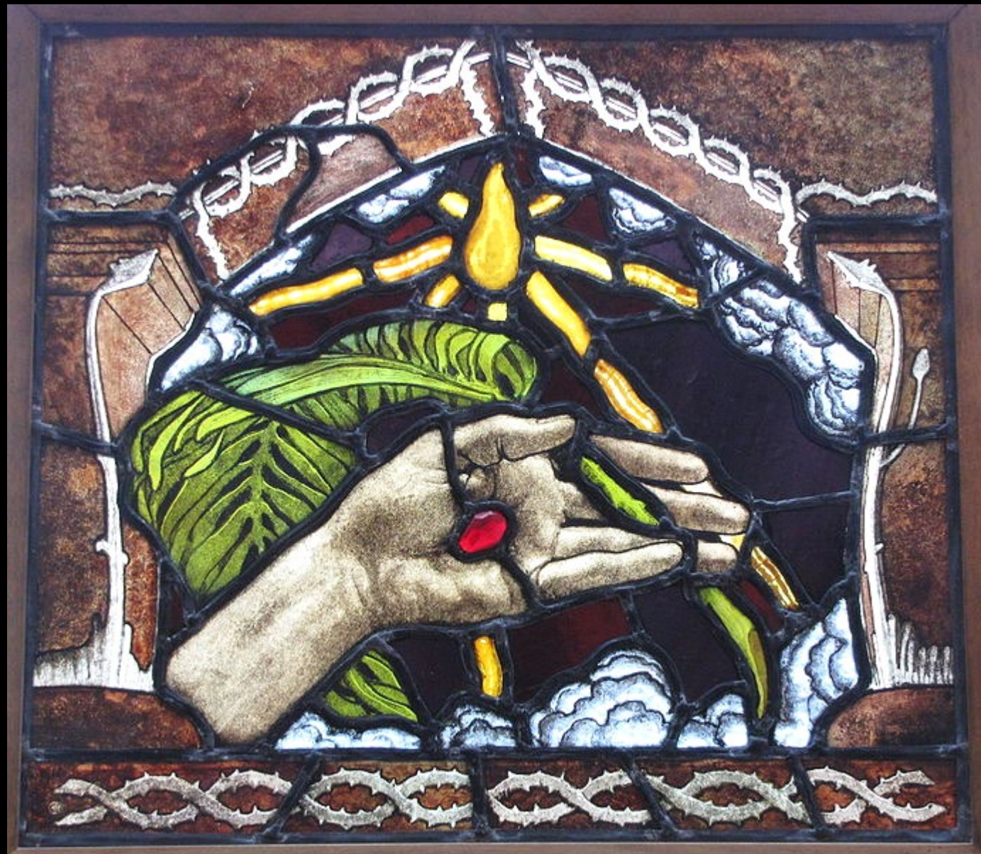
The Hand of Christ, The Palm of Peace -- Akseli Gallen-Kallela Museum, Espoo, Finland