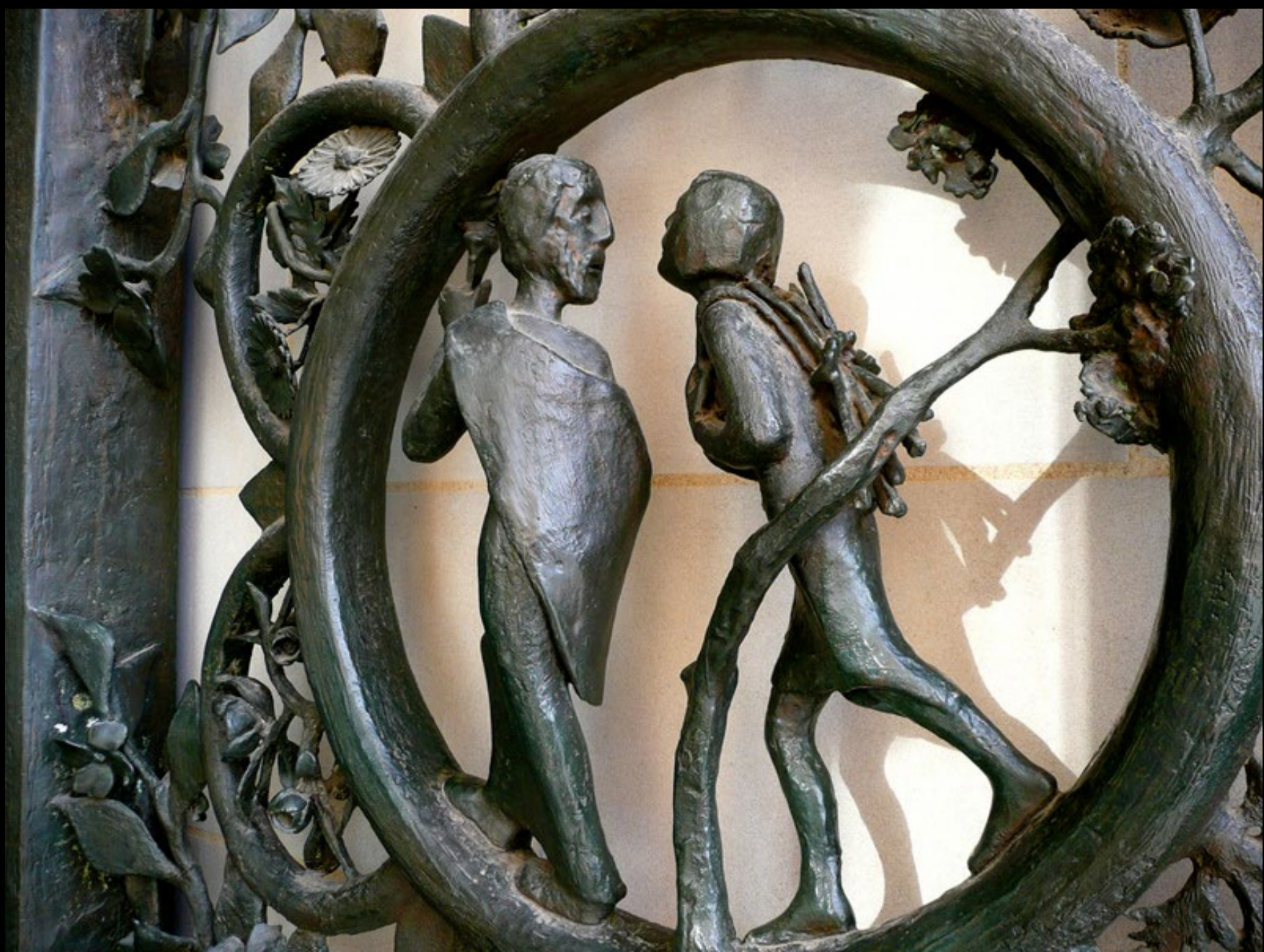
Sacrifice of Isaac -- Washington Cathedral, Washington DC