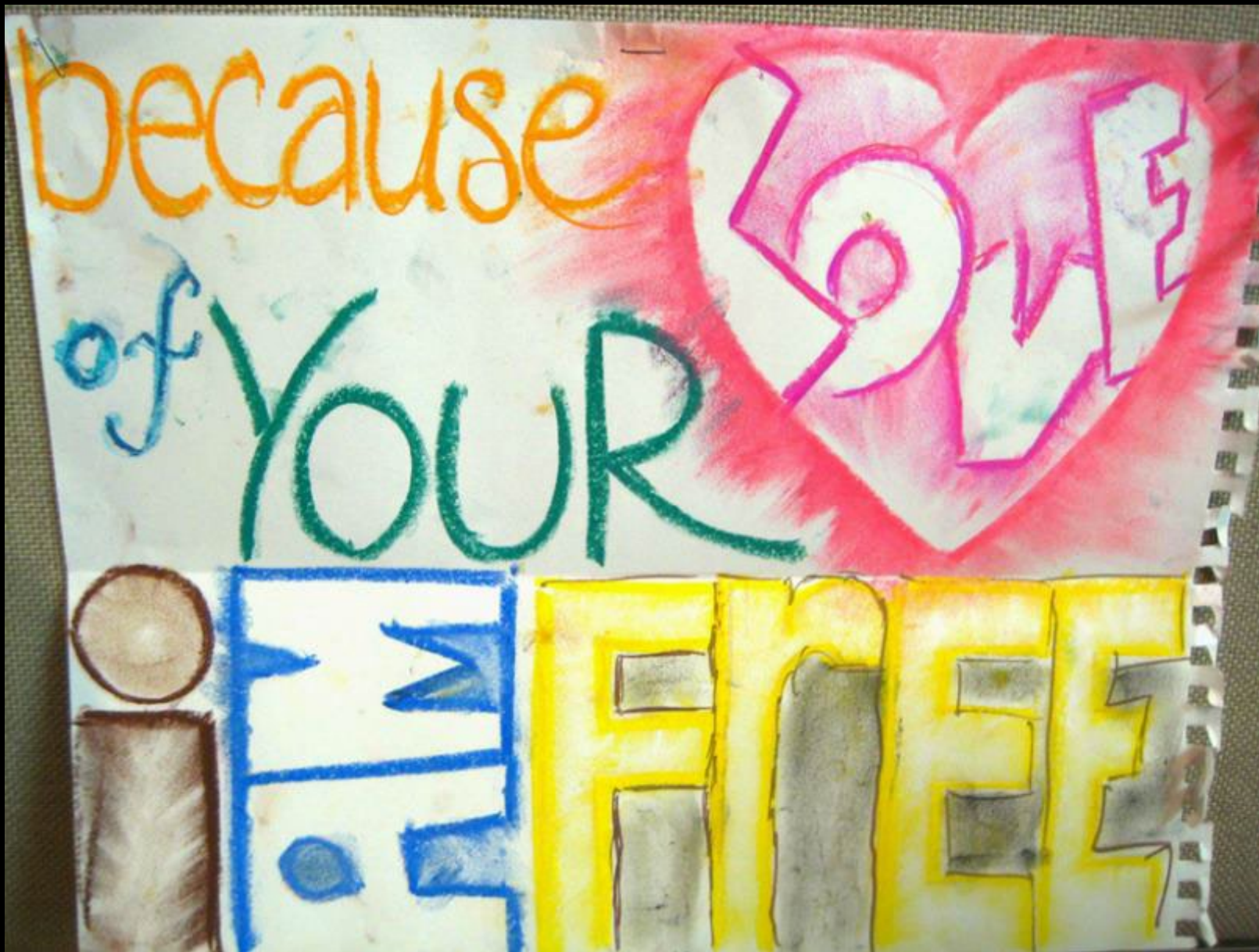
Because of Your Love -- Gateway Mission Camp, Lingnan University, Hong Kong, China