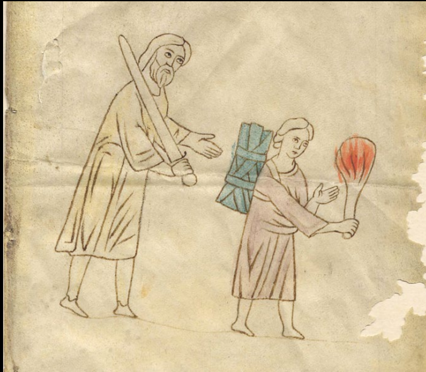
Sacrifice of Isaac -- Manuscript fragment, 14 th century