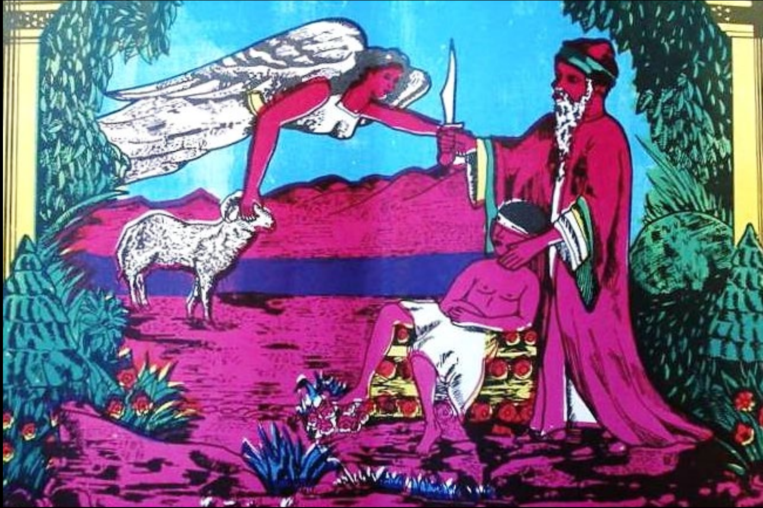
Attempted Sacrifice of Ishmael/Isaac, Chromolithograph, Kano, Nigeria