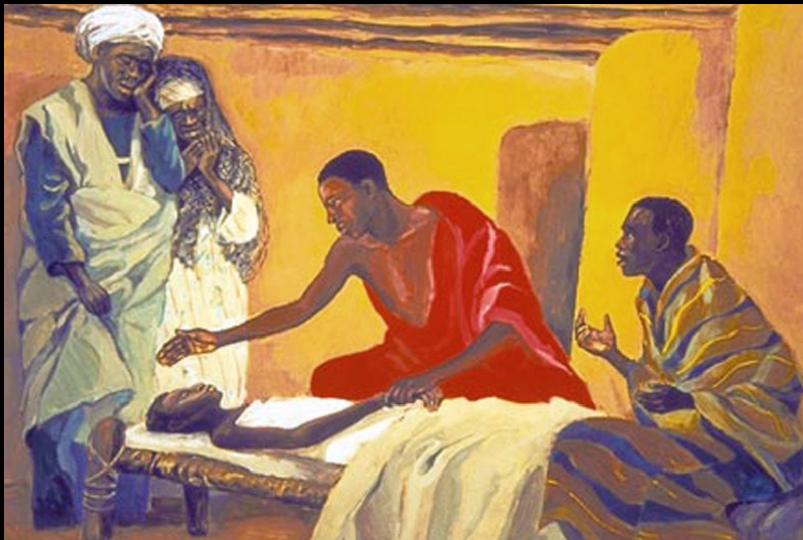
Jesus Raises the Child -- JESUS MAFA, Cameroon