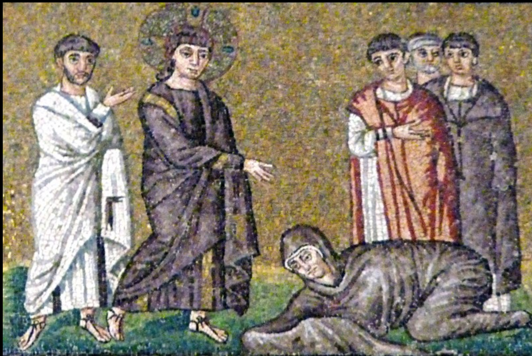
Christ Heals the Woman Who Touched His Cloak -- Sant'Apollinaire Nuovo, Ravenna, Italy