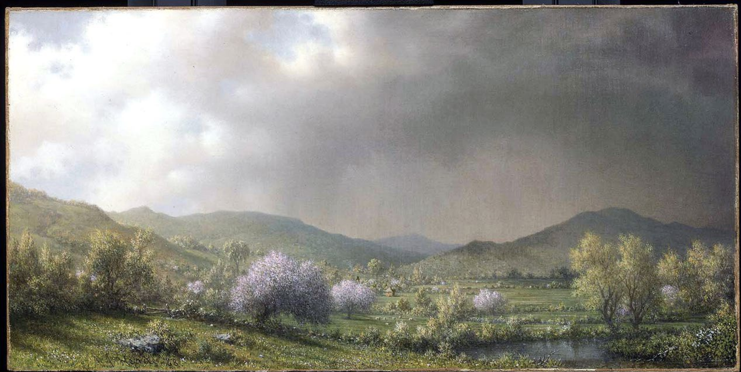
April Showers -- Martin Johnson Heade, Museum of Fine Arts, Boston, MA