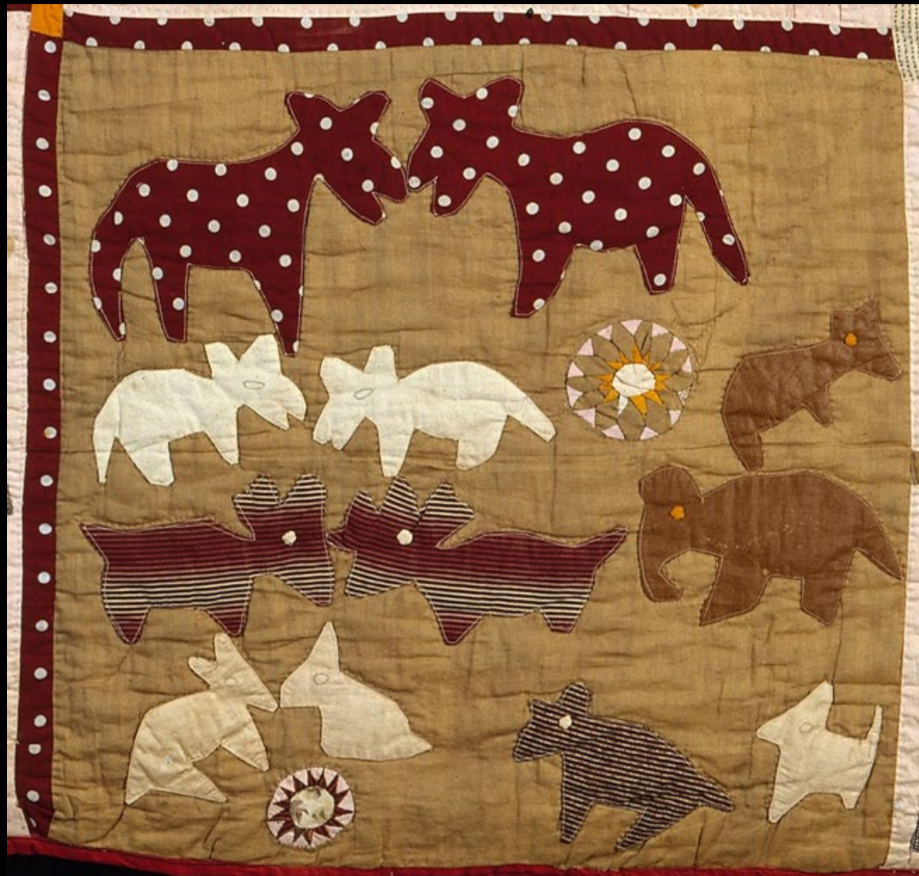
Animals Square from The Bible Quilt -- Harriet Powers, Museum of Fine Arts, Boston , MA