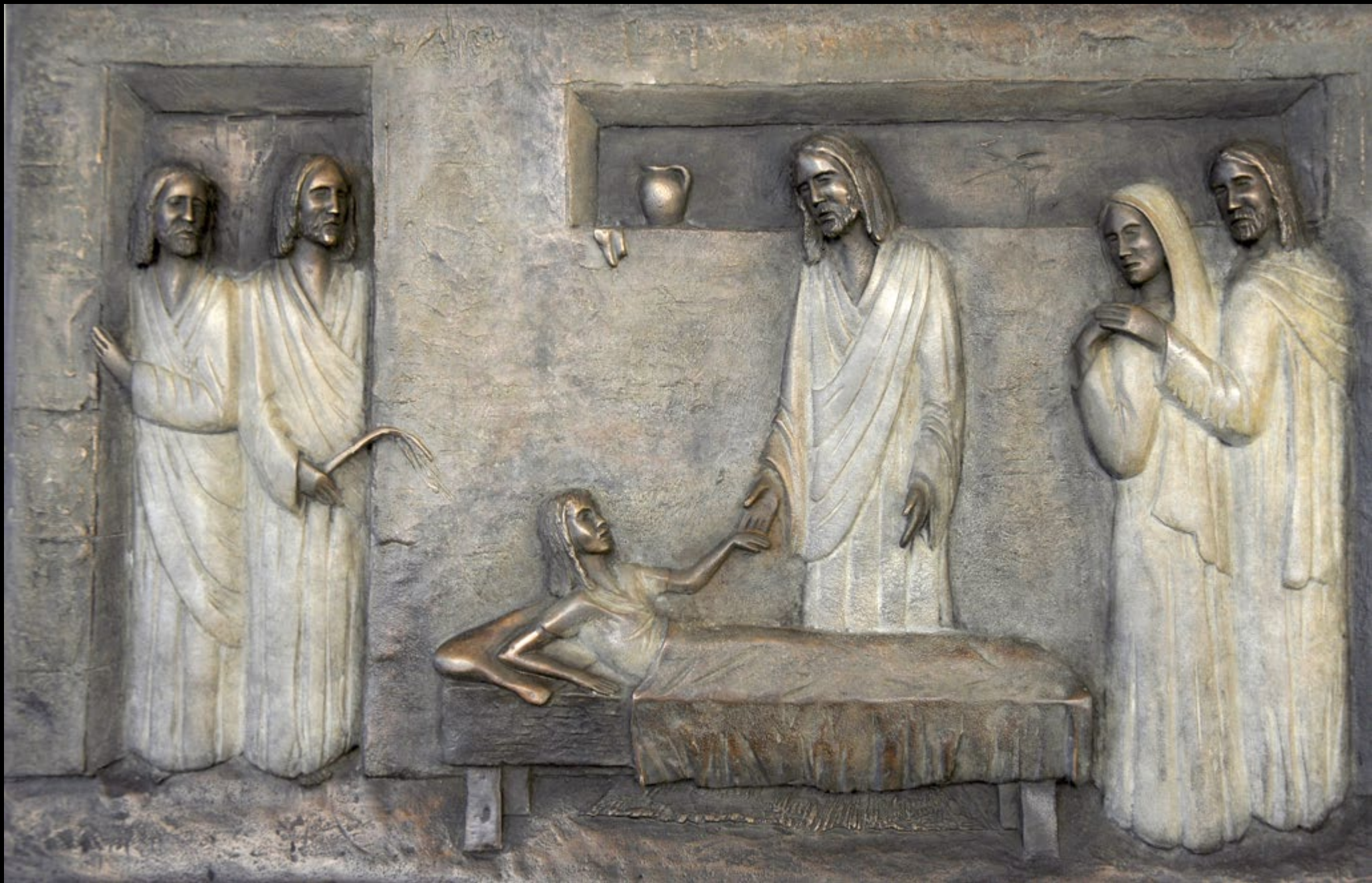
Jesus Raises the Daughter to Life -- National Children's Hospital, Tallaght, Dublin, Ireland