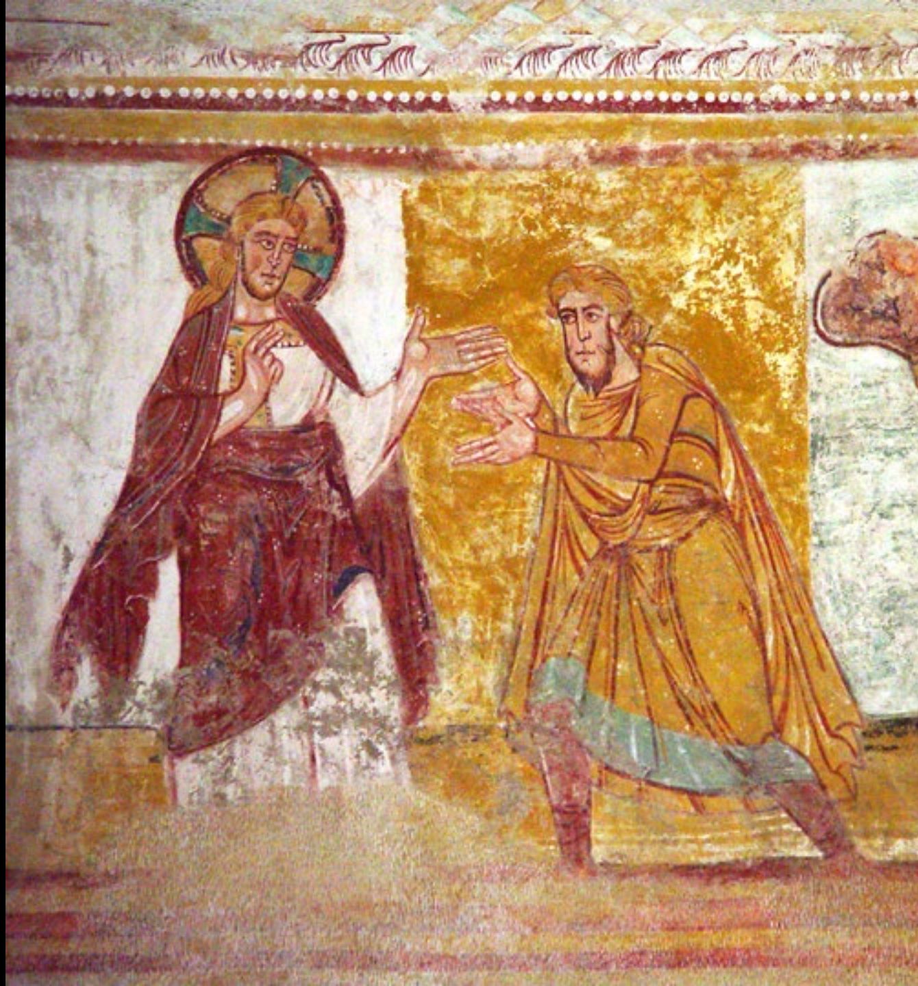
The Calling of Abraham