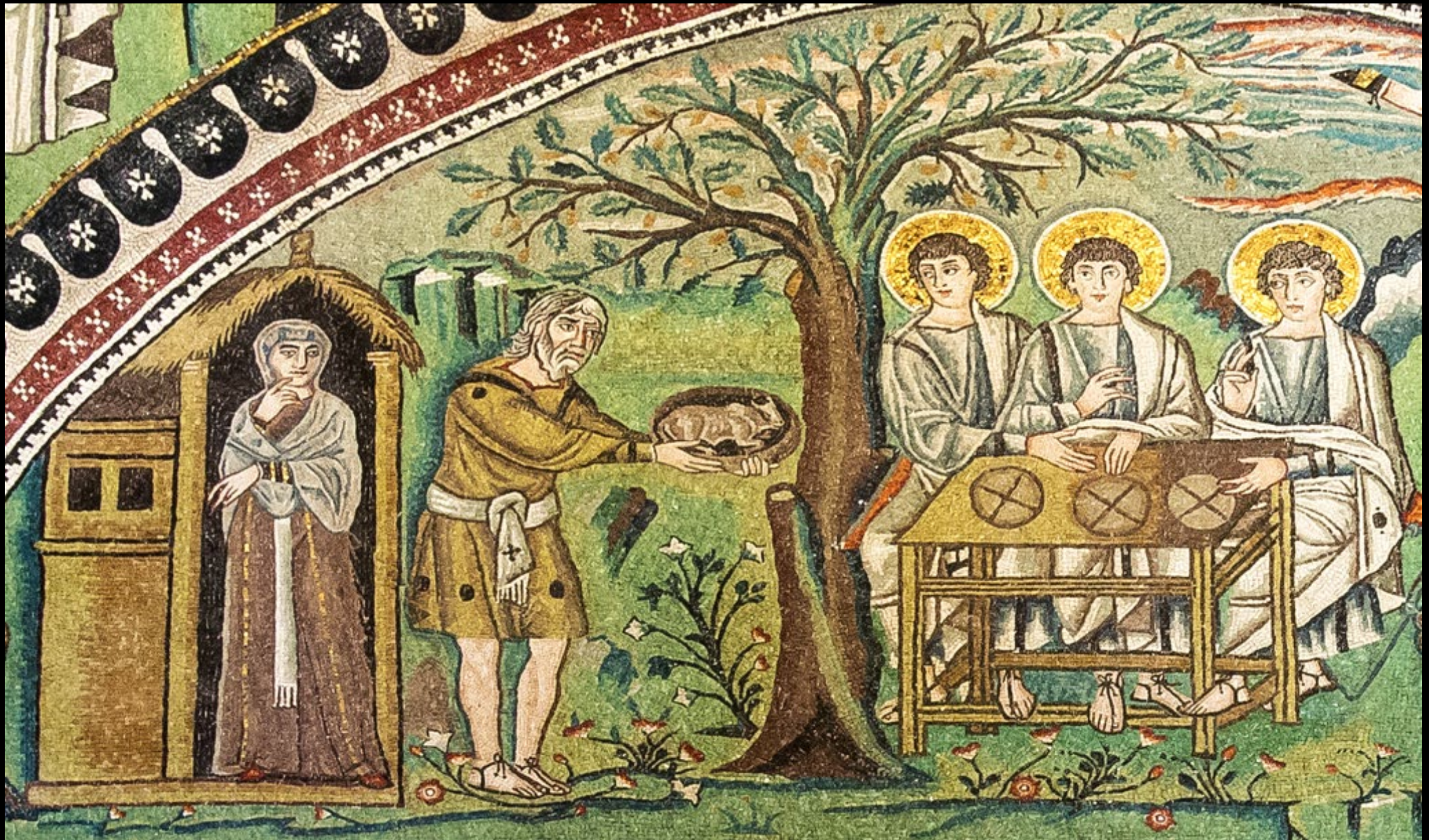
Sarah and Abraham Offer Hospitality to God's Messengers -- San Vitale, Ravenna, Italy