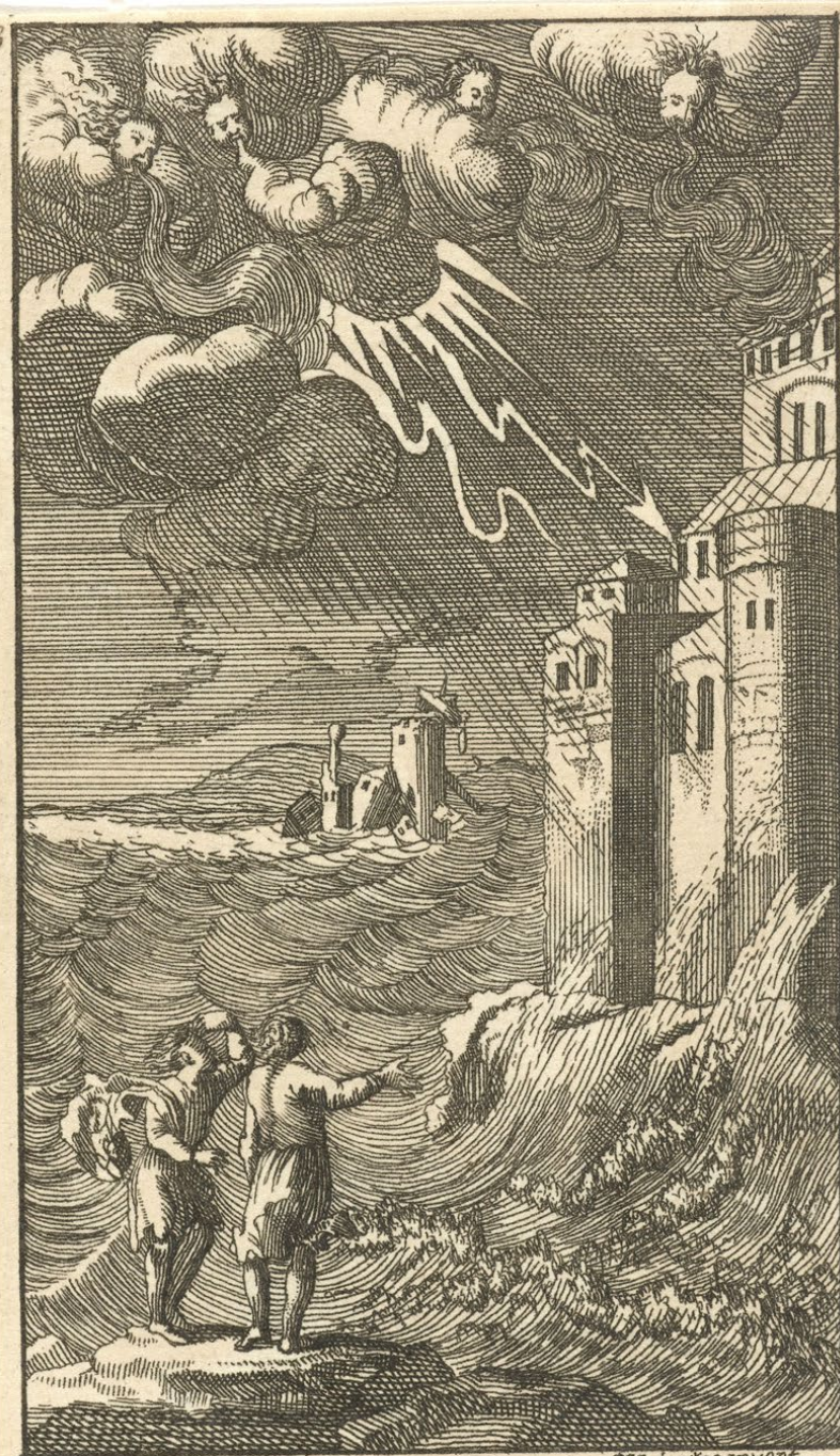
ten Luyken invent. 't Huys op een Steenrots. Matth. VII. 24.