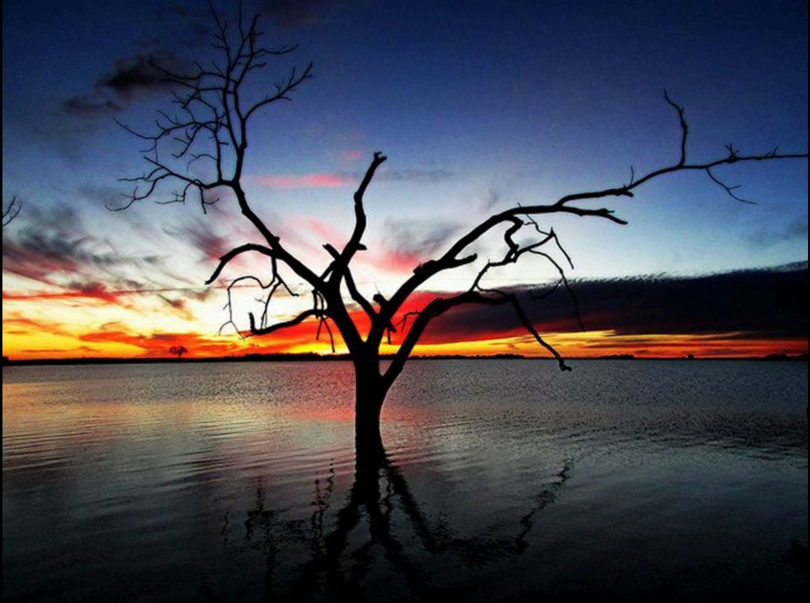
Sunset sets the sky ablaze at South Dakota's Waubay National Wildlife Refuge, Spencer Neuharth