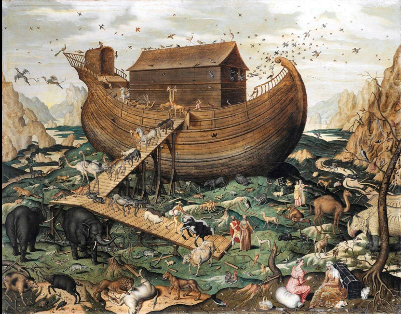
Noah's Ark on the Mount Ararat, Simon de Myle, 1570