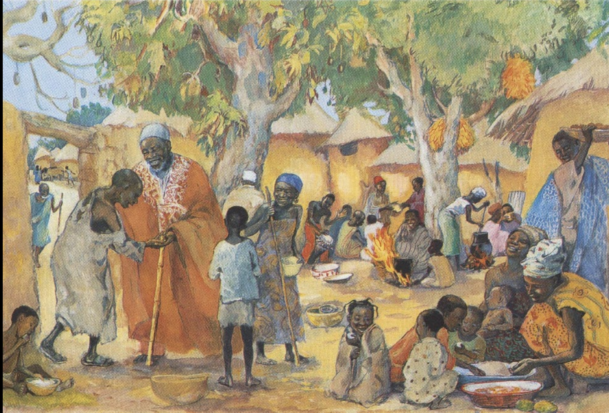
The Poor Invited to the Feast -- JESUS MAFA, Cameroon