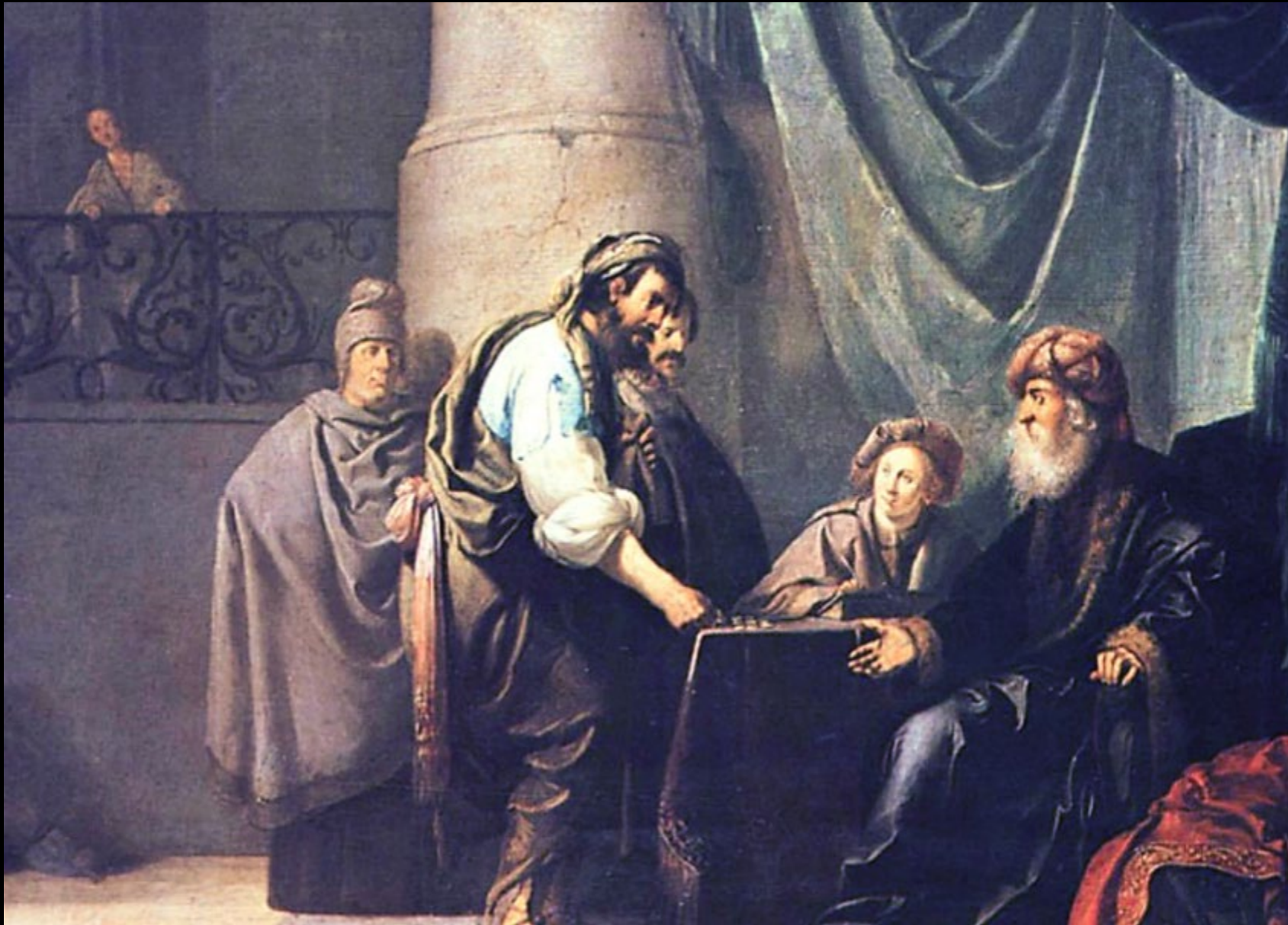
Parable of the Talents -- Willem de Poorter, Narodnie Galerie, Prague, Czech Republic