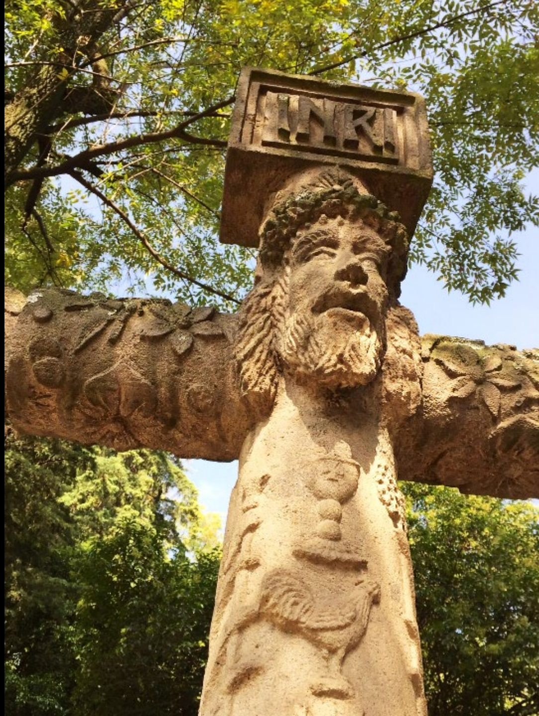
Christ on the Cross

Unidentified sculptor Church of San Jacinto San Angel, Mexico