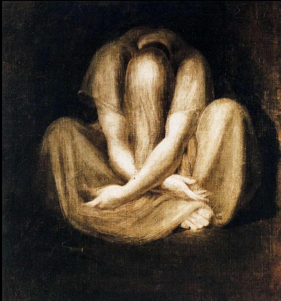
Silence -- Henry Fuseli, Kunsthaus Zurich, Zurich, Switzerland