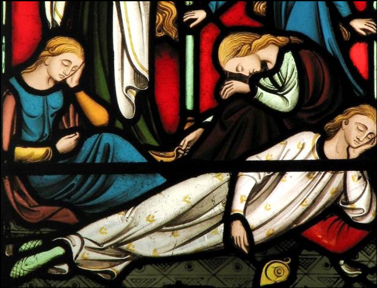
The Bridesmaids Sleeping -- Stained Glass, Church of St. Giles, Oxford, England