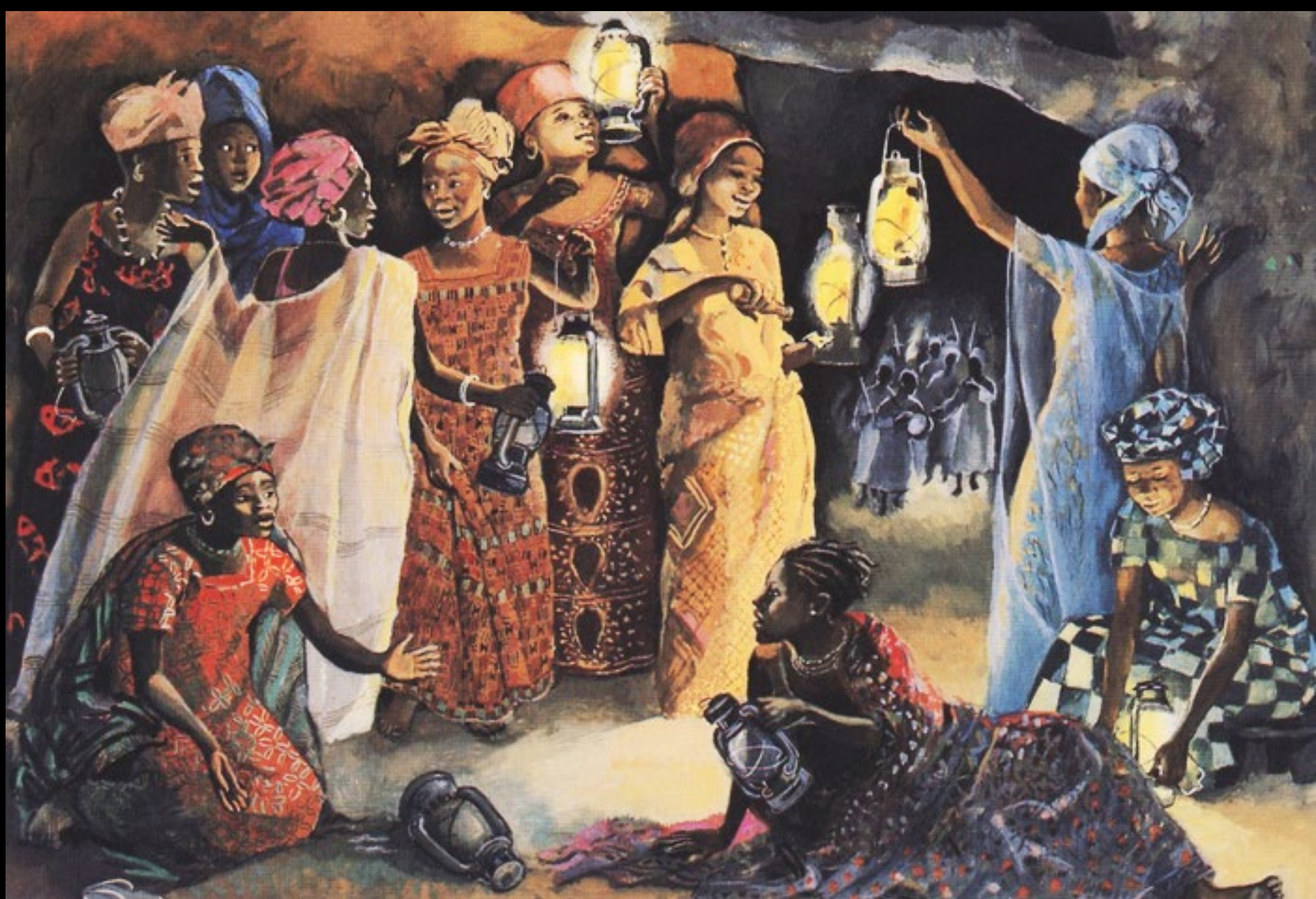
The Ten Bridesmaids -- JESUS MAFA, Cameroon