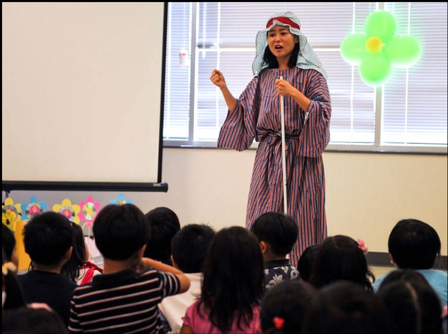
Sunday School -- Korean Central Presbyterian Church, Centreville, VA