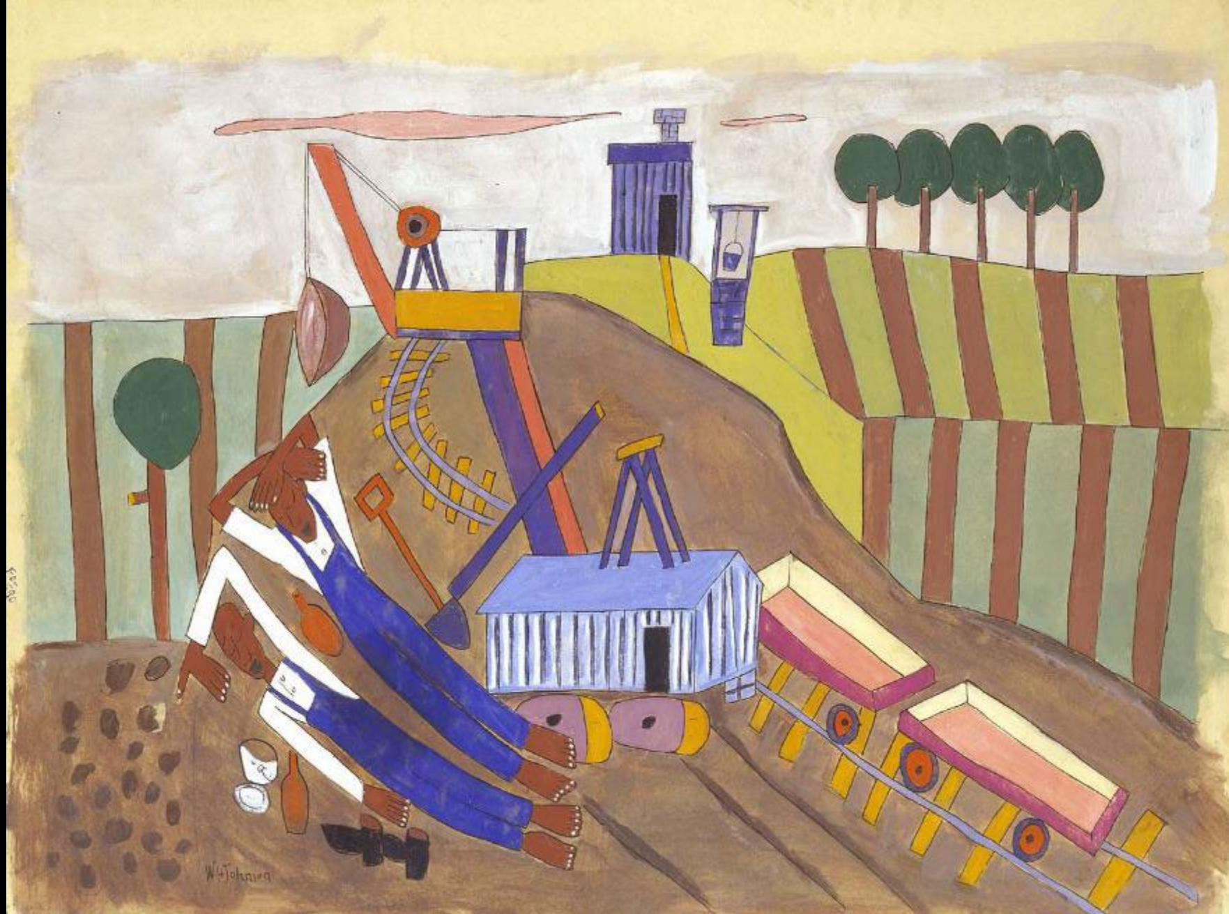
Lunchtime Rest -- William H. Johnson, Smithsonian Museum of American Art, Washington, DC