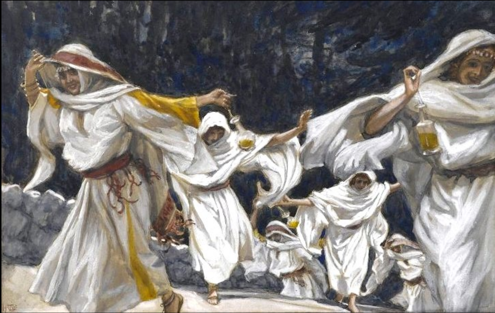
The Bridesmaids -- James Tissot, Brooklyn Museum, New York, NY