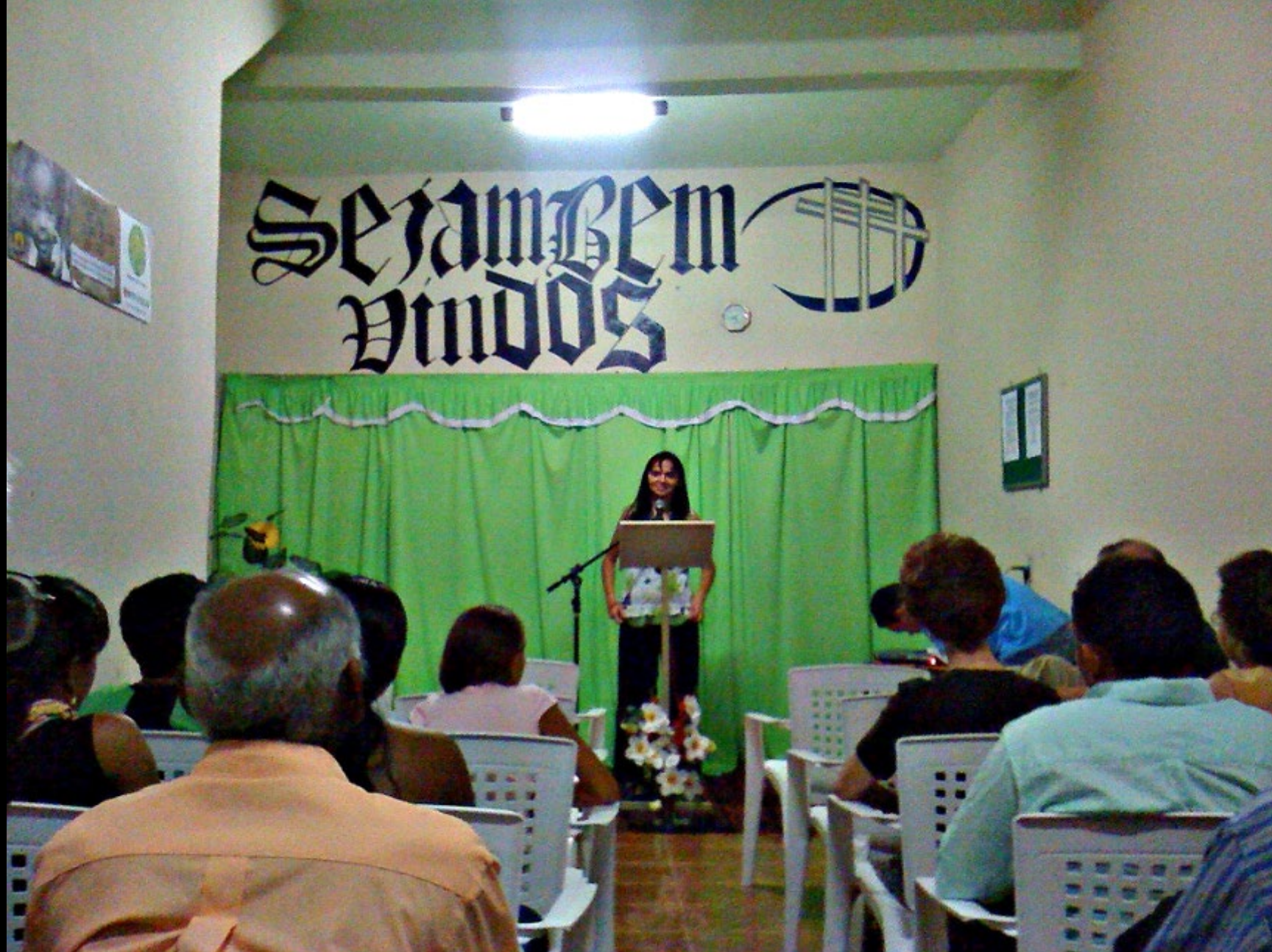
"Everyone is Welcome" -- Calvary Baptist Church, Brazil, Indiana