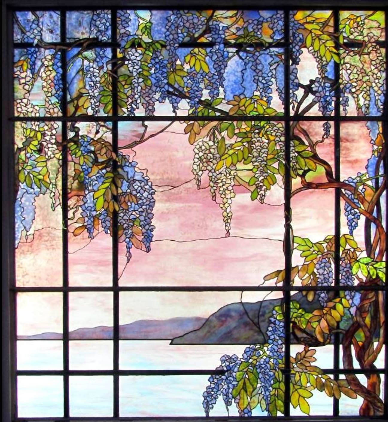
View of Oyster Bay

Tiffany Studios Metropolitan Museum of Art, New York, NY