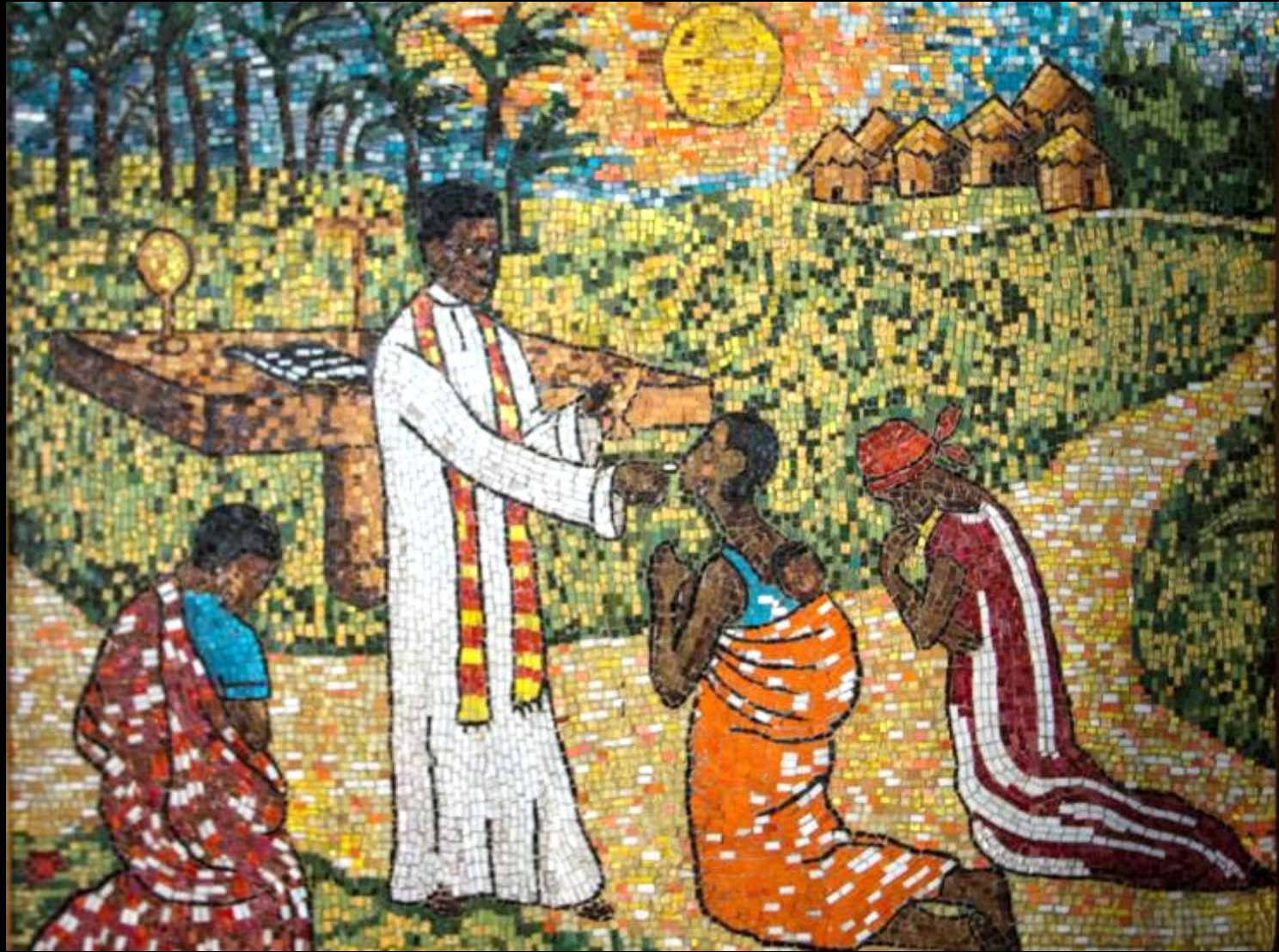
Sharing Communion -- Cathedral of St. Paul, Abidjan, Ivory Coast