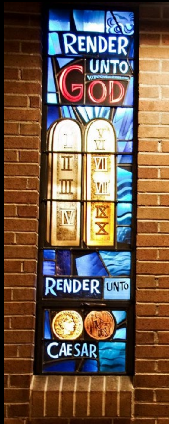
Render unto God Rambusch Company First Presbyterian Church, Boise, Idaho