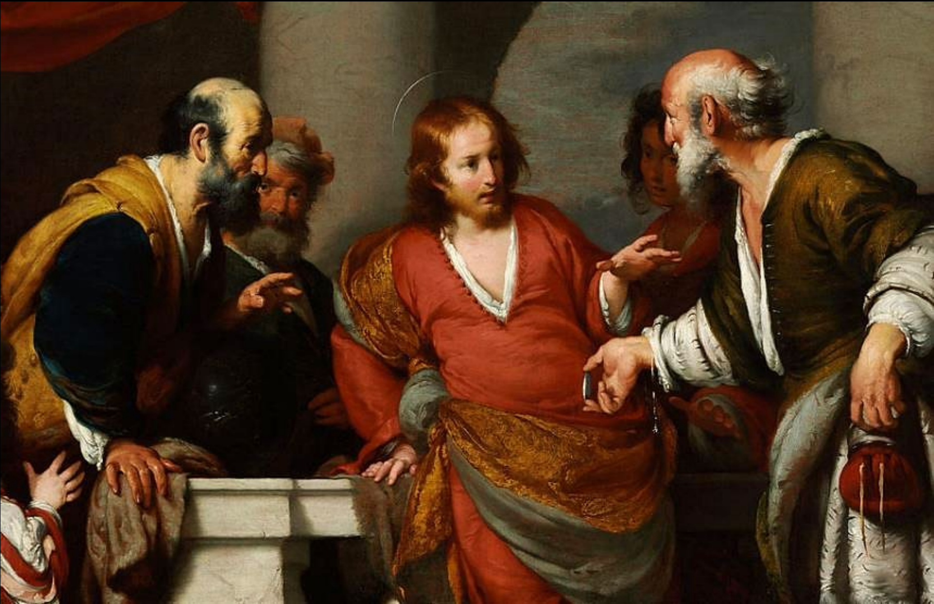
The Tribute Money -- Bernardo Strozzi, Museum of Fine Arts, Budapest, Hungary