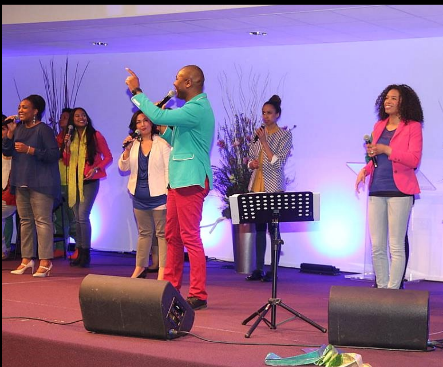
Singers and Choir -- Pentecostal Church of the Living Stone, Spijkenisse, Netherlands