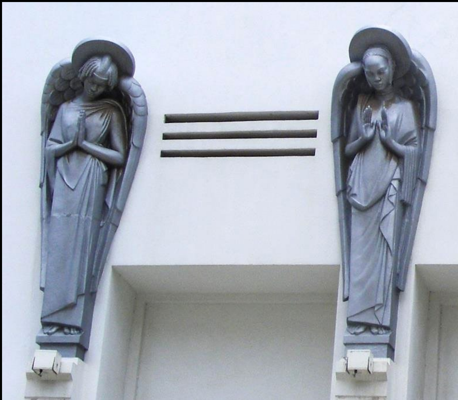
In Prayer Cathedral of Our Lady of Victories Dakar, Senegal