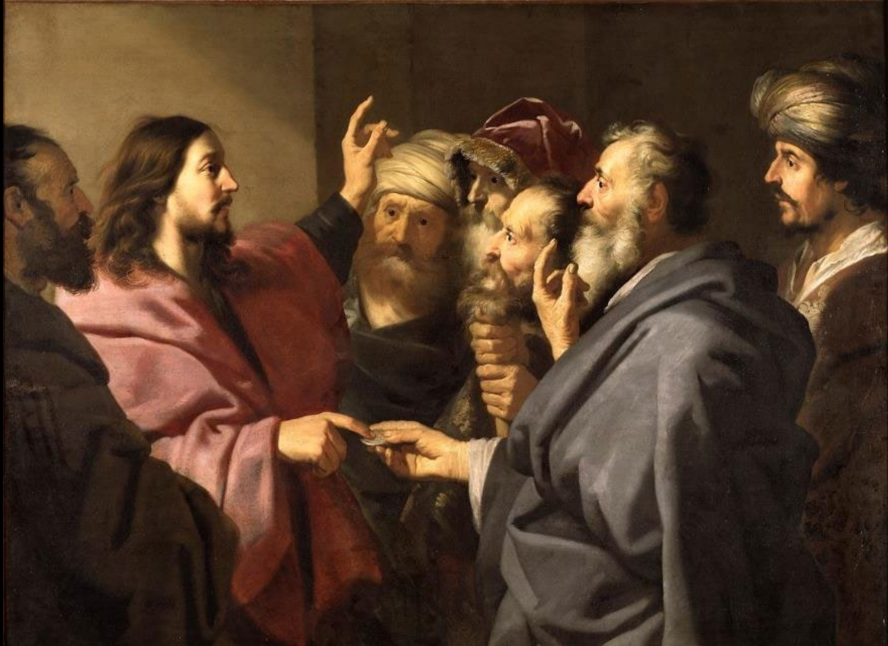
The Tribute Money -- Jacob Backer, National Museum, Stockholm, Sweden