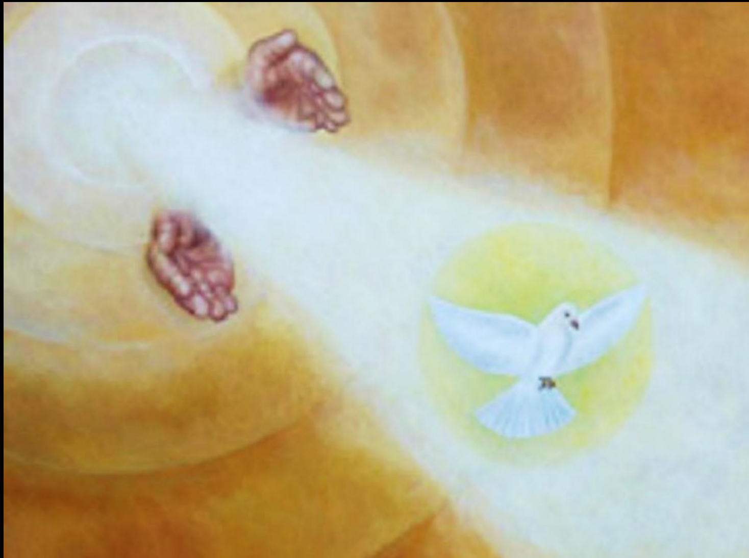
Church of the Holy Trinity, Caacupe, Paraguay