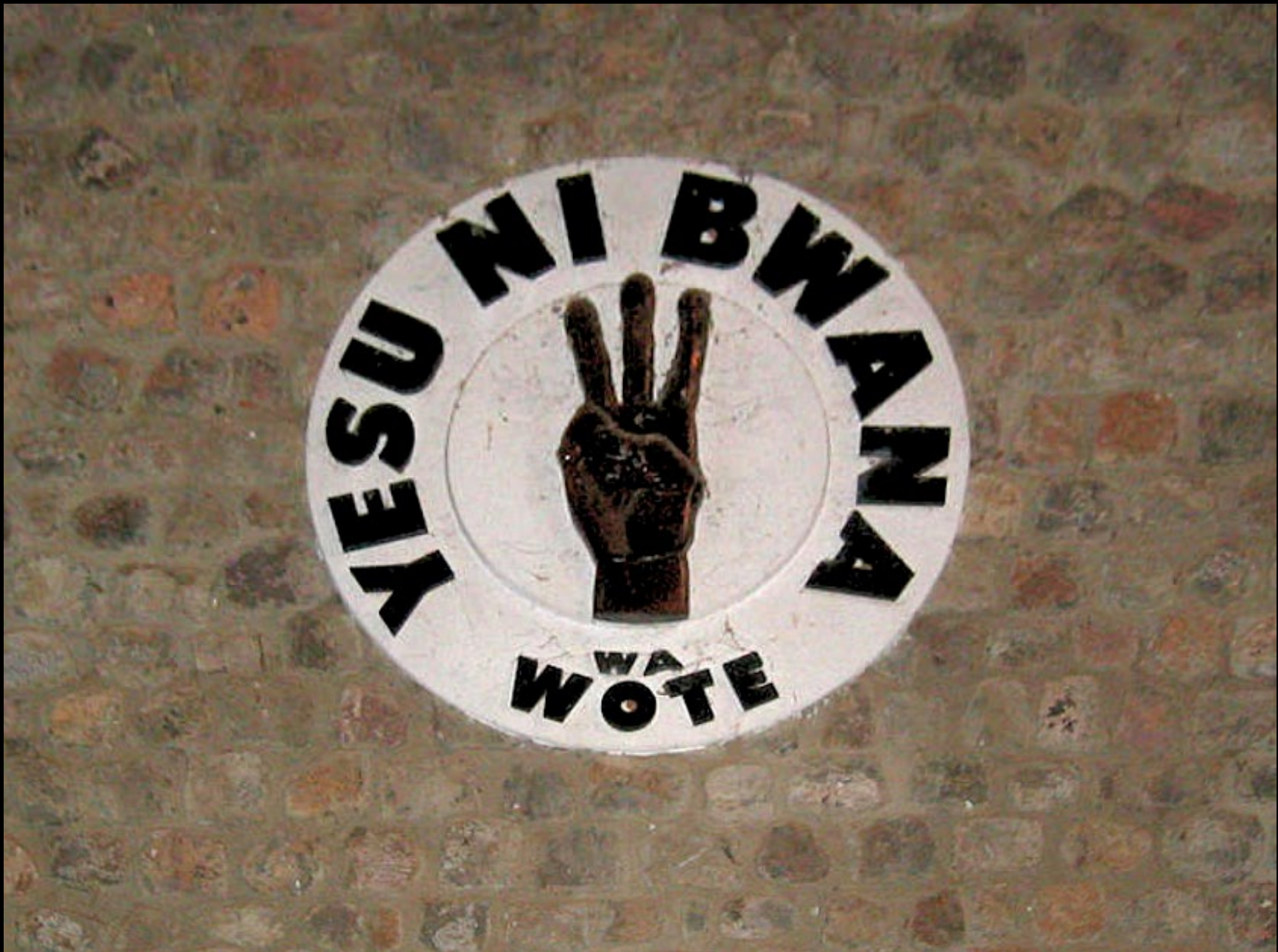
JESUS IS LORD! -- From a United Methodist Church in Congo (DRC)