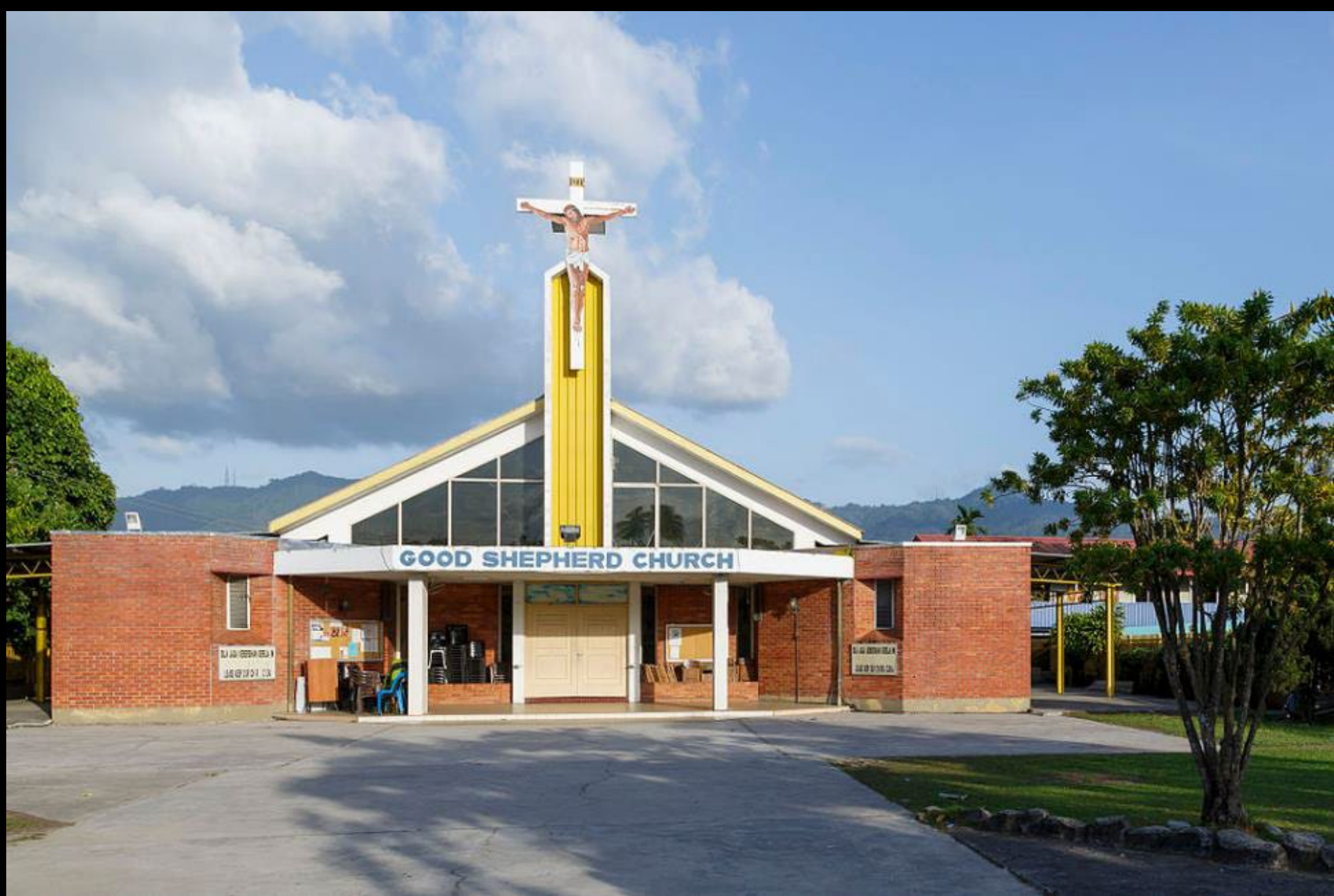
Good Shepherd Church -- Uwe Aranas, Menggatal, Malaysia