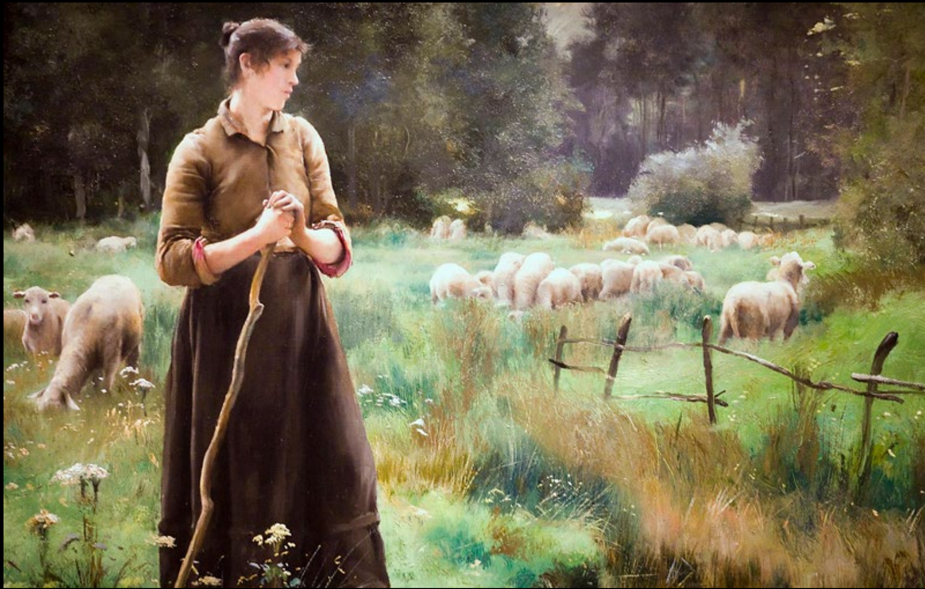
The Good Shepherd -- Julien Dupre, Legion of Honor Museum, San Francisco, CA