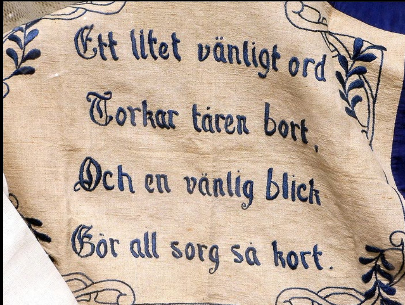
“As Single, Kind Word Wipes Away the Tears...” -- Swedish embroidery