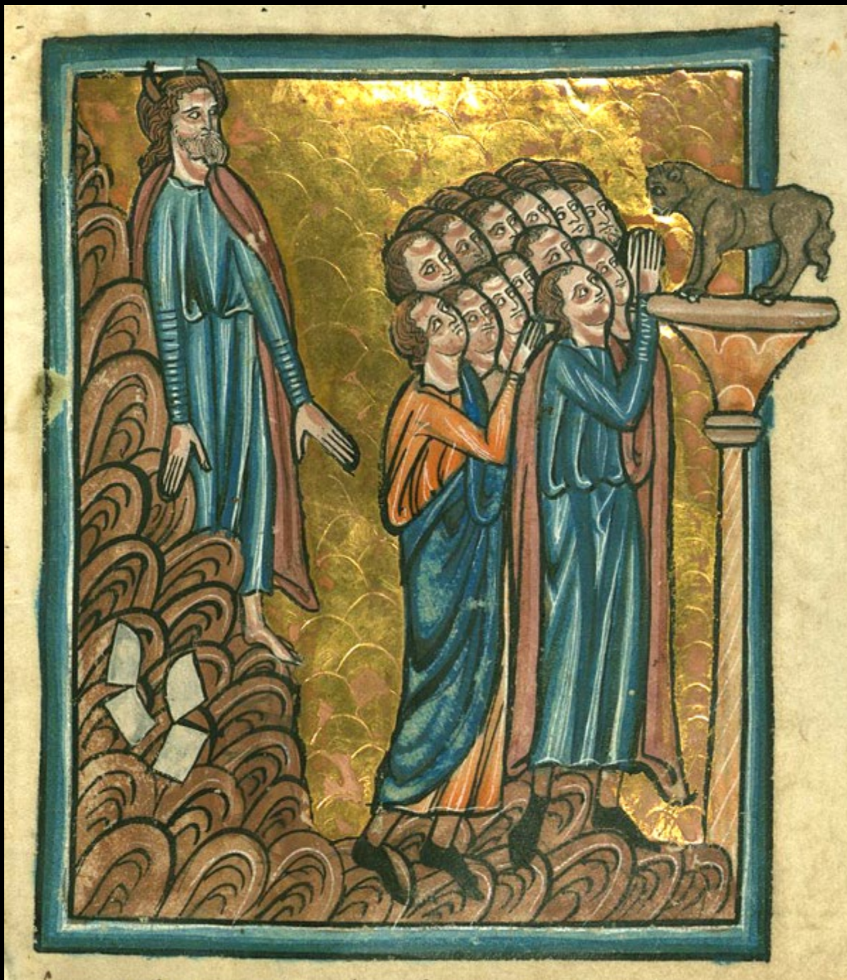
Worshipping the Golden Calf

William de Brailes Walters Art Museum Baltimore, MD