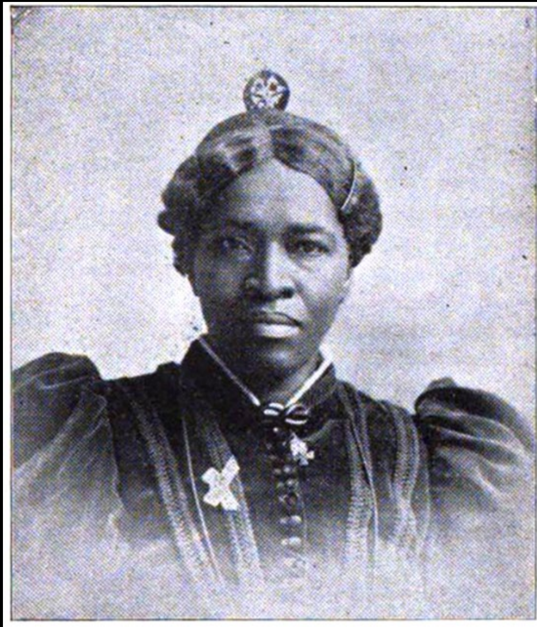
Amanda Berry Smith, Methodist Evangelist