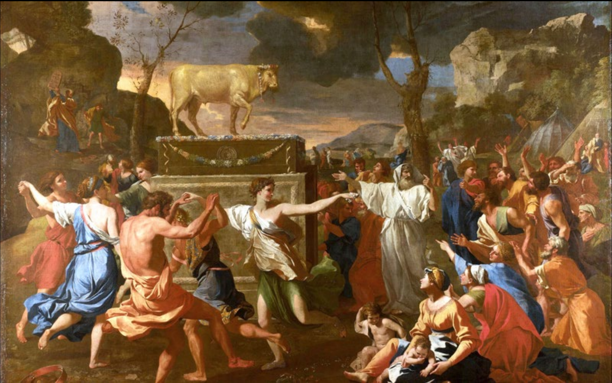
Adoration of the Golden Calf -- Nicolas Poussin, National Gallery, London, UK