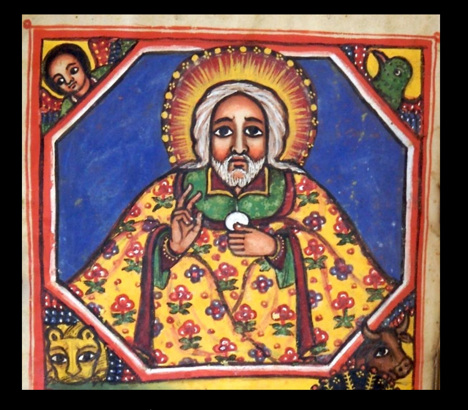
Face of God -- Ethiopian 18<sup>th</sup> c. manuscript, Church of Narga Selassie, Lake Tana, Ethiopia