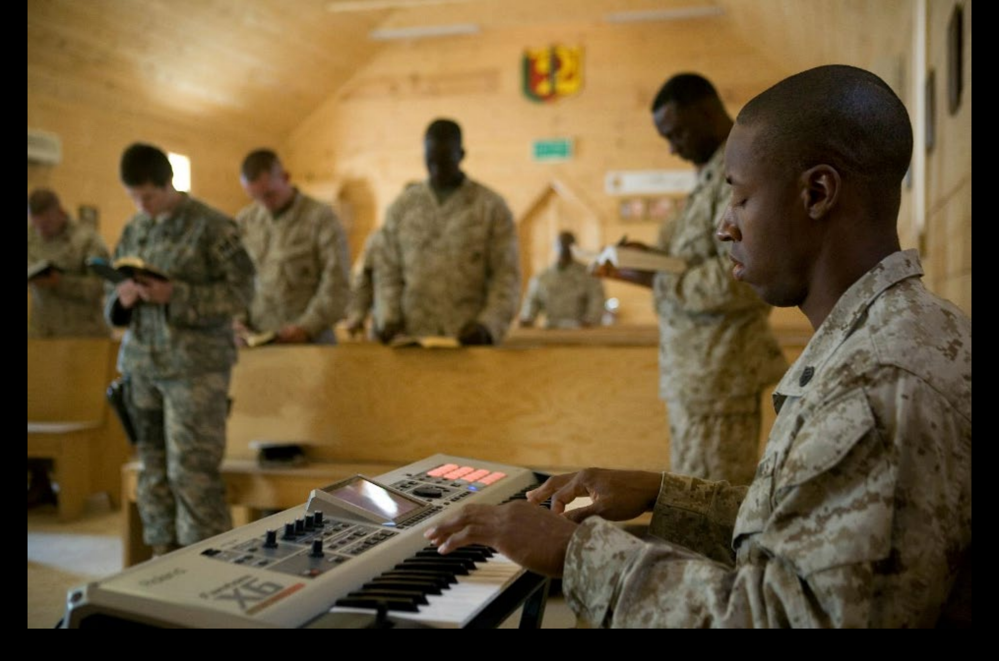
Marine Regimental Combat Team Worship Service, Camp Ripper Chapel, Al Asad, Iraq