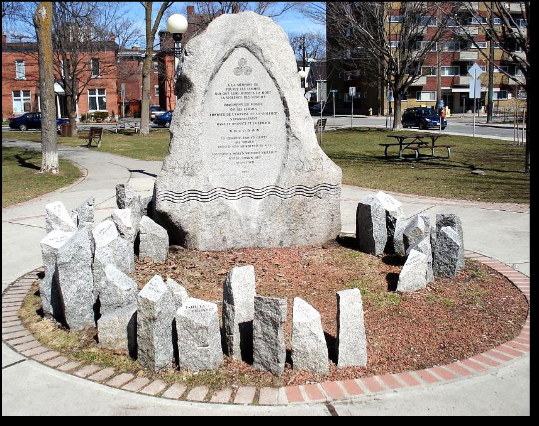
Enclave: Monument to Victims of Domestic Violence -- Ottawa, Canada