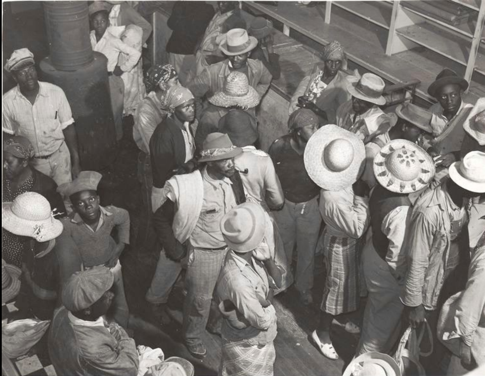
Day Laborers Brought In By Truck From Nearby Towns, 1939