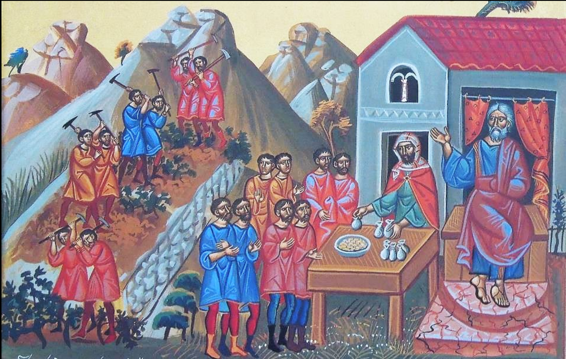
Orthodox Icon of Laborers in the Vineyard