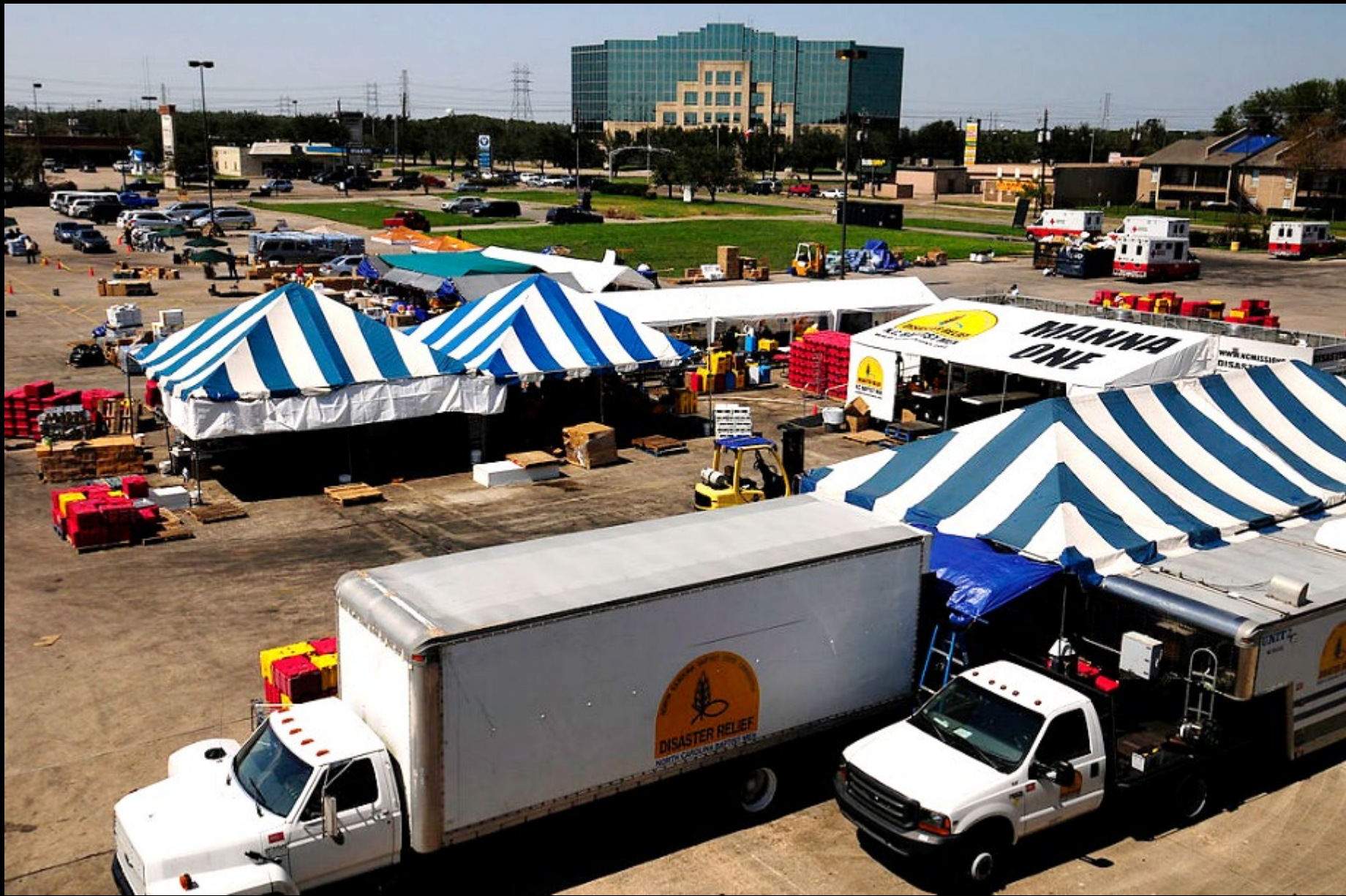
"Manna 1" -- An aerial view of the North Carolina Baptist Men's disaster kitchens, Texas floods