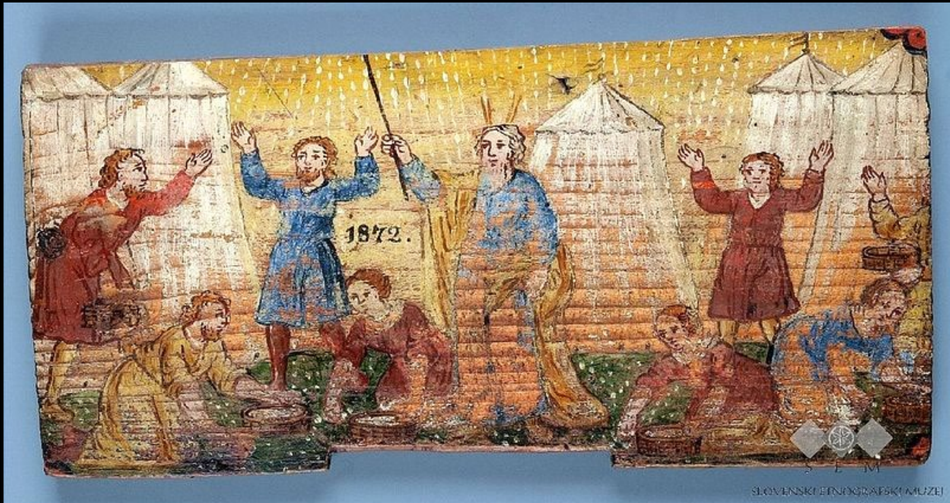
Moses and the Israelites -- Slovenia Ethnographic Museum, Ljubljana, Slovenia