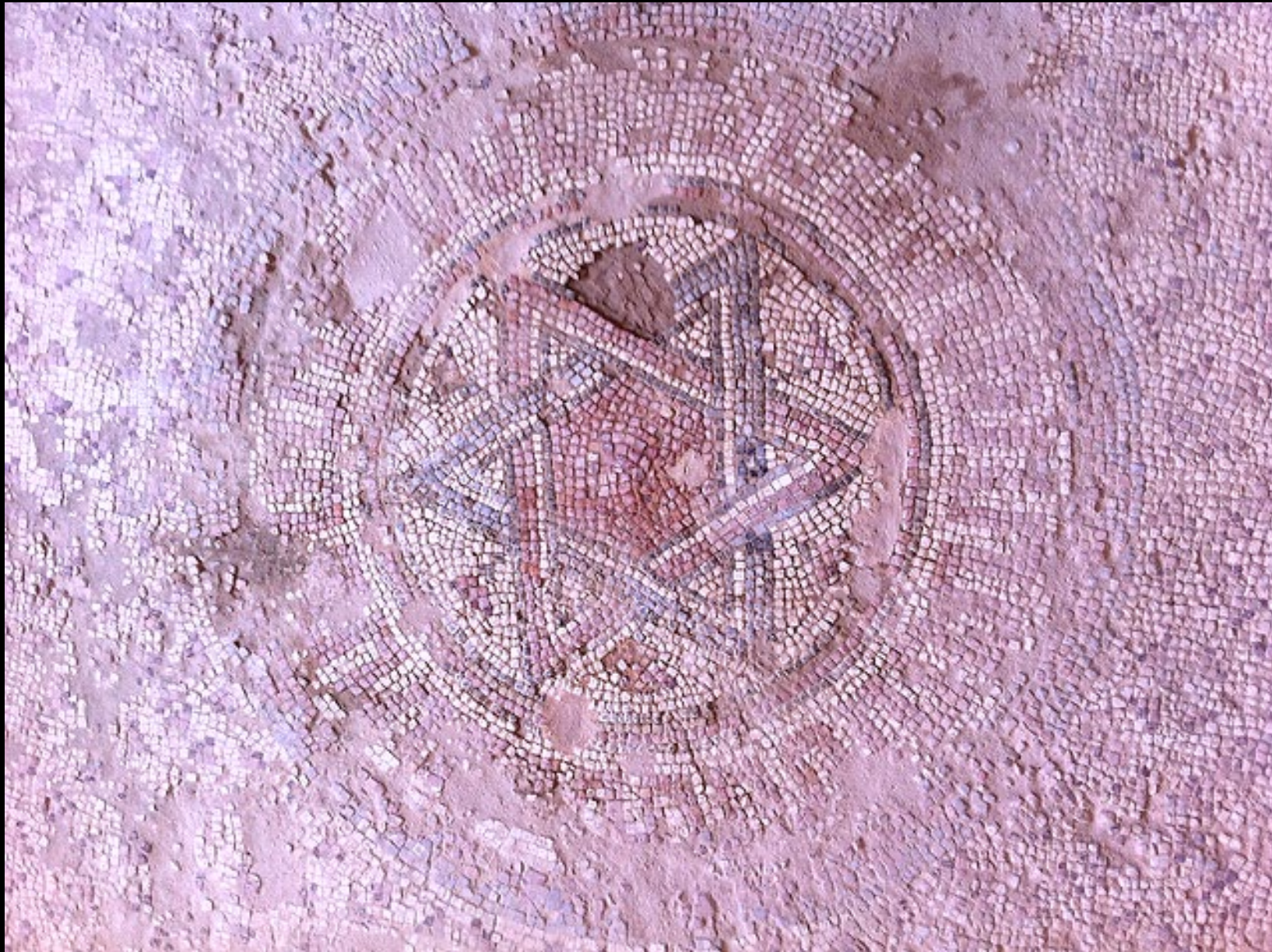
Star of David -- Fourth century C.E., Byzantine Basilica, Shilo, Israel