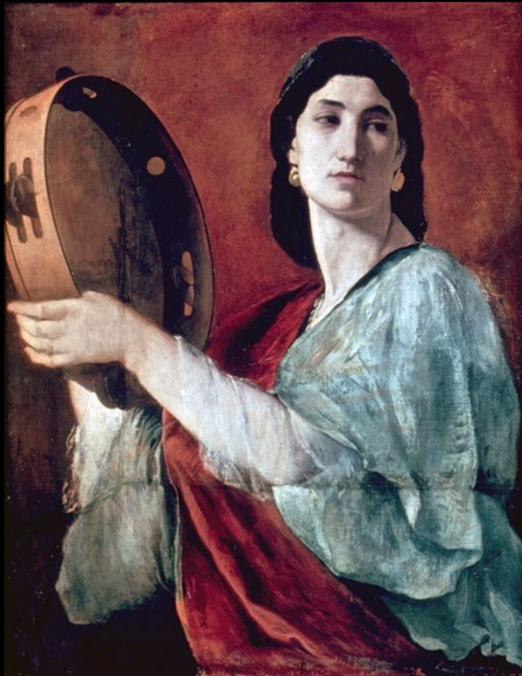
The Prophet Miriam

Anselm Feuerbach Berlin State Museums Berlin, Germany