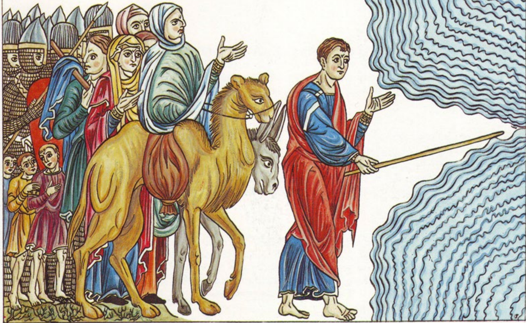
Crossing of the Red Sea -- Abbess of Hohenburg, Hortus Deliciarum

Dixit Dñs ad Moysen Eleva virgam tuam & extende manum tuam super mare & divide illud ut gradientur filii Israel in medio mari per siccum