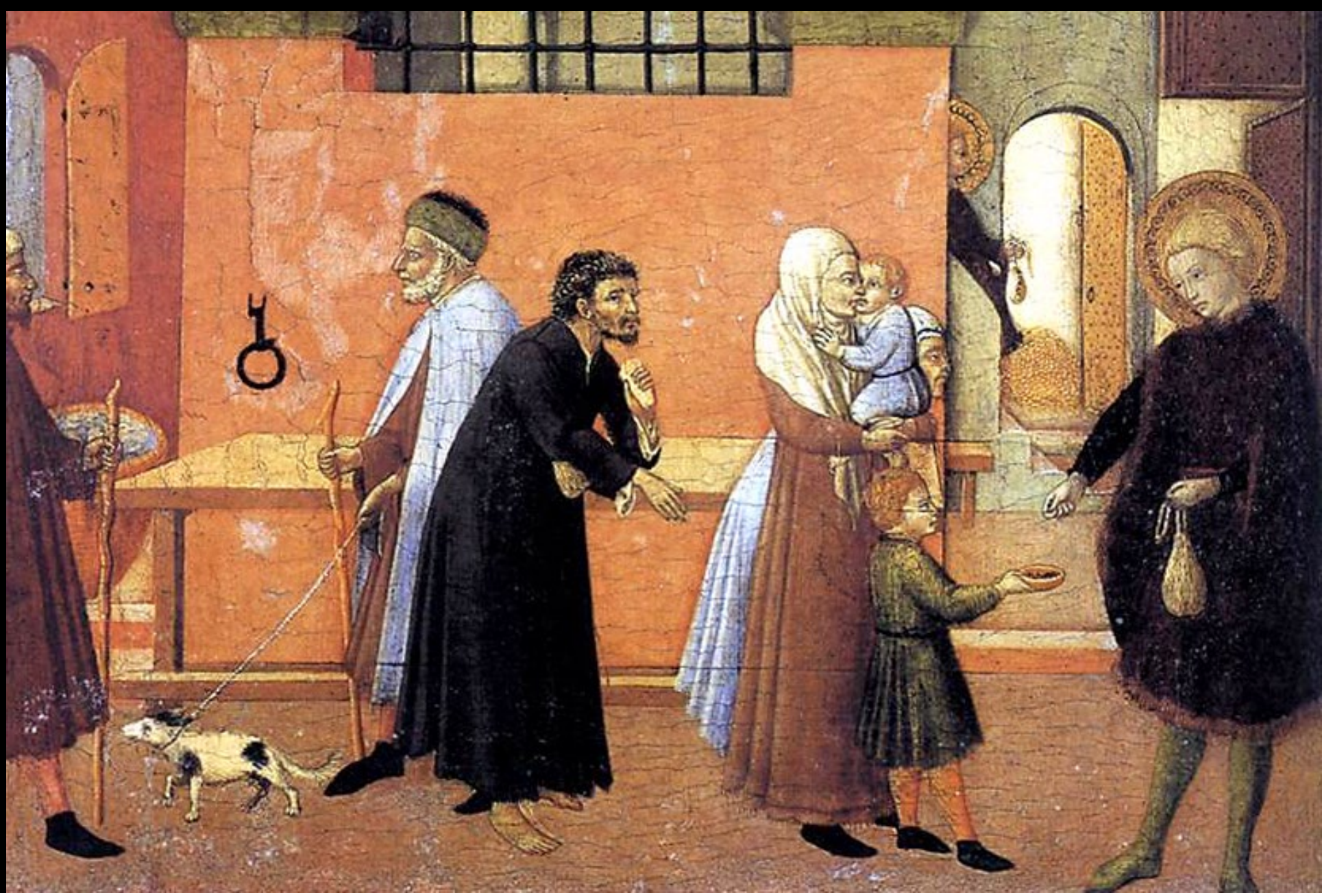
St. Lawrence Distributing the Riches of the Church -- Master of the Osservanza, National Gallery, Washington, DC