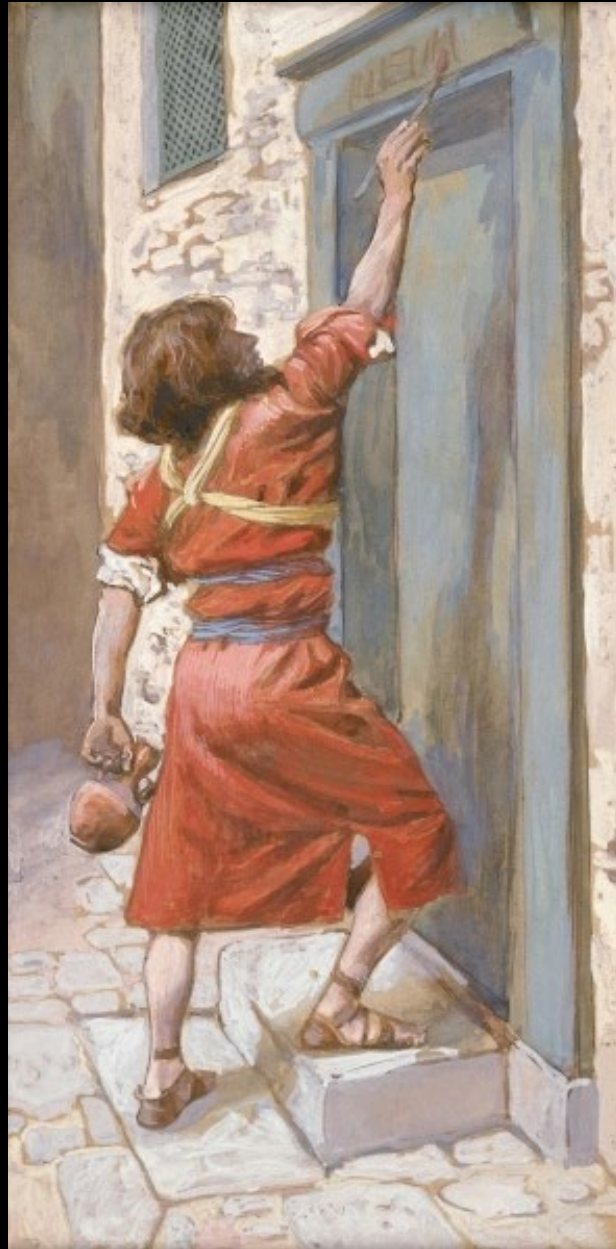
Signs on the Door -- James Tissot, Jewish Museum, New York City