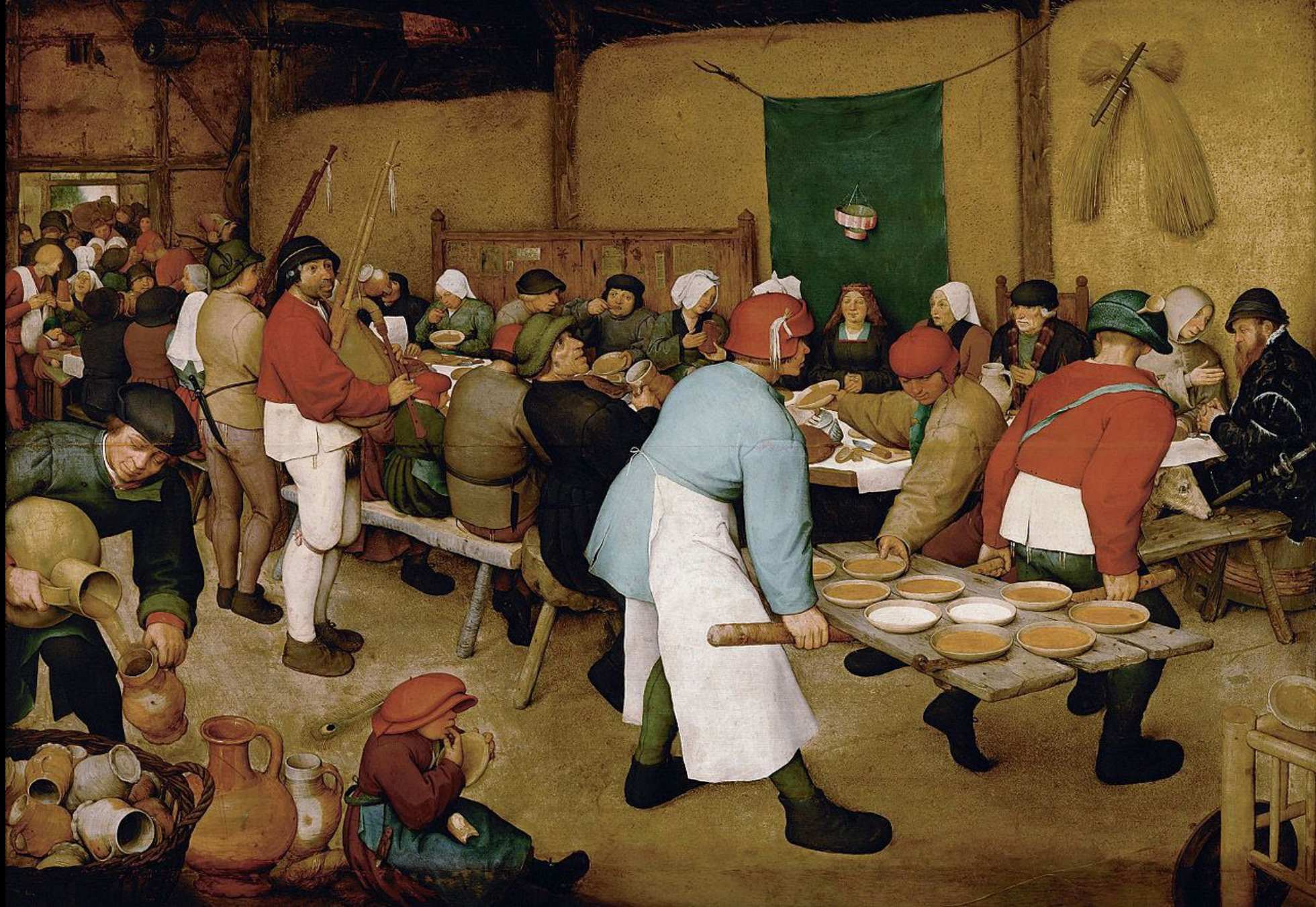
Peasant Wedding-- Pieter Bruegel, Kunsthistorisches Museum, Vienna, Austria