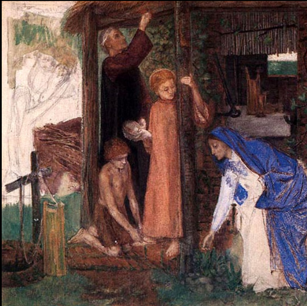
The Passover in the Holy Family -- Dante Rossetti, Tate Britain, London, England