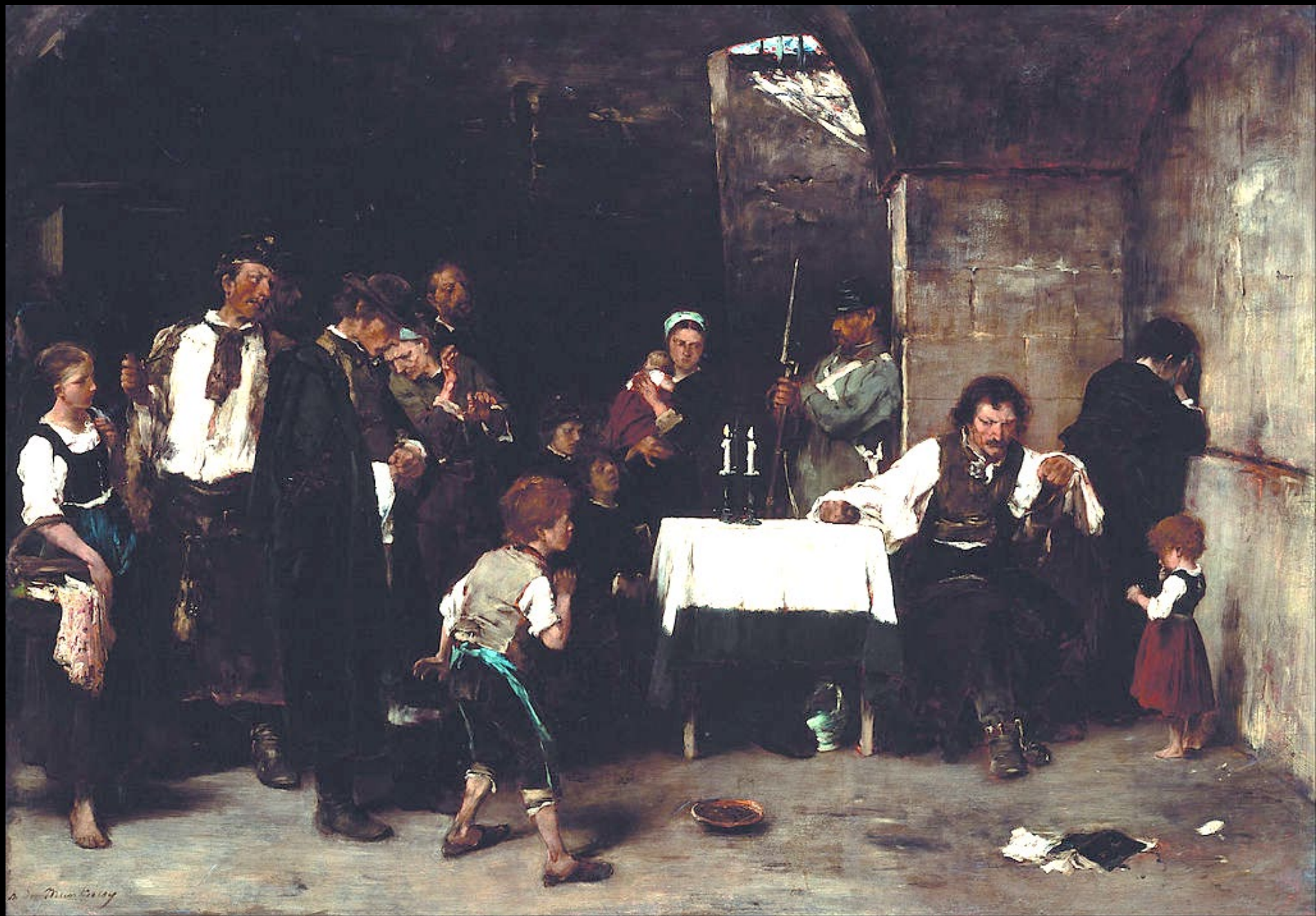
Cell of the Condemned -- Mihaly Munkacsy, Hungarian National Gallery, Budapest, Hungary