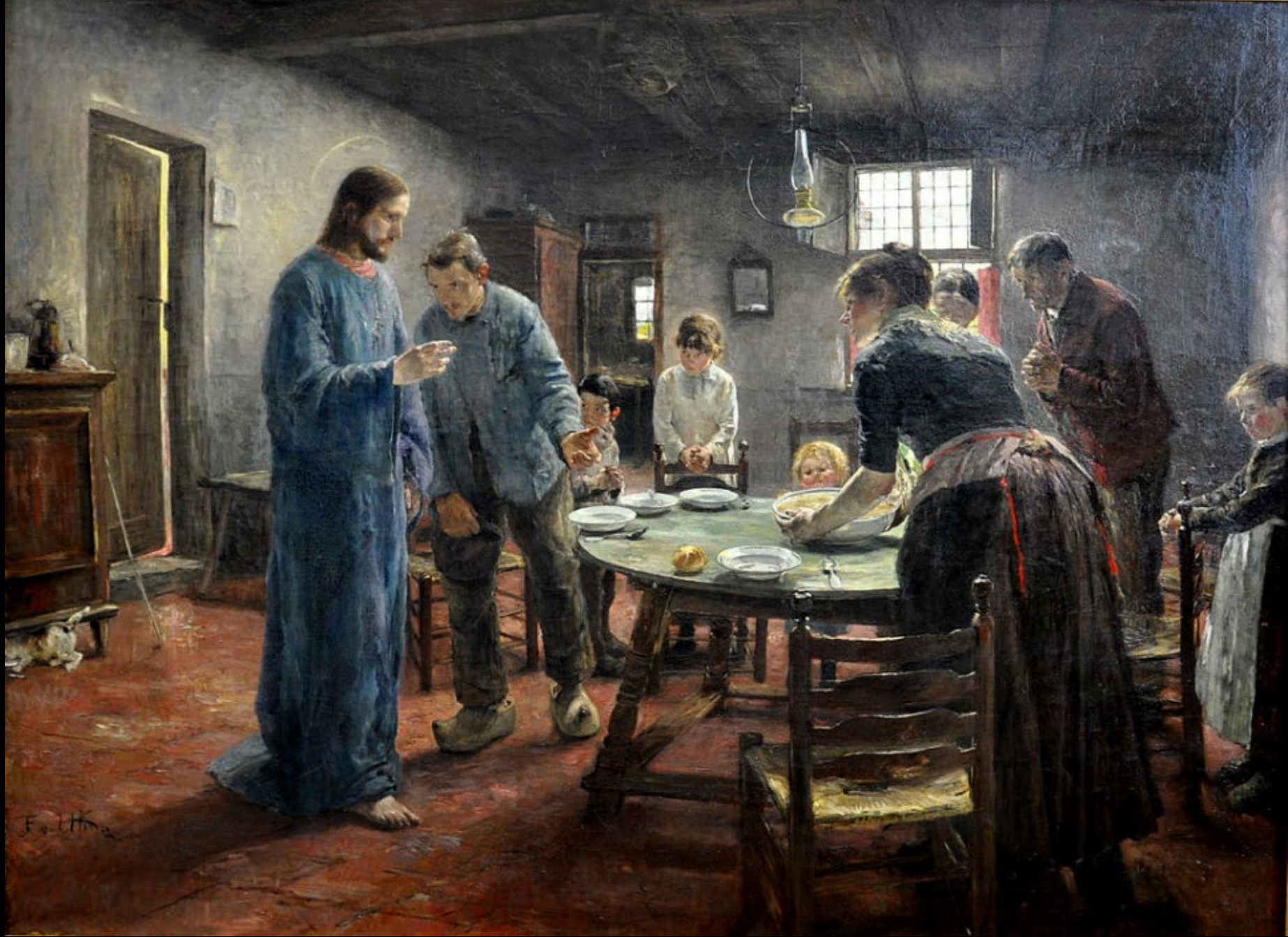
The Mealtime Prayer -- Fritz von Uhde, Alte Nationalgalerie, Berlin, Germany