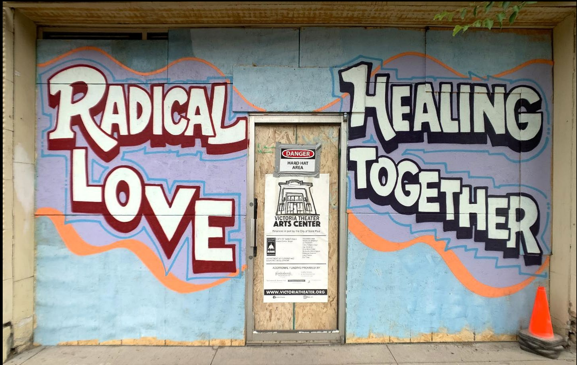
Street Art Response to George Floyd's Death -- St. Paul, MN