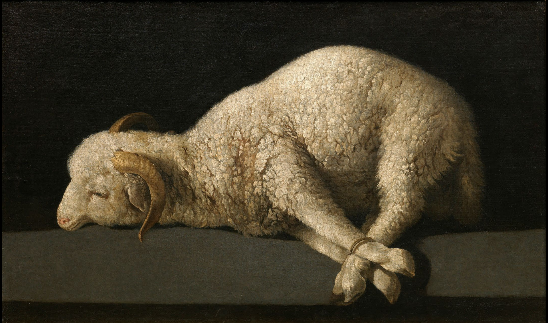
A Lamb -- Francisco Zurbaran, Prado Museum, Madrid, Spain