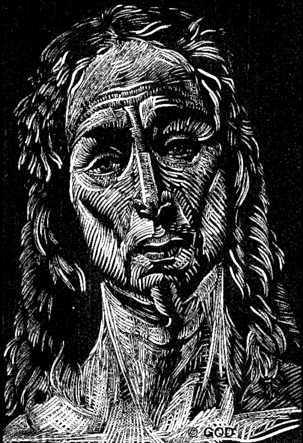
The Risen Christ

Bramantino Civico Museo d'Arte Antica Milan, Italy