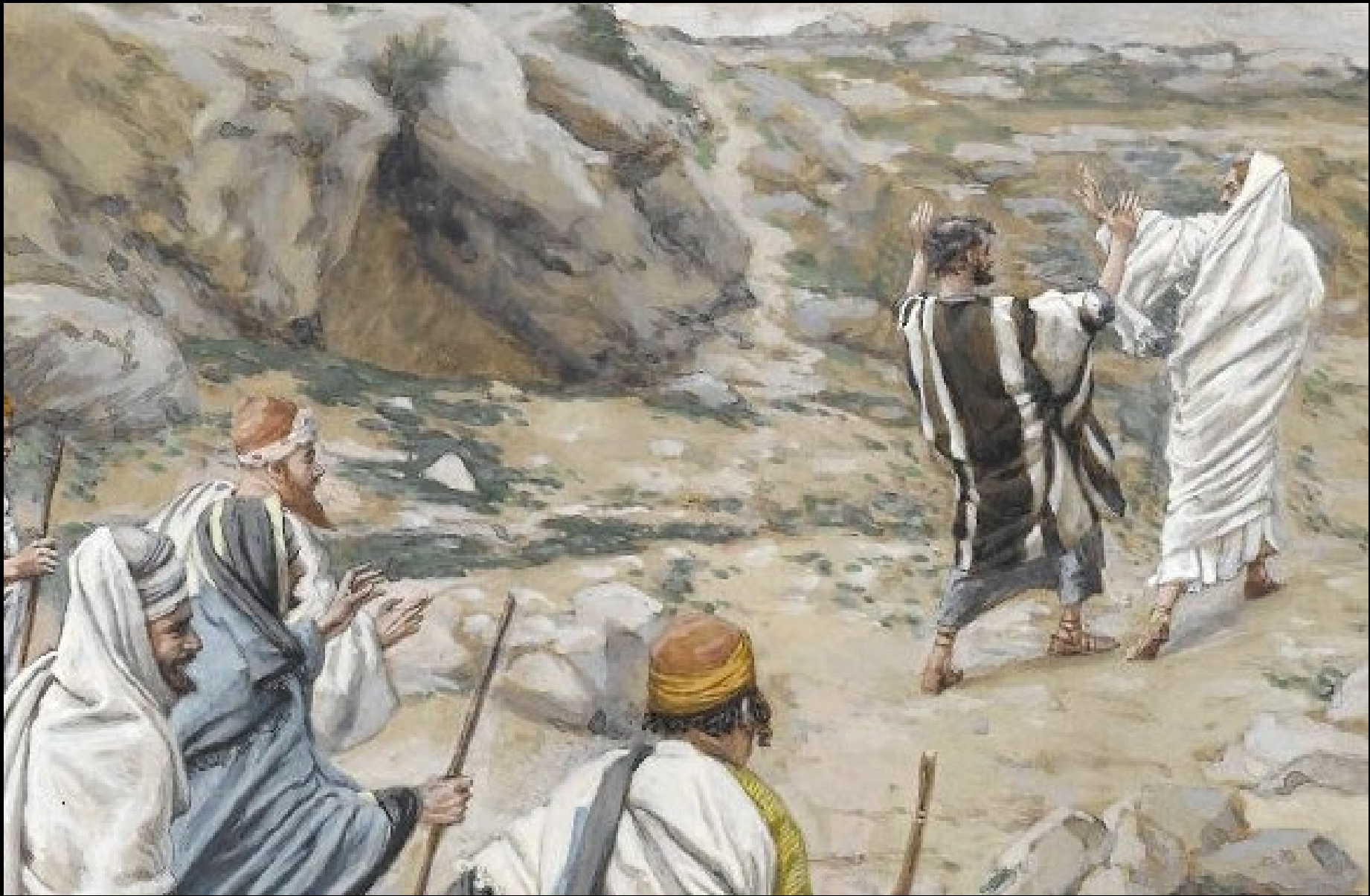
"Get Thee Behind Me, Satan!" -- James Tissot, Brooklyn Museum, Brooklyn, NY