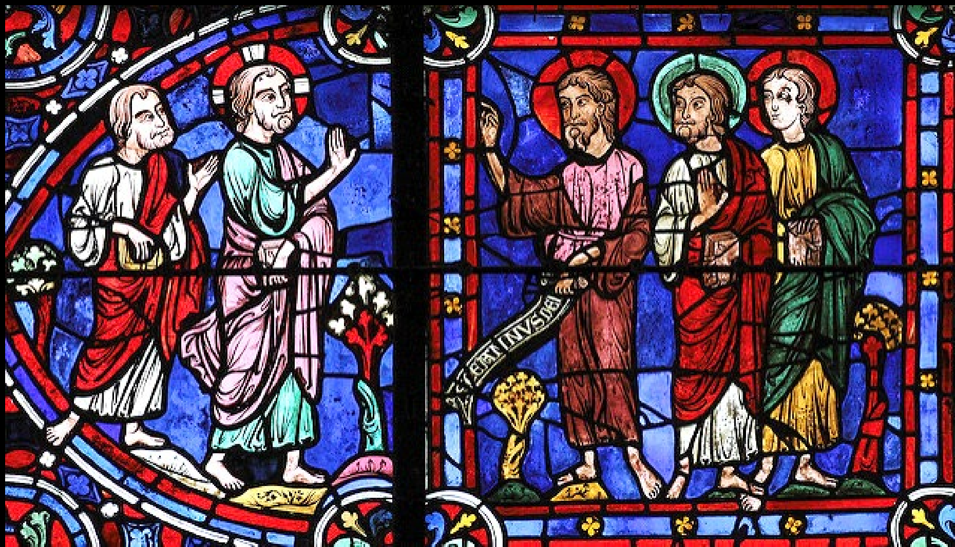
Jesus with Disciples -- Chartres Cathedral, Chartres, France