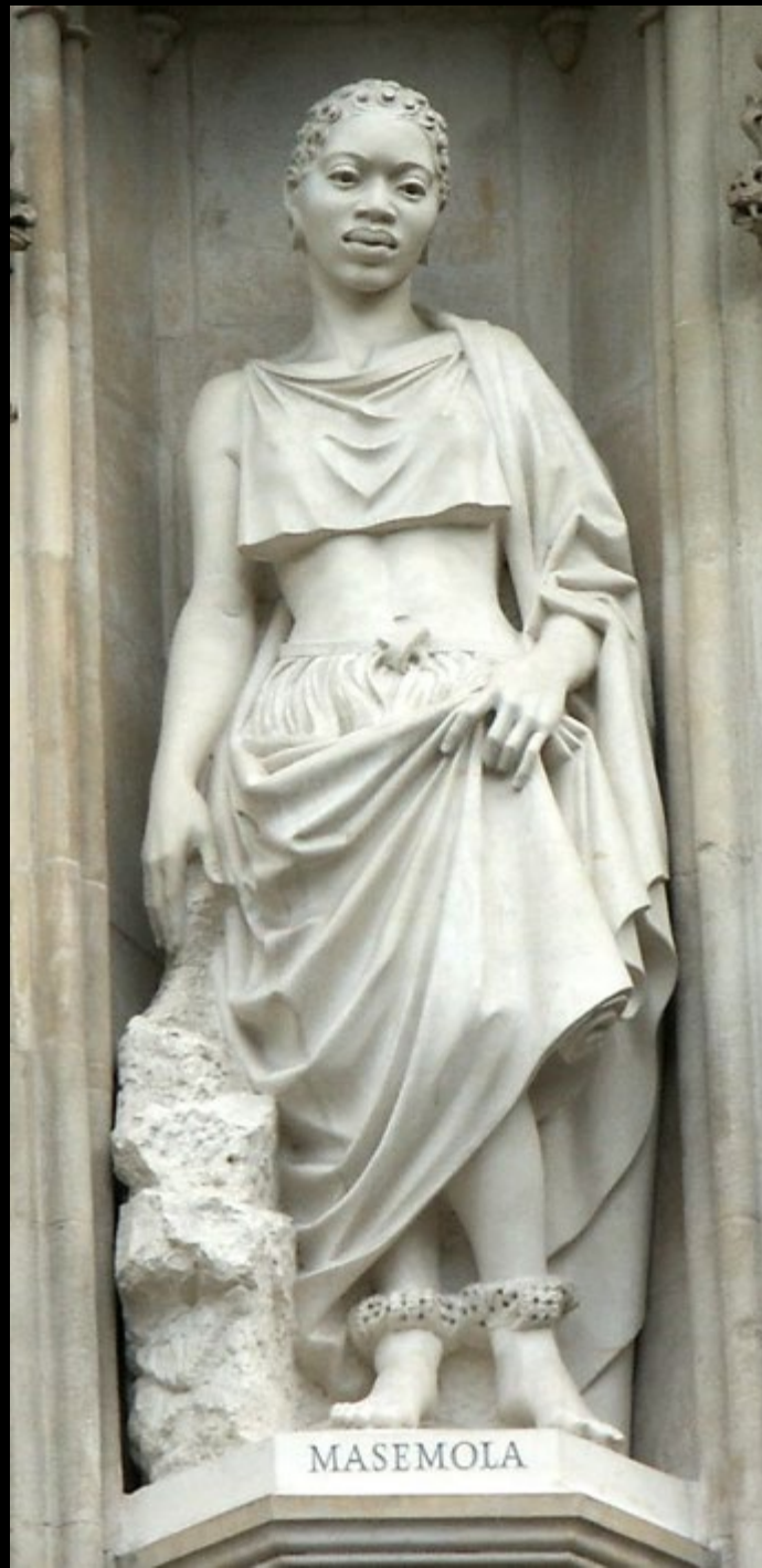
Manche Masemola South African Christian Martyr