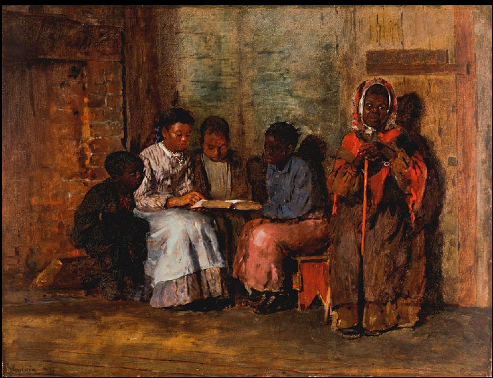
Sunday Morning in Virginia -- Winslow Homer, Cincinnati Art Museum, Cincinnati, OH