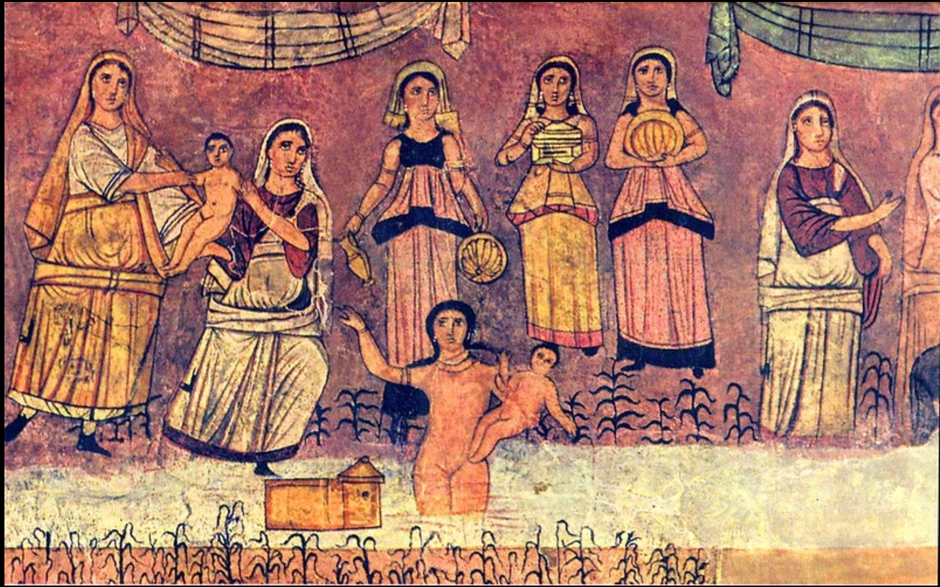
Shiphrah, Puah, Jocheved, Miriam, Pharoah's Daughter, and the infant Moses – Dura Europos