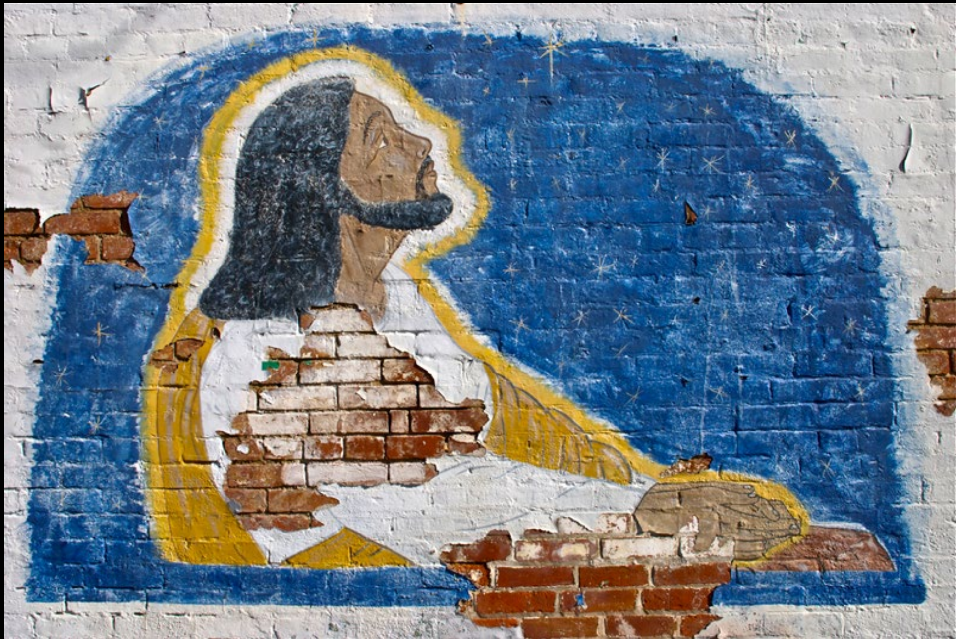
Jesus Praying -- Mural, Louisville, KY