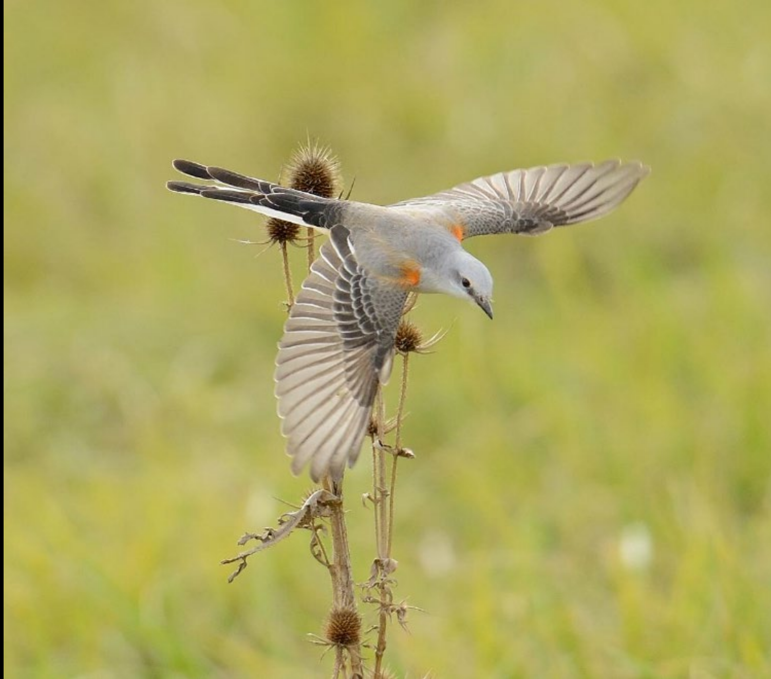
Scissor-tailed Flycatcher -- Former Landfill, Techny Overlay District, Northbrook, IL