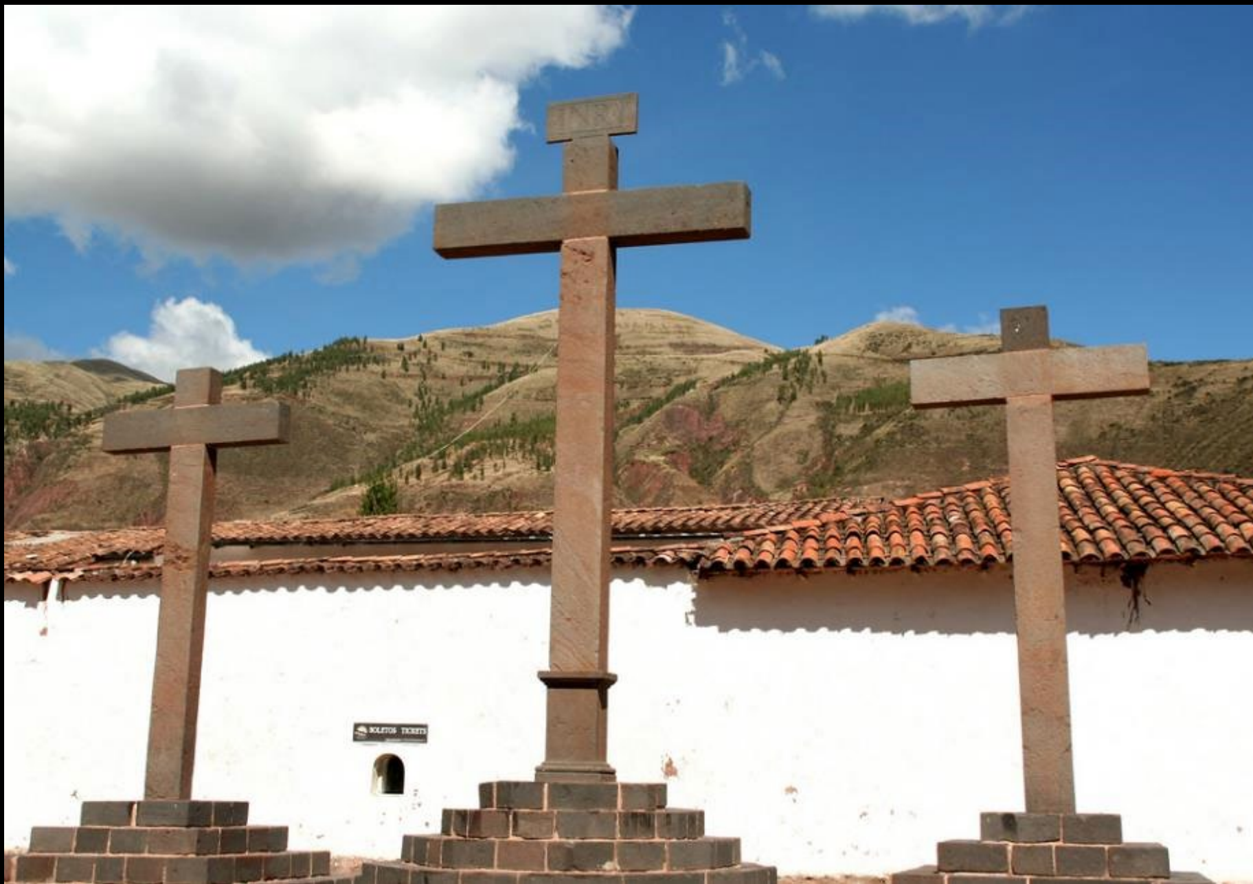
Church of St. Peter and St. Paul -- Andahuaylillas, Peru