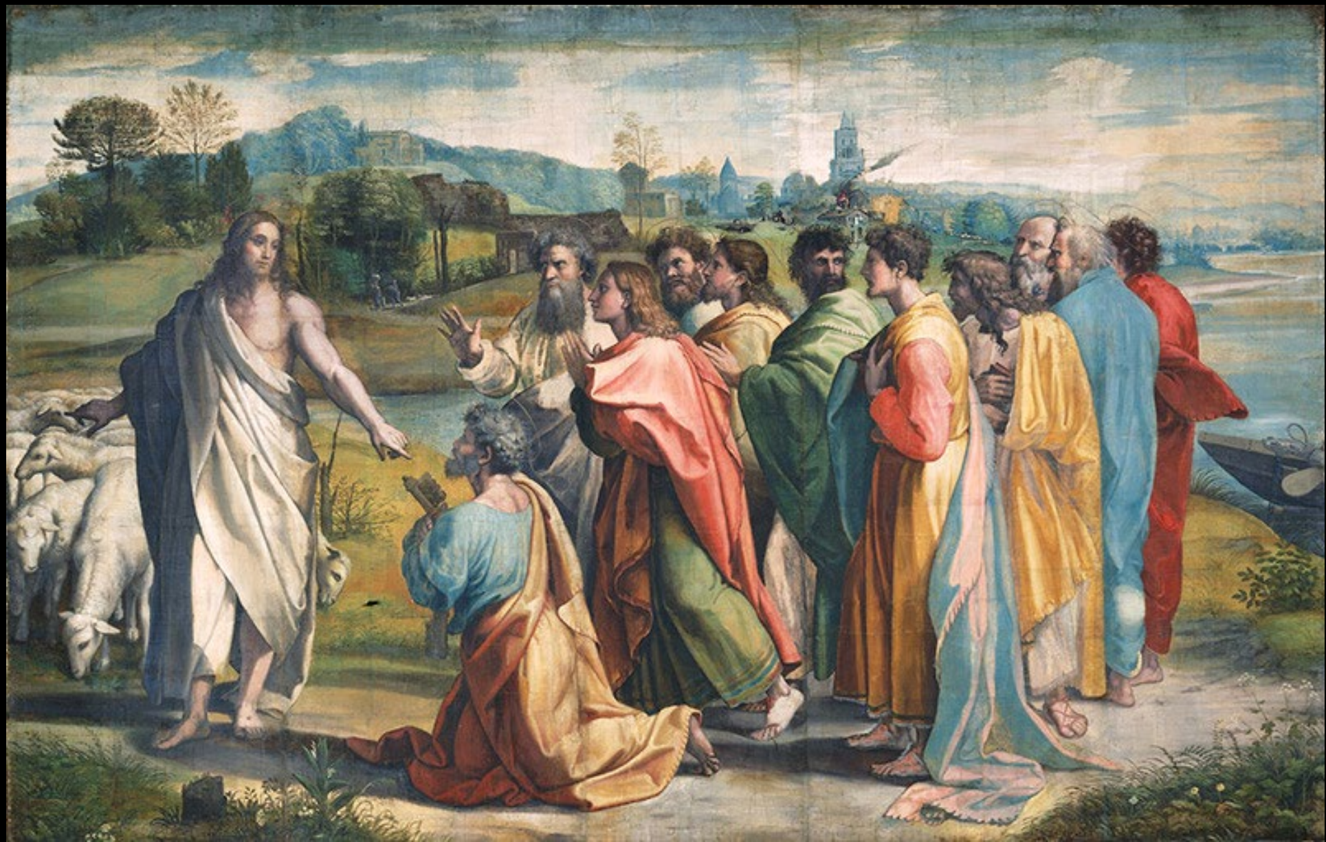
Peter Proclaims the Christ -- Raphael, Victoria and Albert Museum, London, England