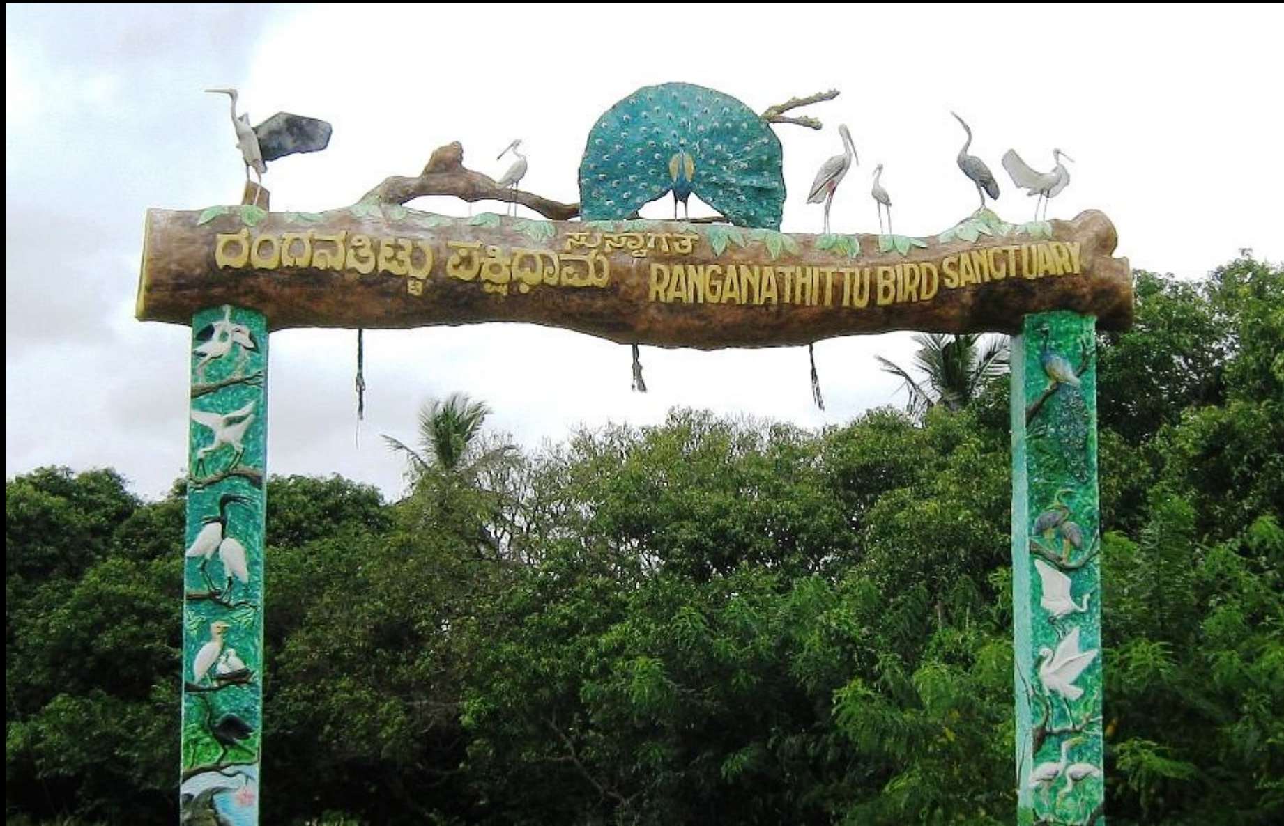
Ranganthittu Bird Sanctuary, Mysore, India