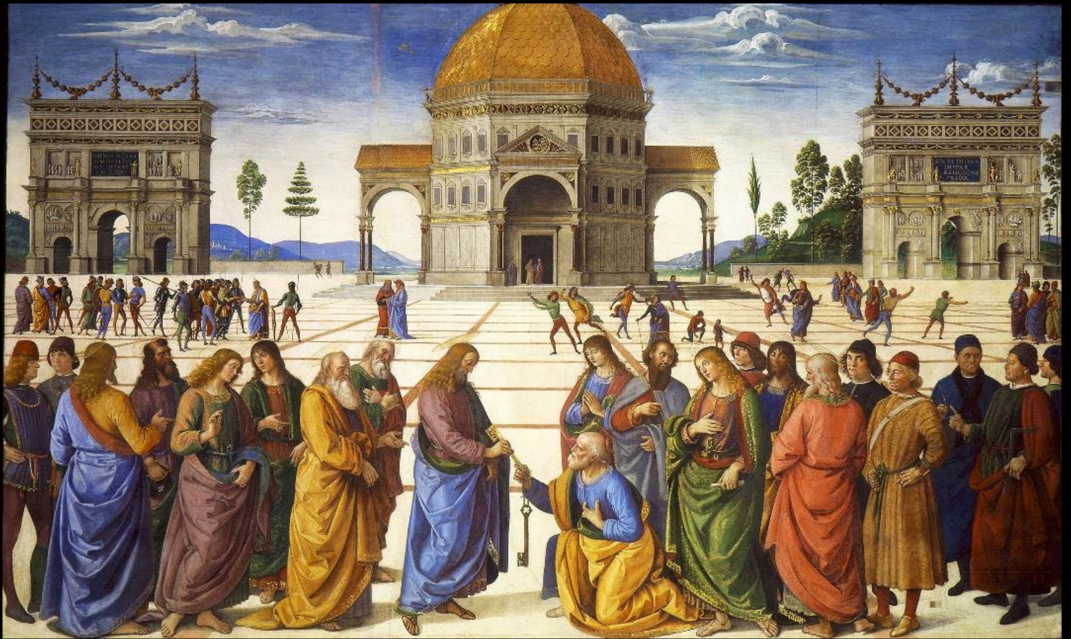
Christ Gives Keys of Kingdom to Peter -- Perugino, Sistine Chapel, Vatican City