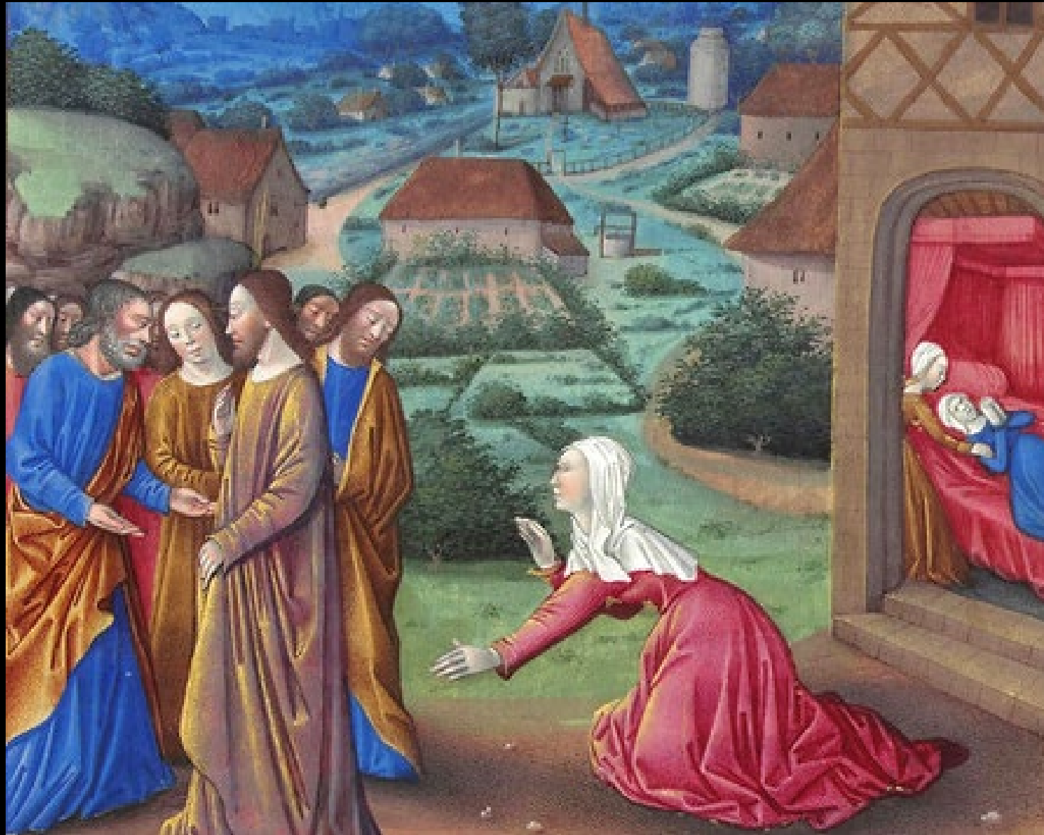
Christ and the Canaanite Woman -- Limbourg Brothers, Musee Conde, Chantilly, France