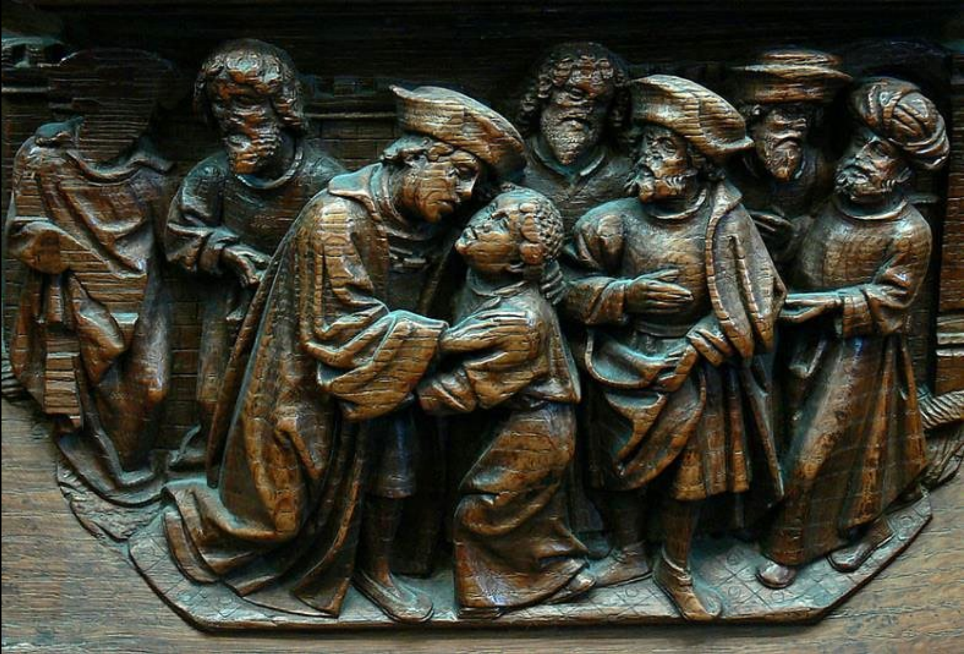
Joseph Meets His Brothers -- Choirstall woodcarving, Amiens Cathedral