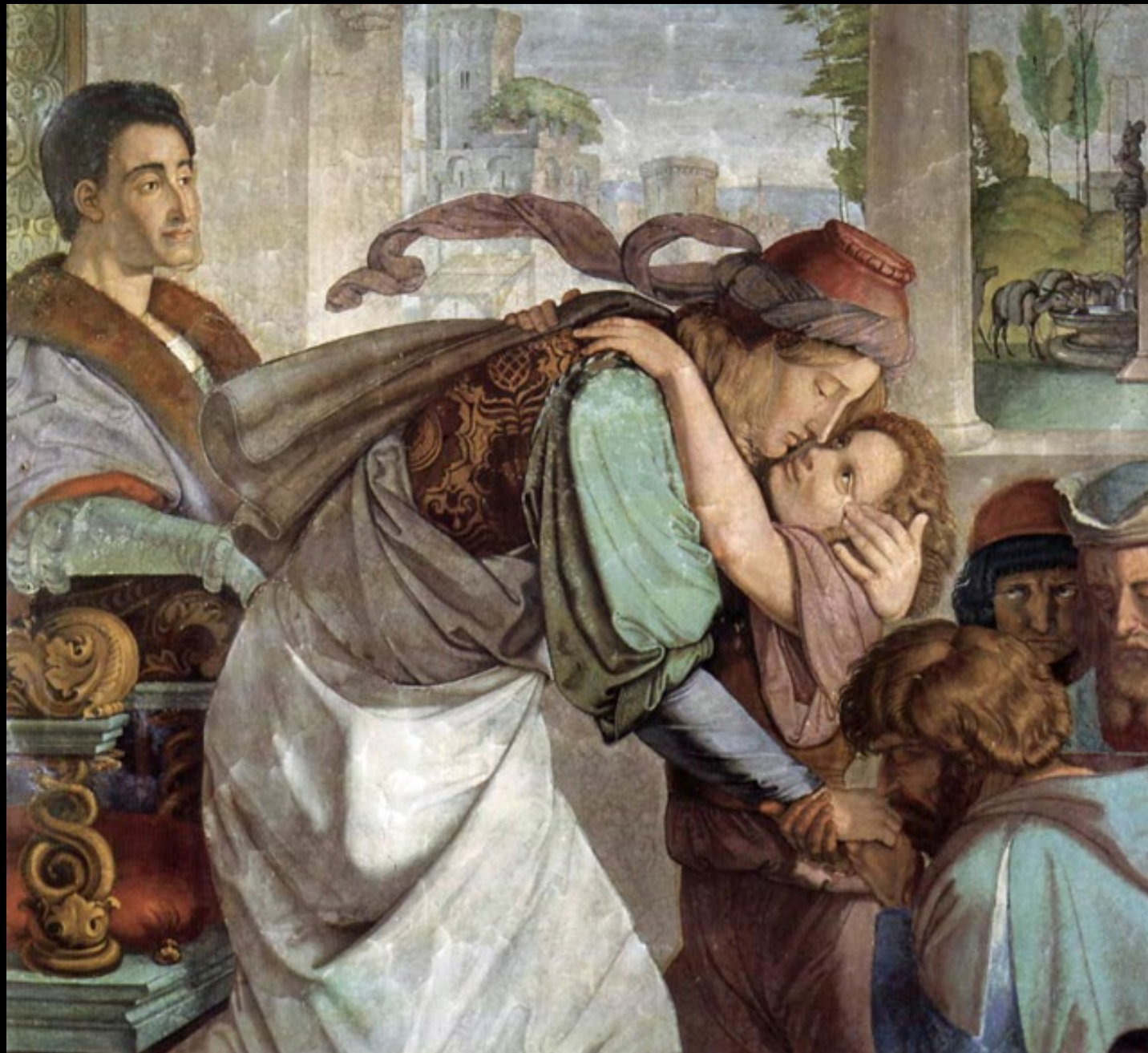
Joseph Embraces His Brothers -- Peter von Cornelius, Deutsche Akademie Villa Massimo, Rome, Italy