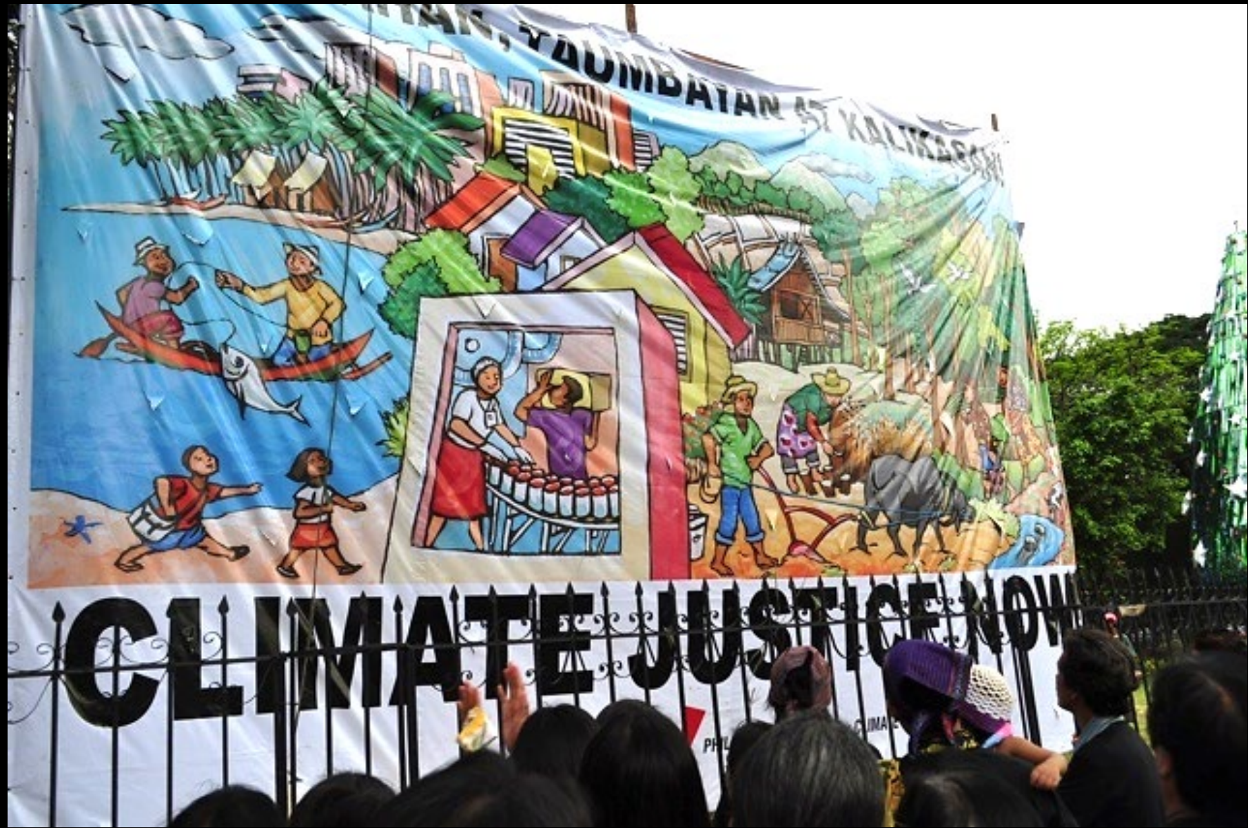
Philippine Movement for Climate Justice -- International Meeting, Cancun, Mexico