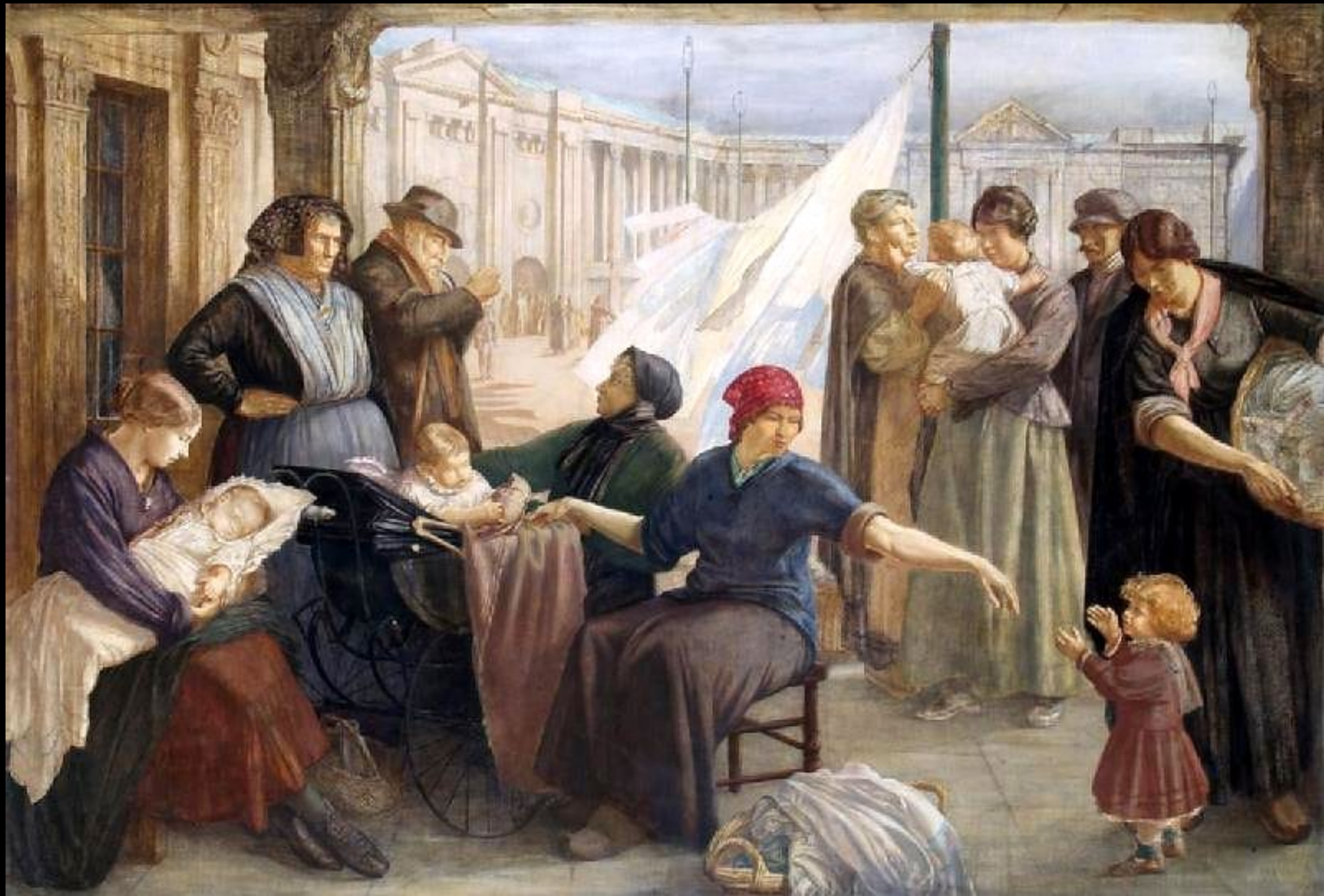
War Refugee's Camp -- Henry Rushbury, Imperial War Museum, London, England