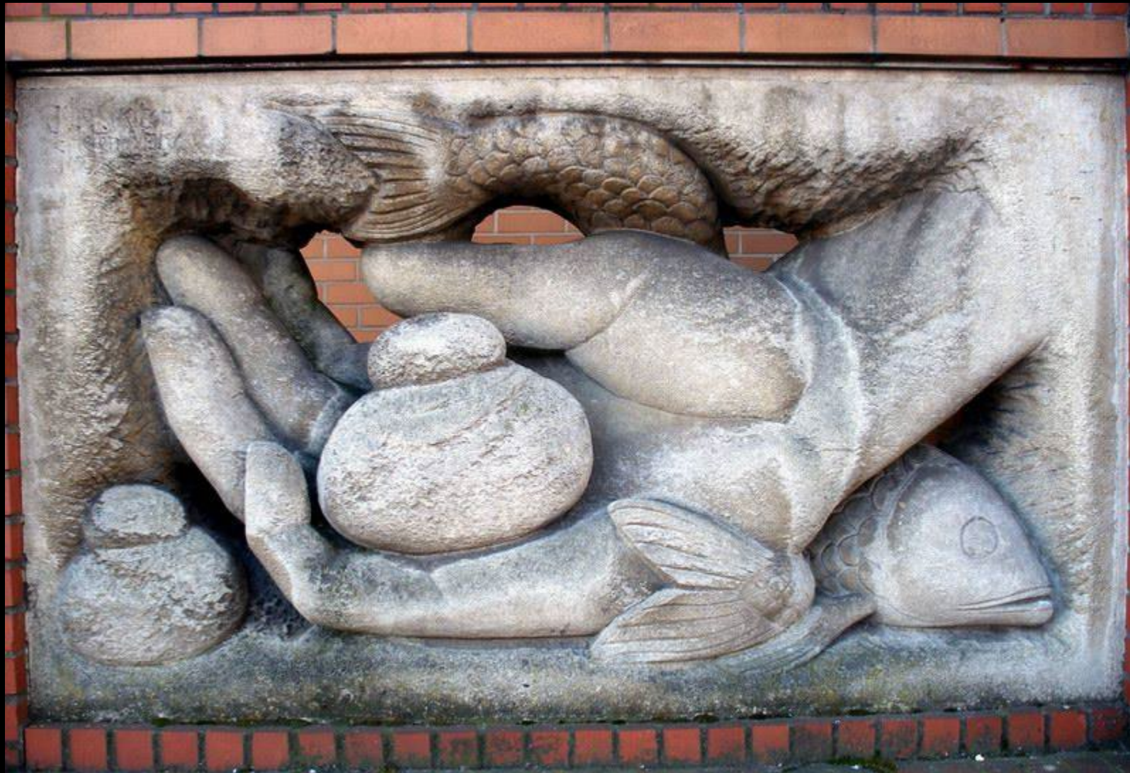
Offering of Loaves and Fish -- United Reformed Church, Brighton, England