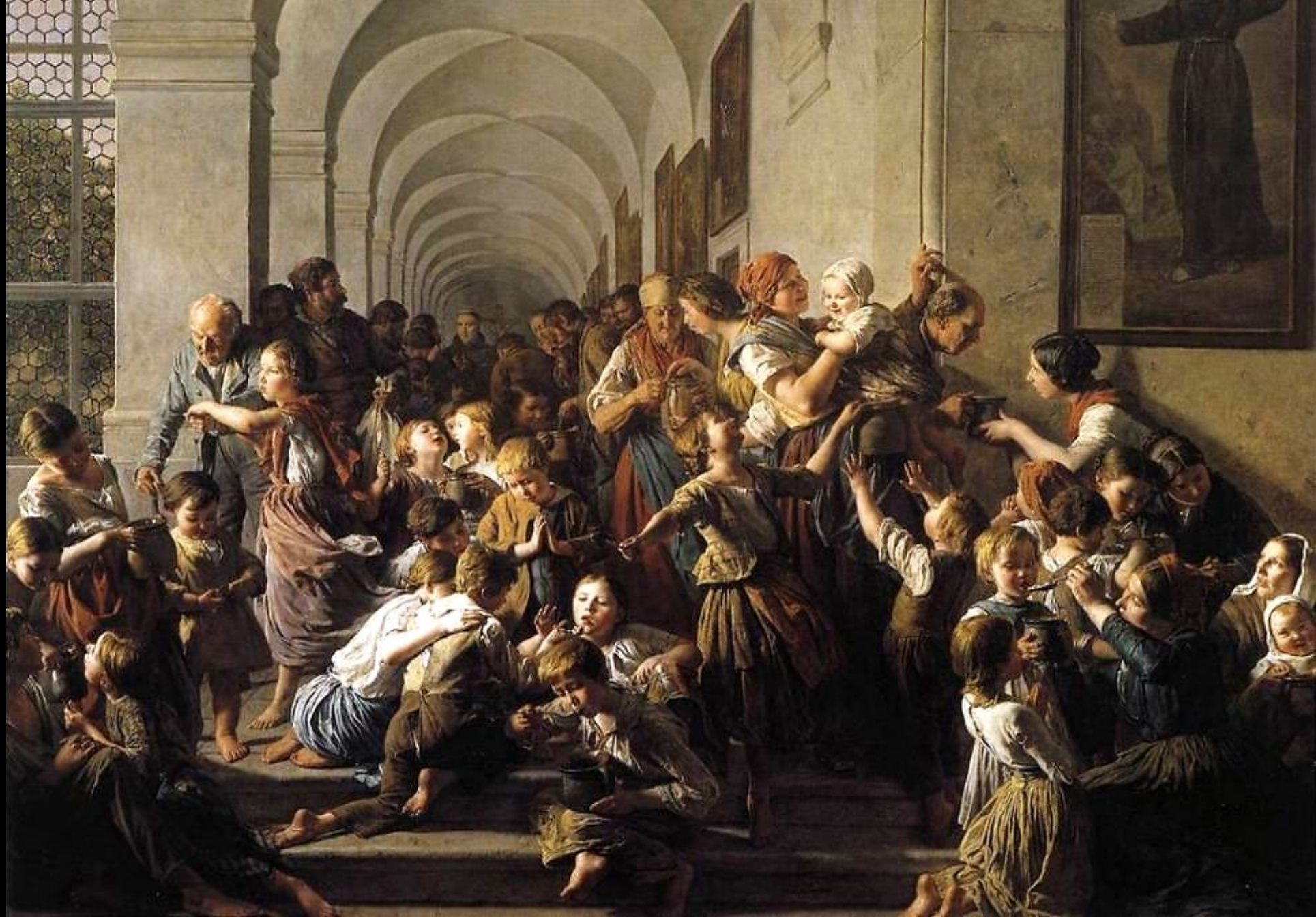
The Soup Kitchen -- Ferdinand Waldmüller, Palace Belvedere, Vienna, Austria