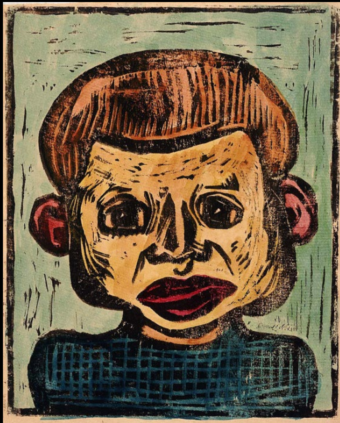
Refugee Boy William H. Johnson Smithsonian American Art Museum Washington, DC