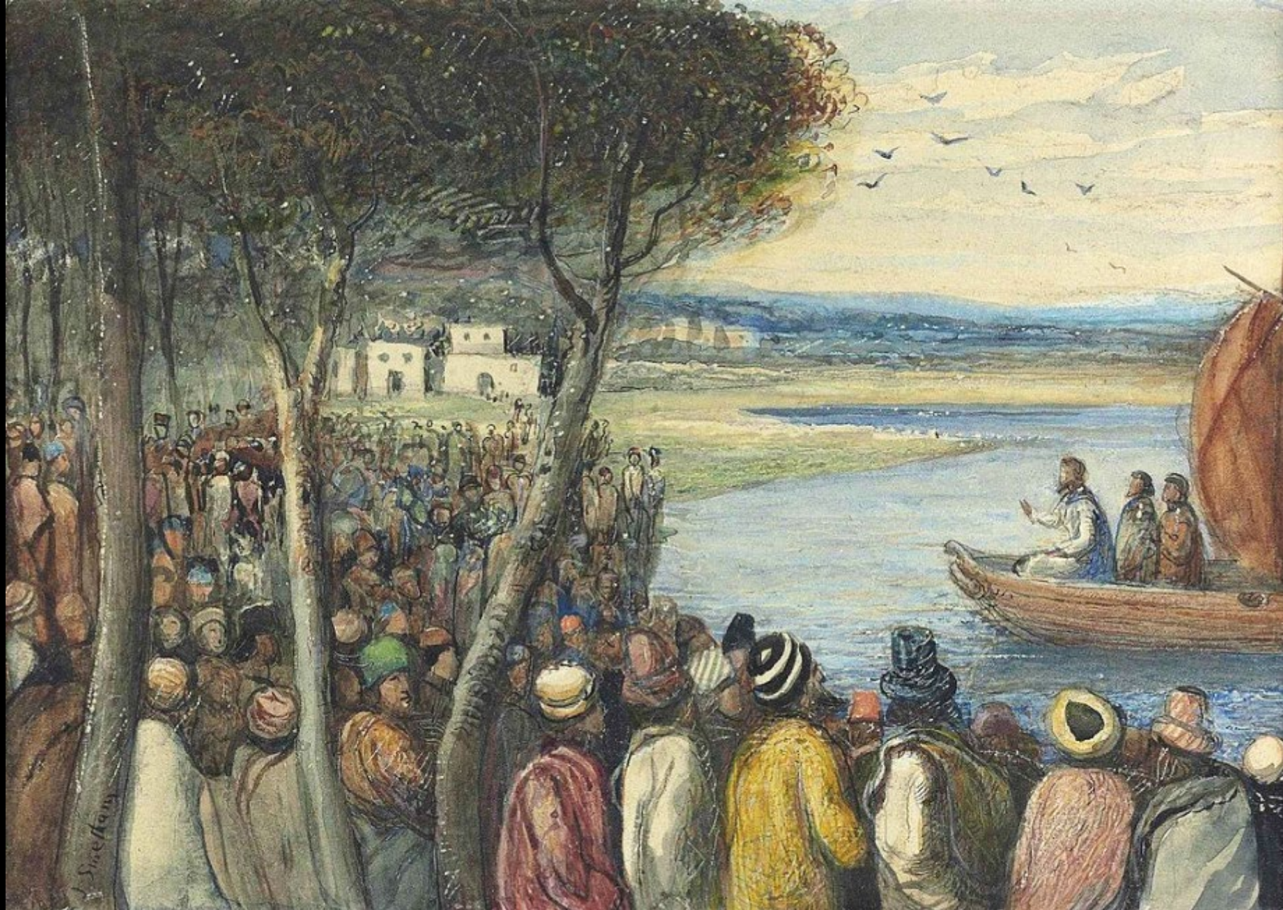
Christ Preaching to the Multitudes -- James Smetham, Fine Art Society, London, England