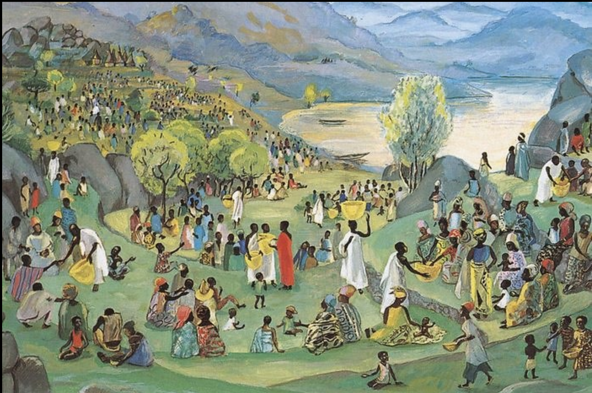
Jesus Multiplies the Loaves and Fish -- JESUS MAFA, Cameroon