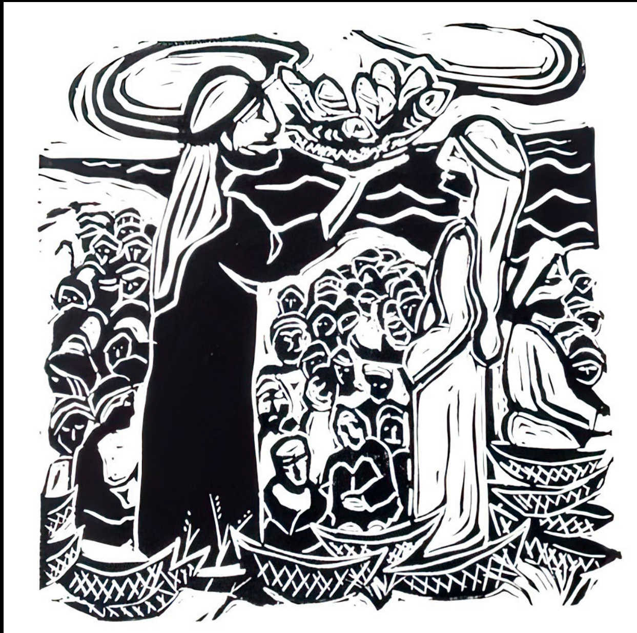
Feeding the Multitudes -- Cara Hochhalter