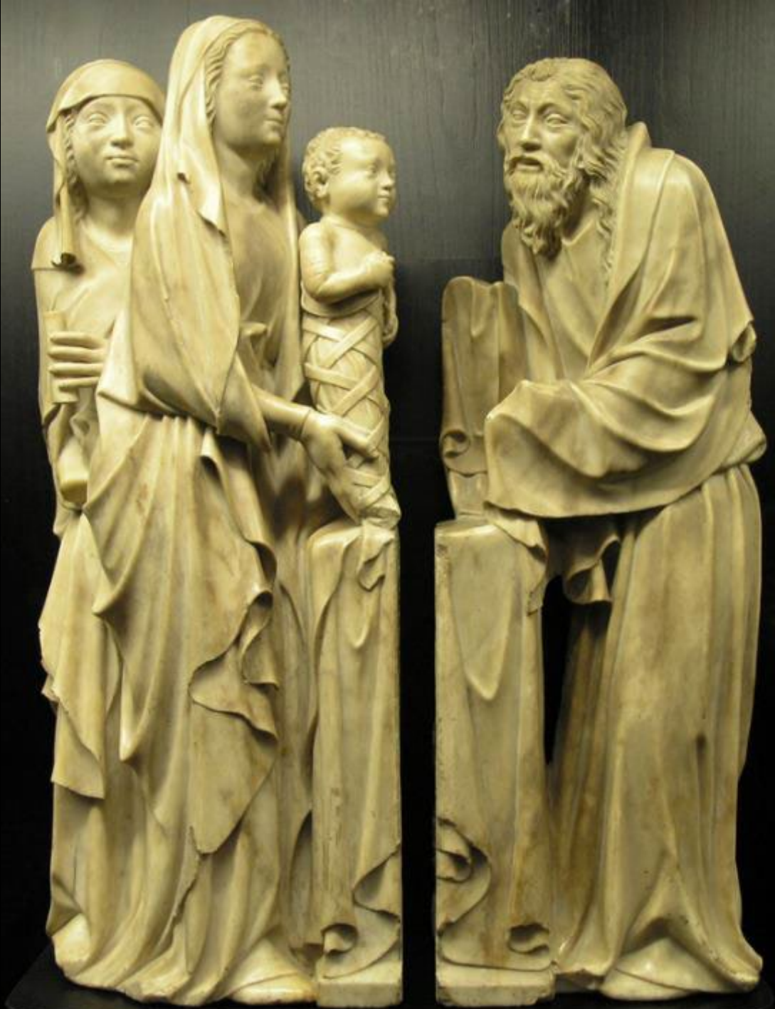
Presentation in the Temple

Musee National du Moyen Age Paris, France