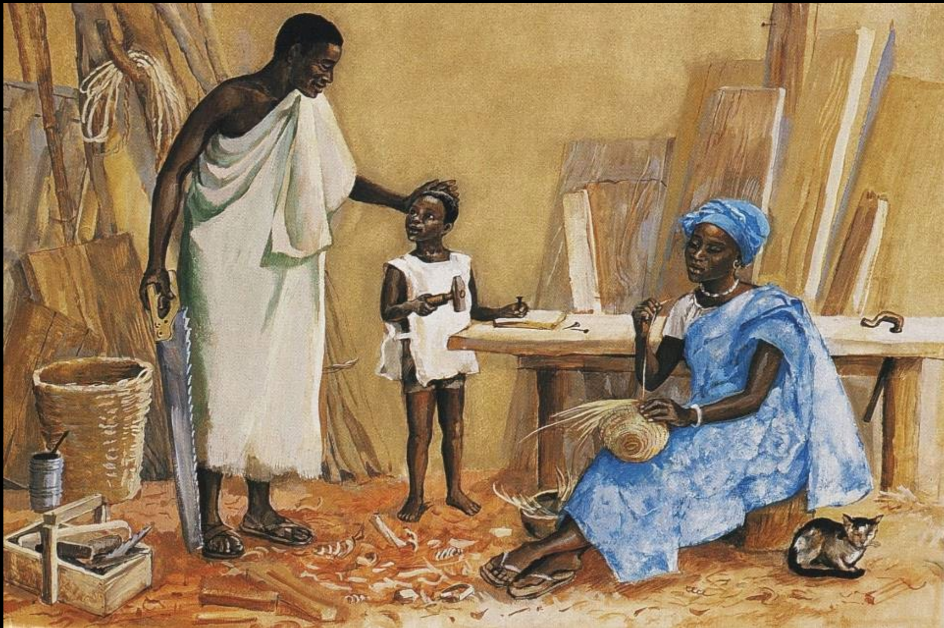
Jesus as a Child in Nazareth -- JESUS MAFA, Cameroon