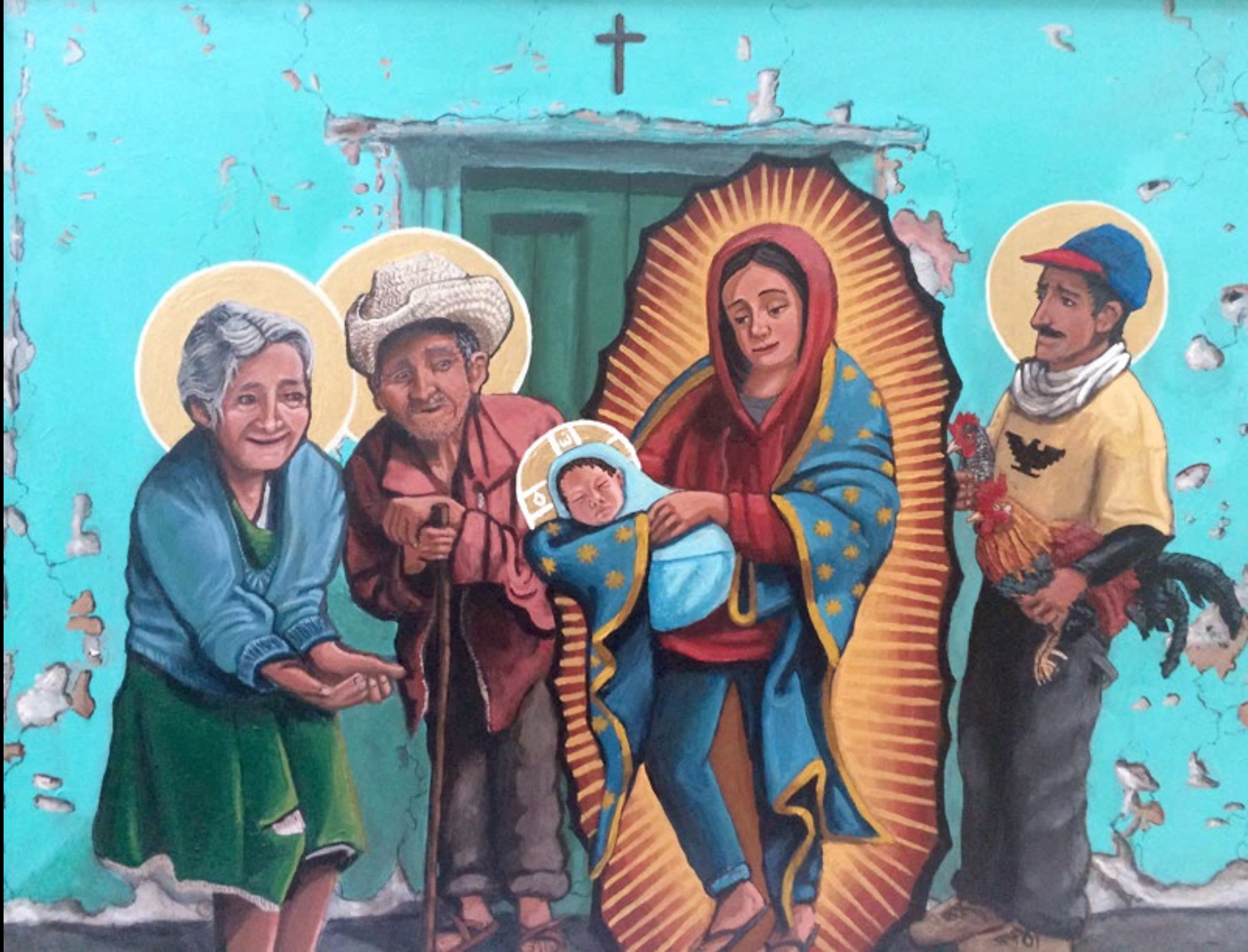
Presentation in the Temple -- Kelly Latimore, Longview, TX