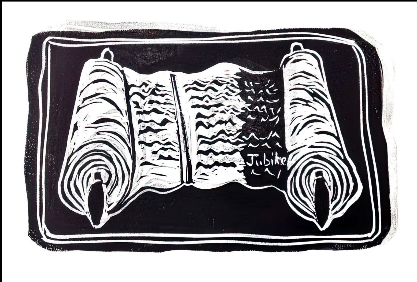
Reading from the Torah -- Cara Hochhalter