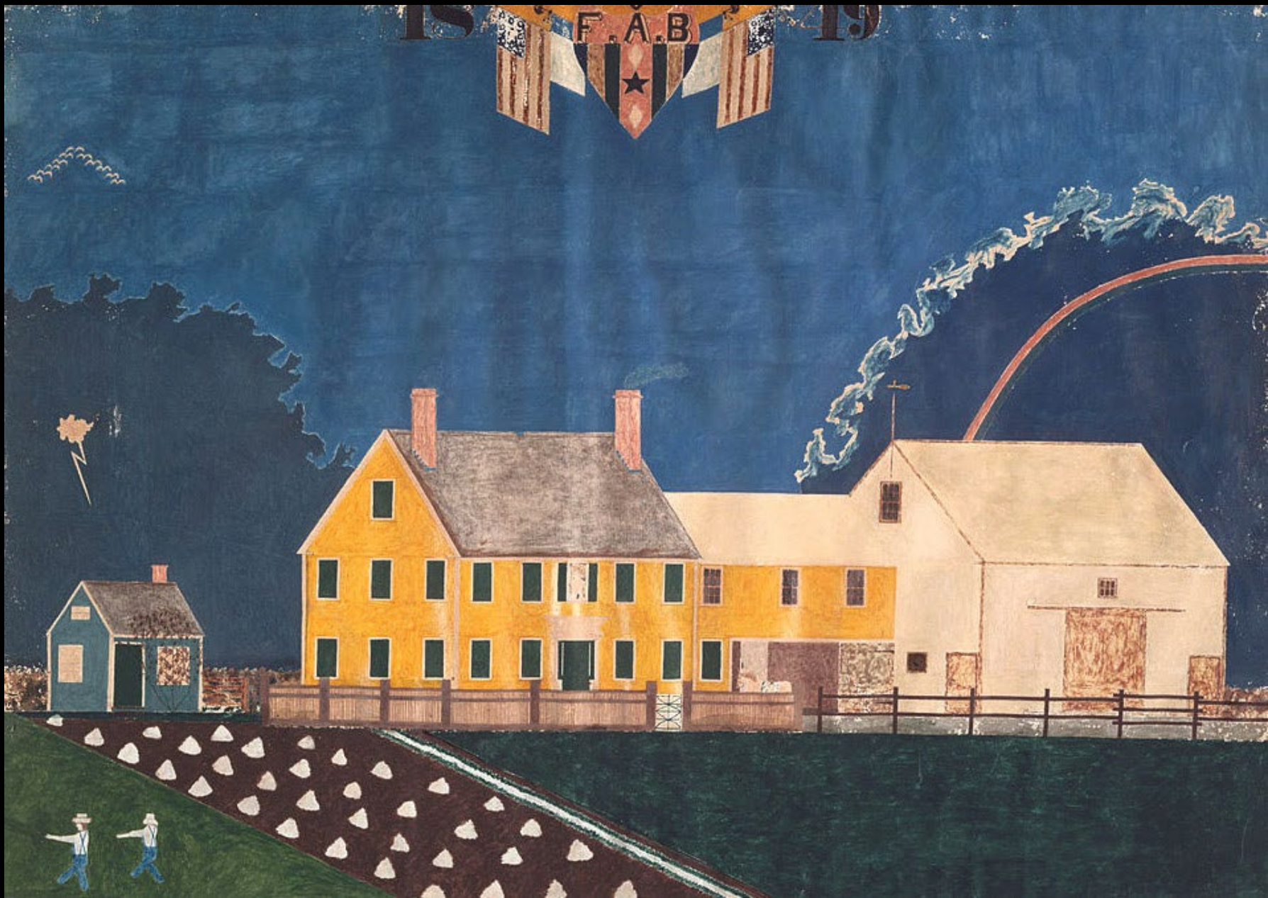
Farmstead in a Passing Storm -- unidentified artist, Museum of Fine Arts, Boston