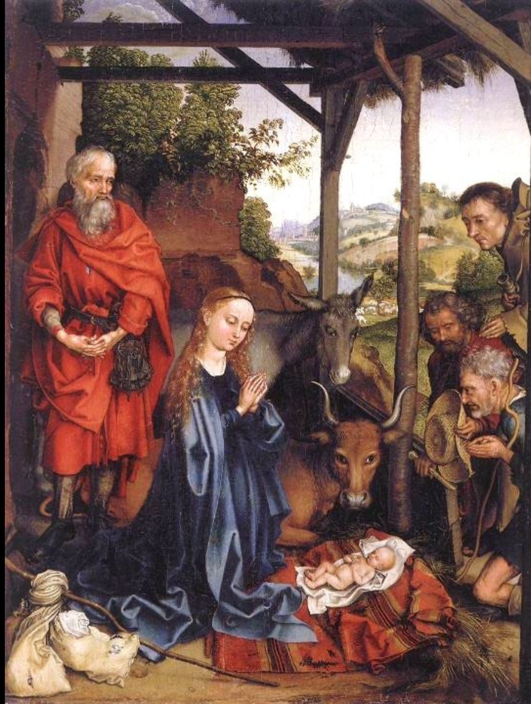
Birth of Christ Martin Schongauer Gemaldegalerie Berlin, Germany