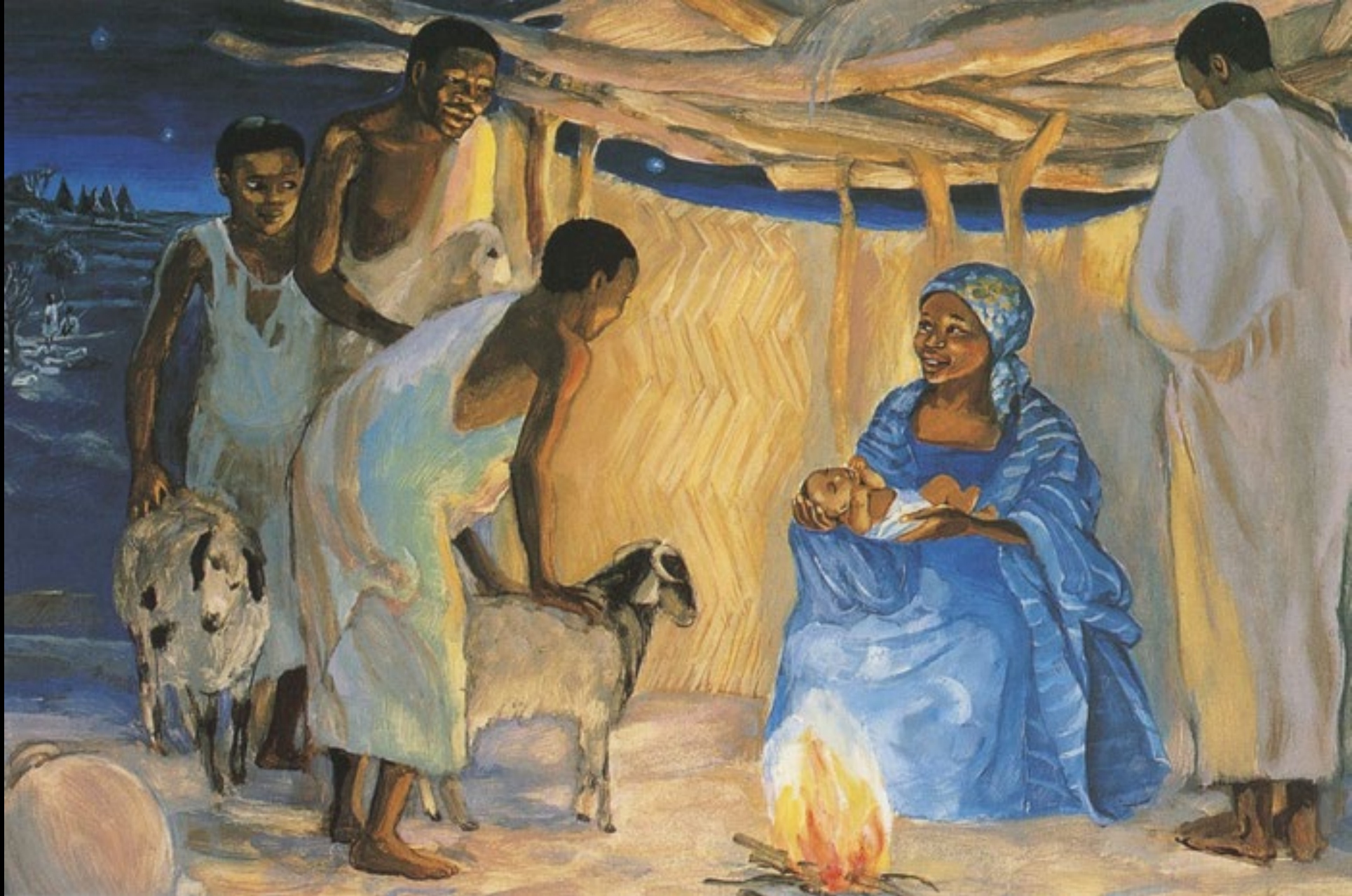
Birth of Jesus with the Shepherds -- JESUS MAFA, Cameroon