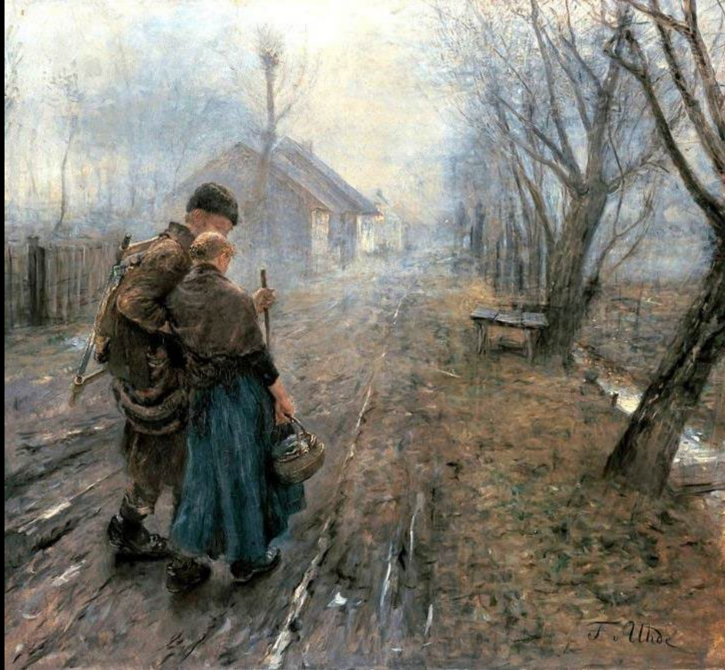
Difficult Journey – Transition to Bethlehem – Fritz von Uhde, Neue Pinakothek, Munich, Germany