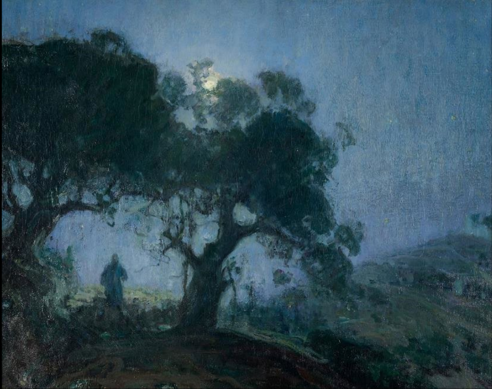
The Good Shepherd -- Henry Ossawa Tanner, Zimmerli Art Museum, Rutgers, NJ