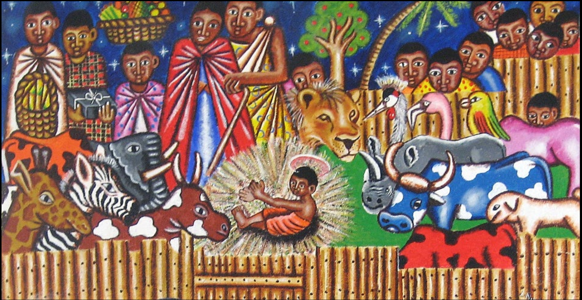
Nativity from a church in Kenya