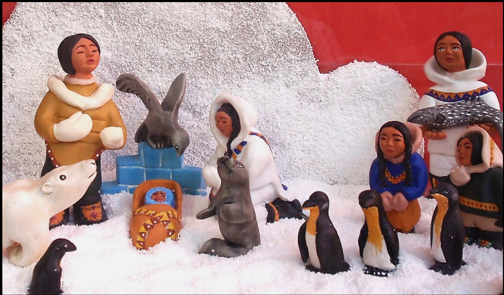
Inuit Nativity -- Padron House Museum, Galdar, Spain