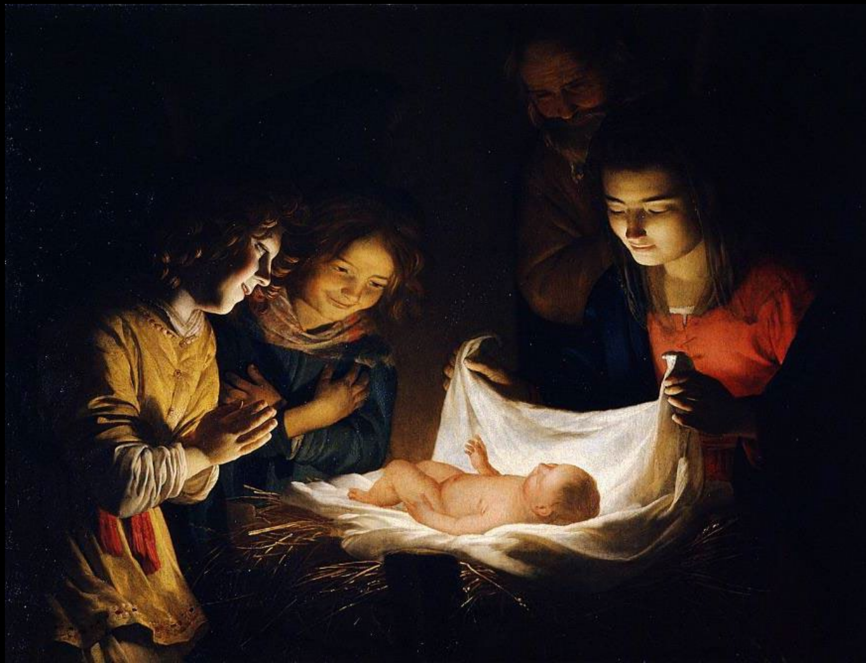
Adoration of the Child -- Gerard van Honthorst, Uffizi Gallery, Florence, Italy