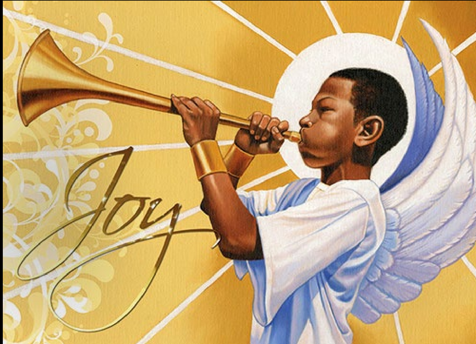
Joy to the World, the Lord is Come -- Illustration from Dem. Republic of Congo