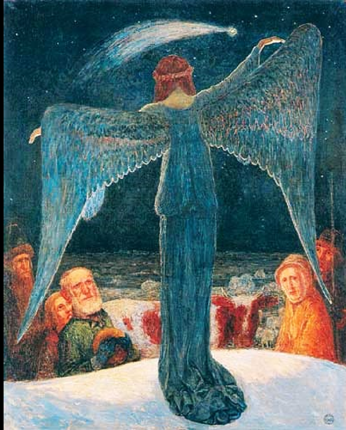
Annunciation to the Shepherds