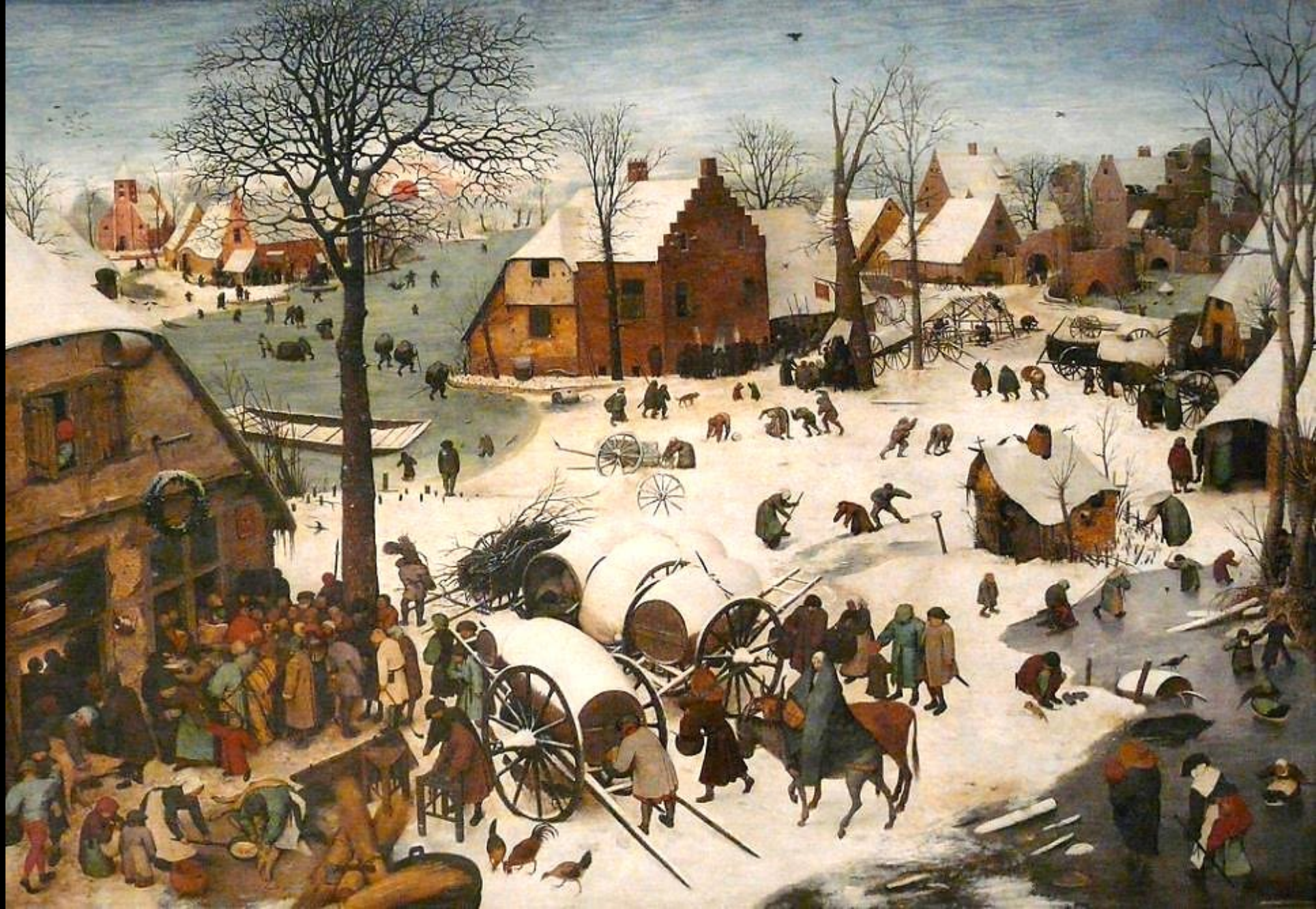
The Census at Bethlehem -- Pieter Bruegel the Elder, Brussels Museum of Fine Arts, Brussels, Belgium