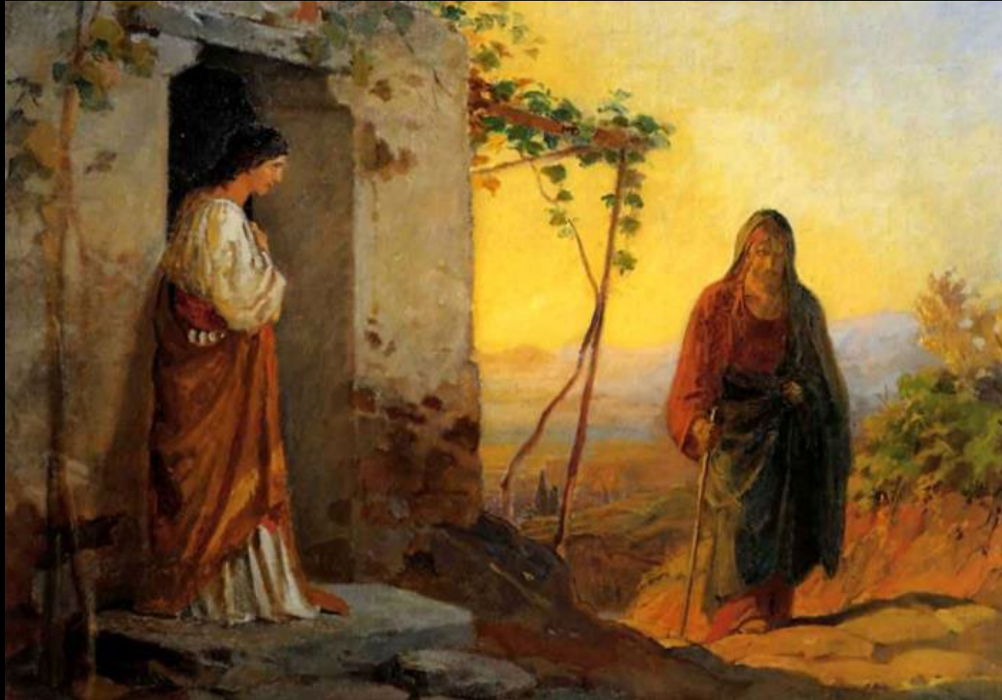
Mary Greets Jesus -- Nikolas Ge