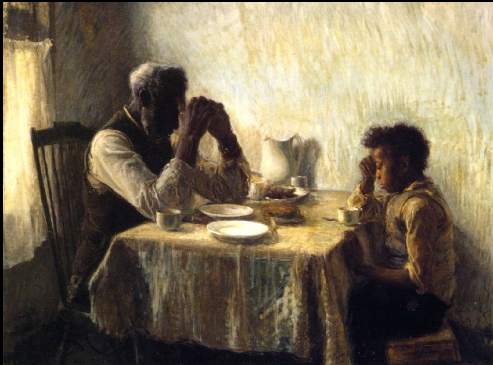
Giving Thanks -- Henry Ossawa Tanner