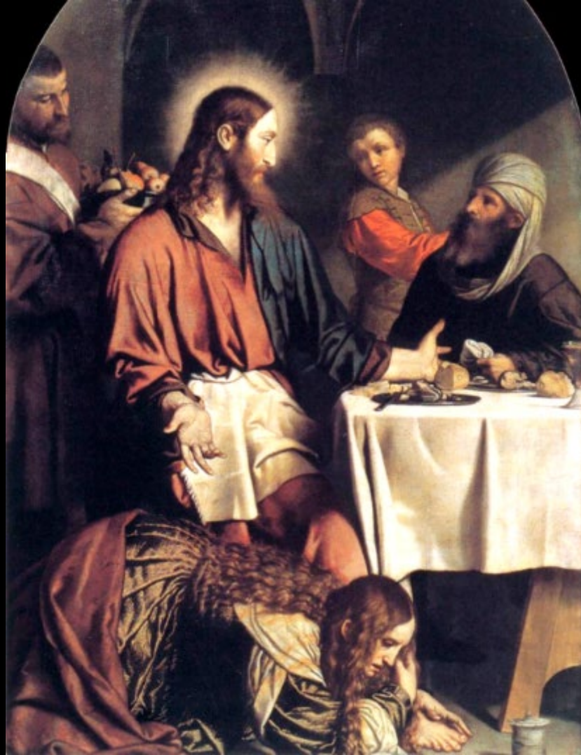
Feast in the House of Simon Moretto da Brescia Church of Saint Mary, Calchera Brescia, Italy