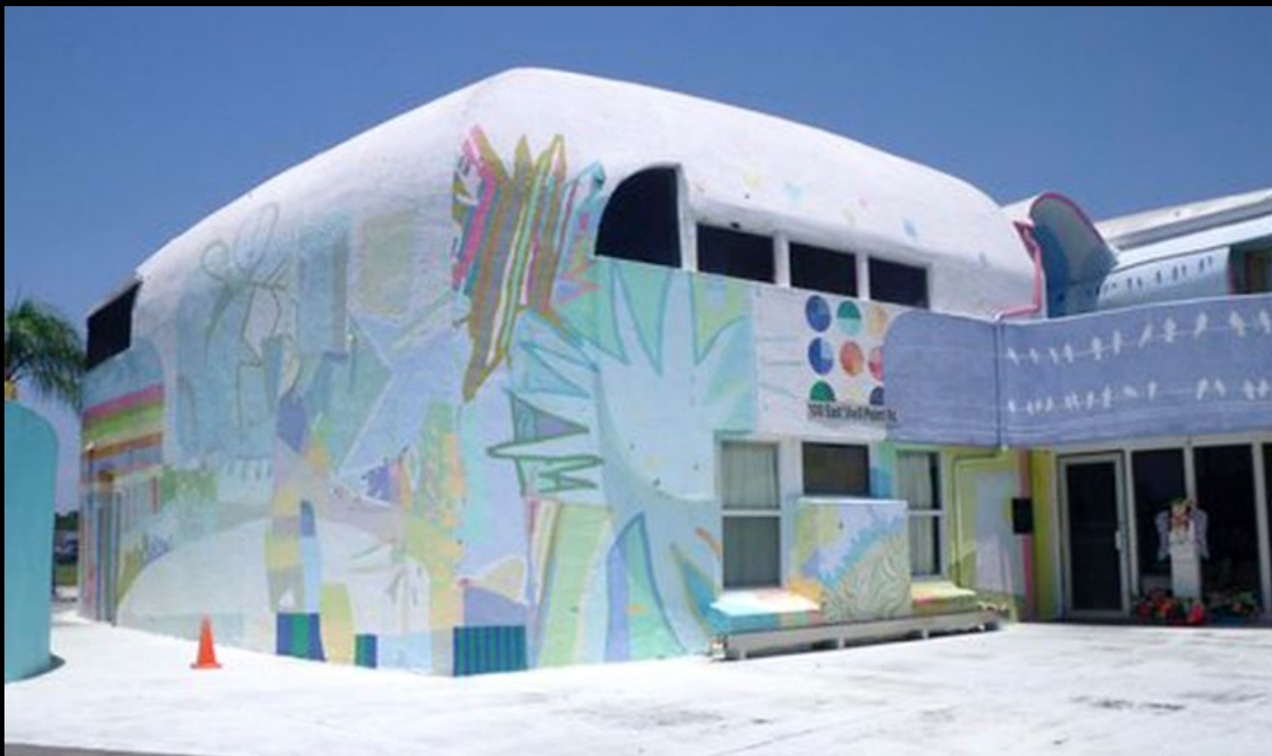
Mary and Martha House -- Domestic Violence Homeless Shelter for Women in Ruskin, FL