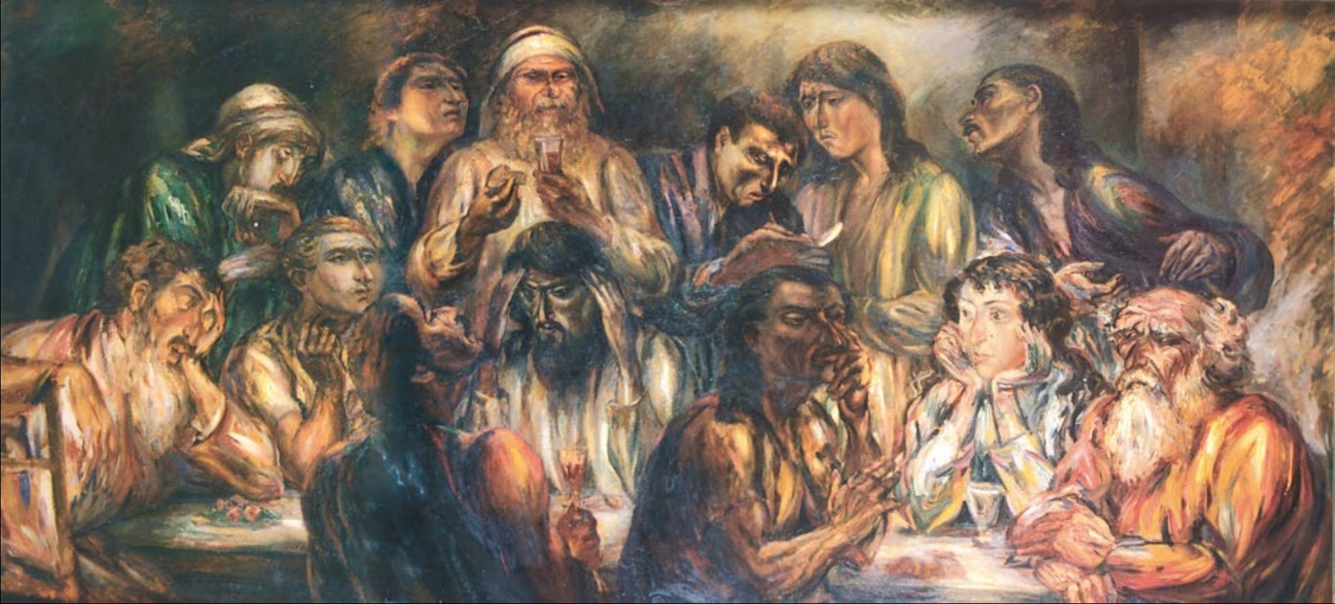
Last Supper -- Karoly Kernstok, Hungarian National Gallery, Budapest, Hungary