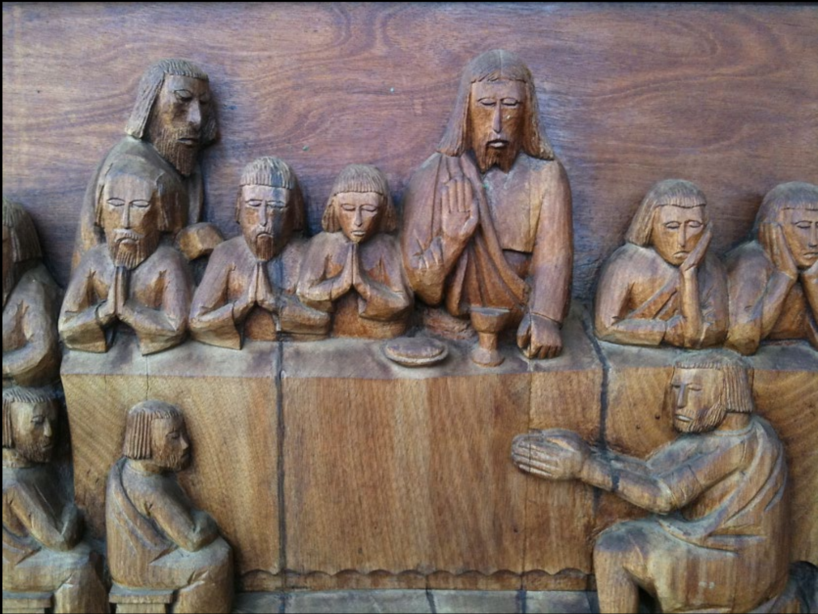
Last Supper -- Capetown, South Africa