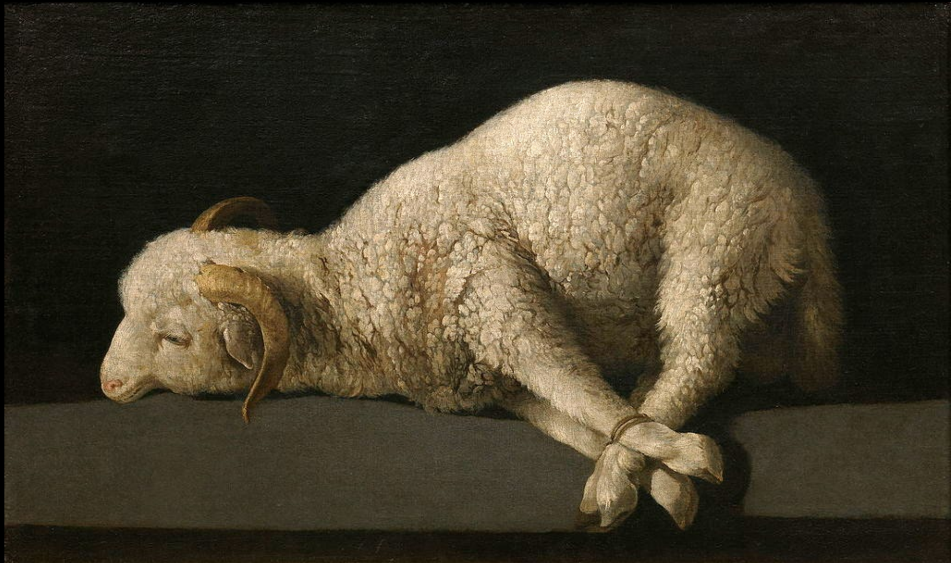
Lamb of God -- Francisco de Zurbaran, Prado, Madrid, Spain