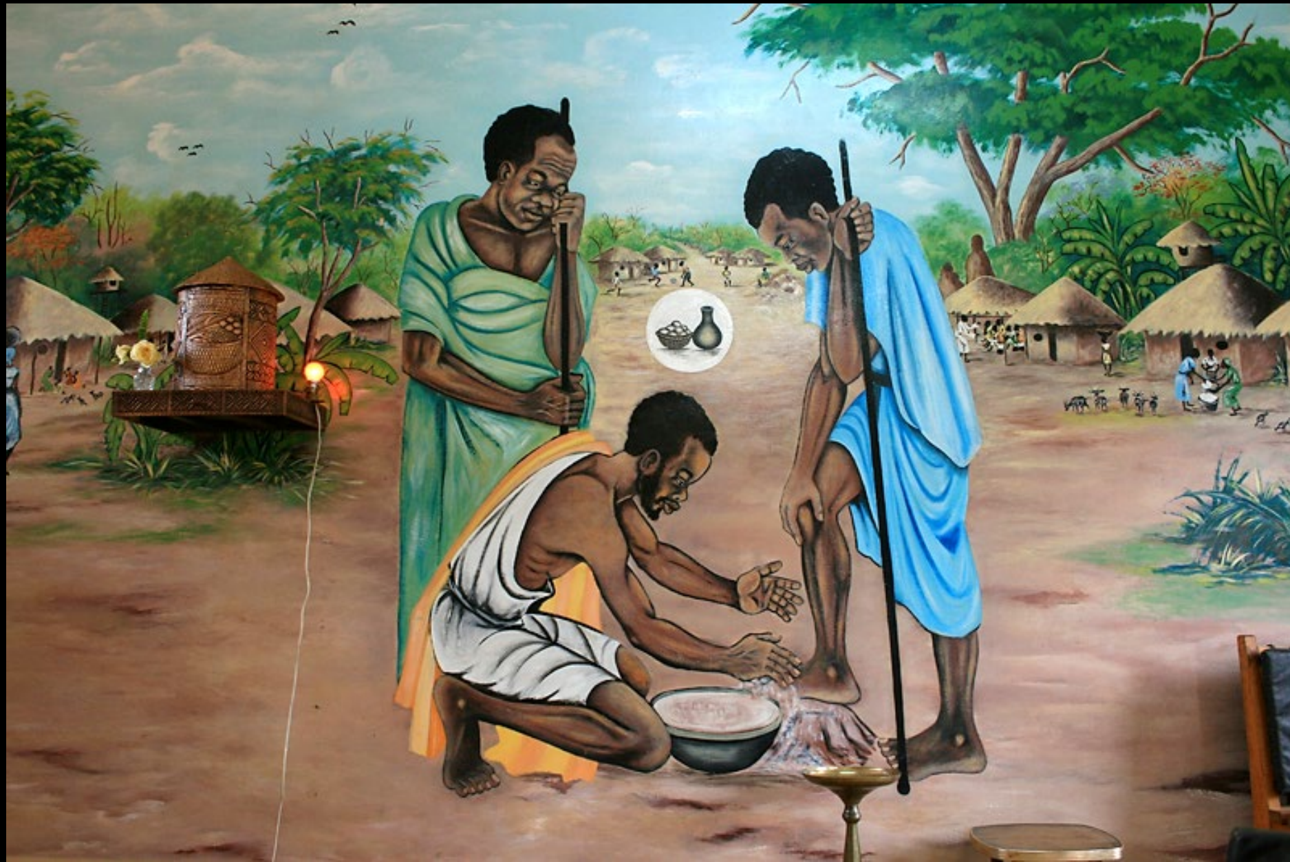
Jesus Washes His Disciples' Feet -- Victoria Falls, Zambia