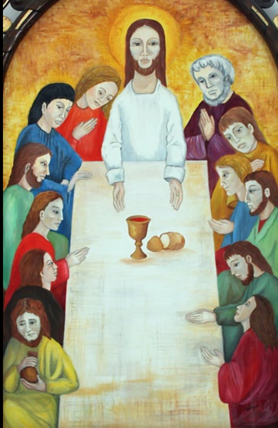
Last Supper Cathedral of Sancti Spiritus Sancti Spiritus, Cuba