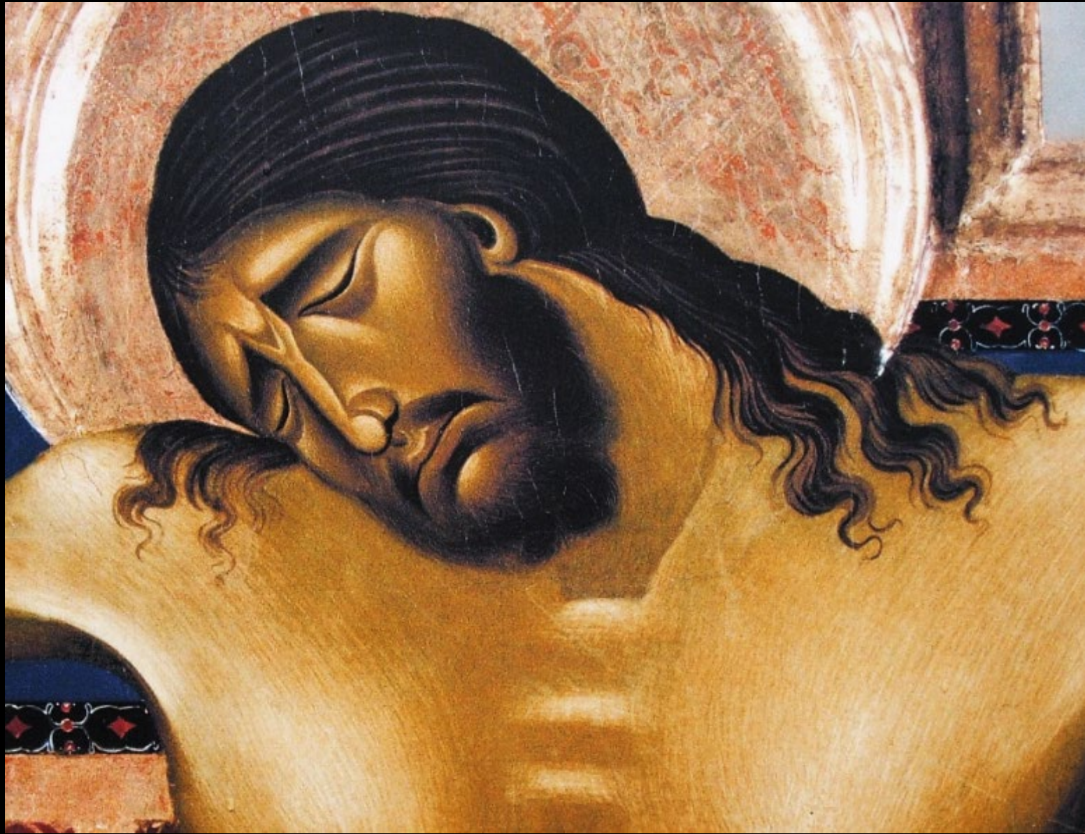
Crucifixion, detail -- Cimabue, Church of San Domenico, Arezzo, Italy