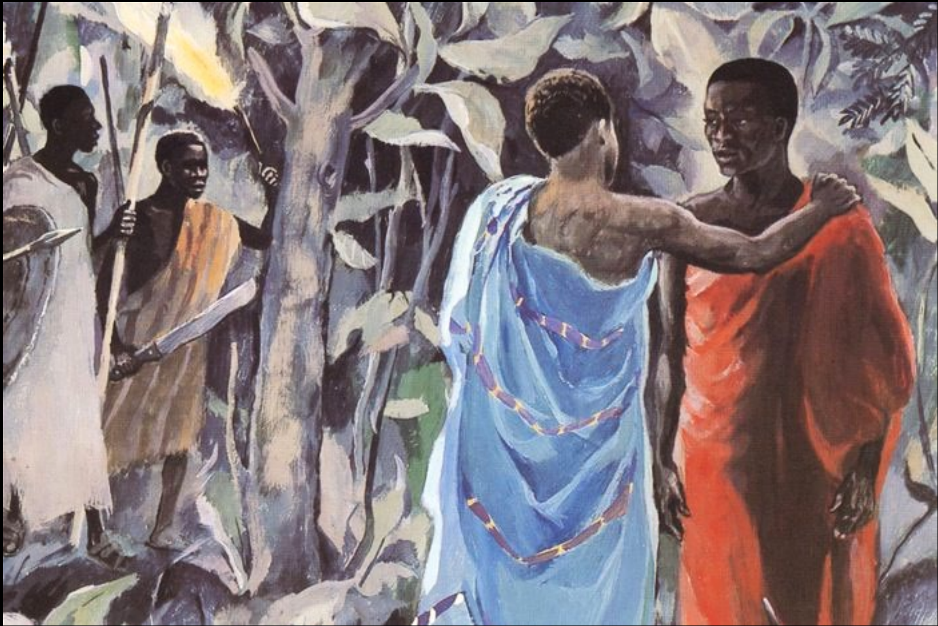
Kiss of Judas -- JESUS MAFA, Cameroon