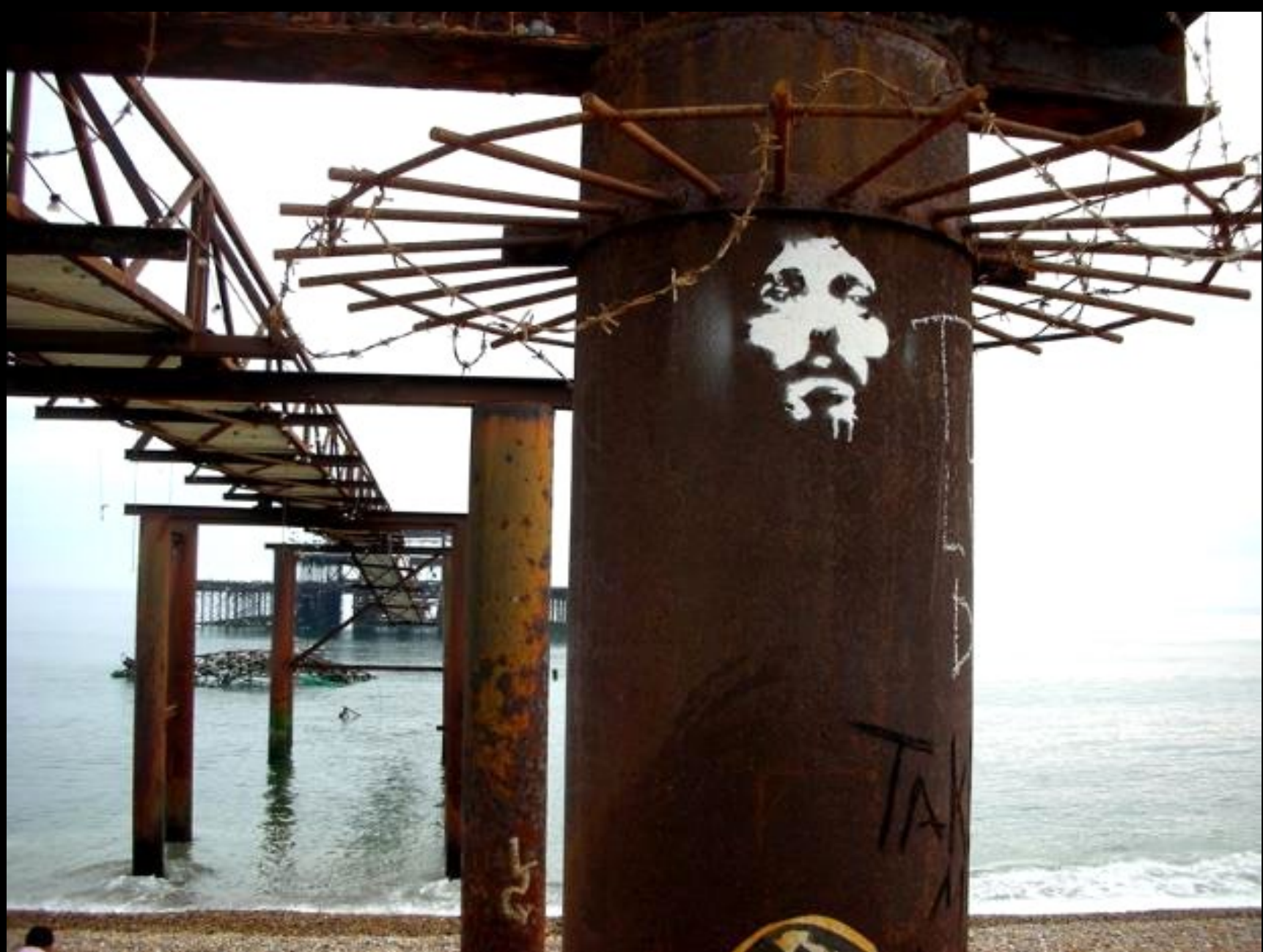
Crown of Thorns -- Easter 2007, West Pier, Brighton, England