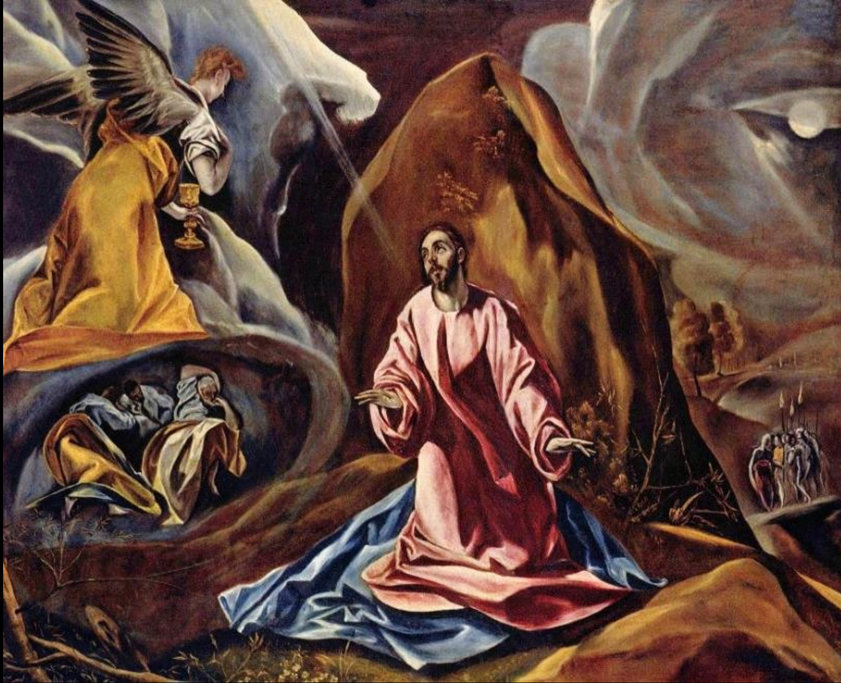
Christ on the Mount -- El Greco, National Gallery, London, England