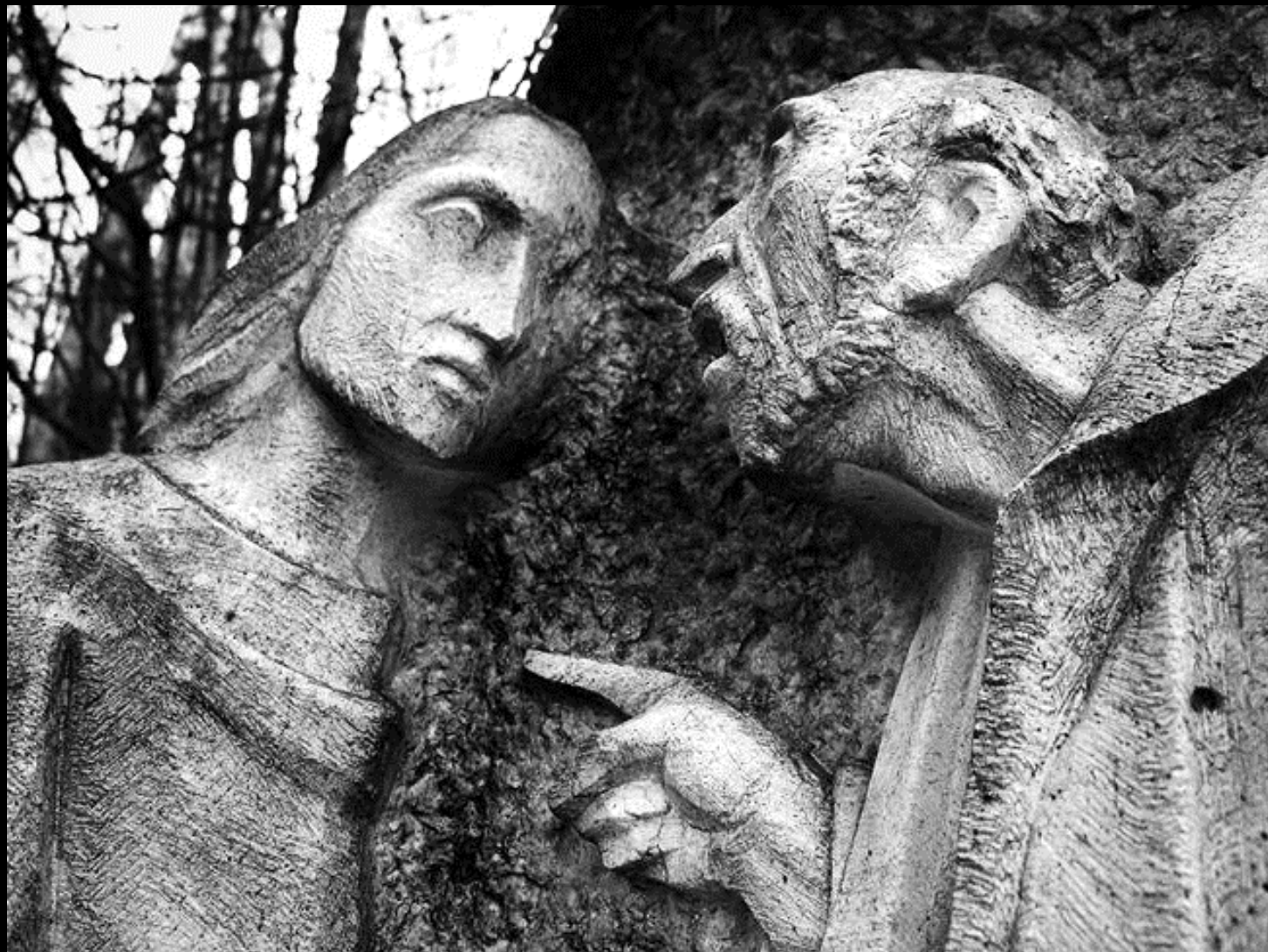
The Sanhedrin Examine Jesus -- Santuario di Lourdes Nevegal, Nevegal, Italy