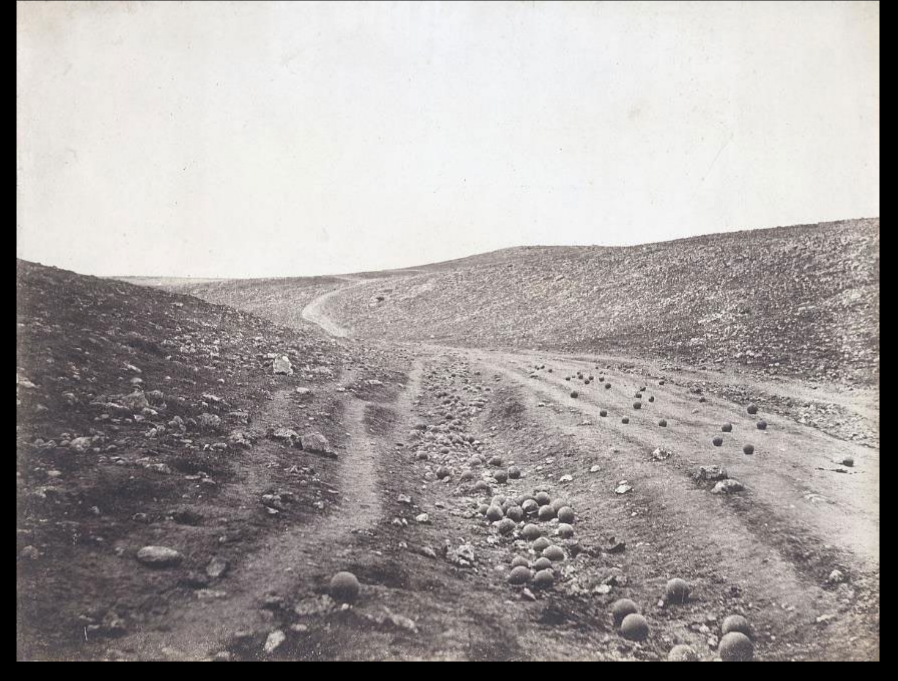
Valley of the Shadow of Death, Crimean War -- Roger Fenton, V&A Museum, London