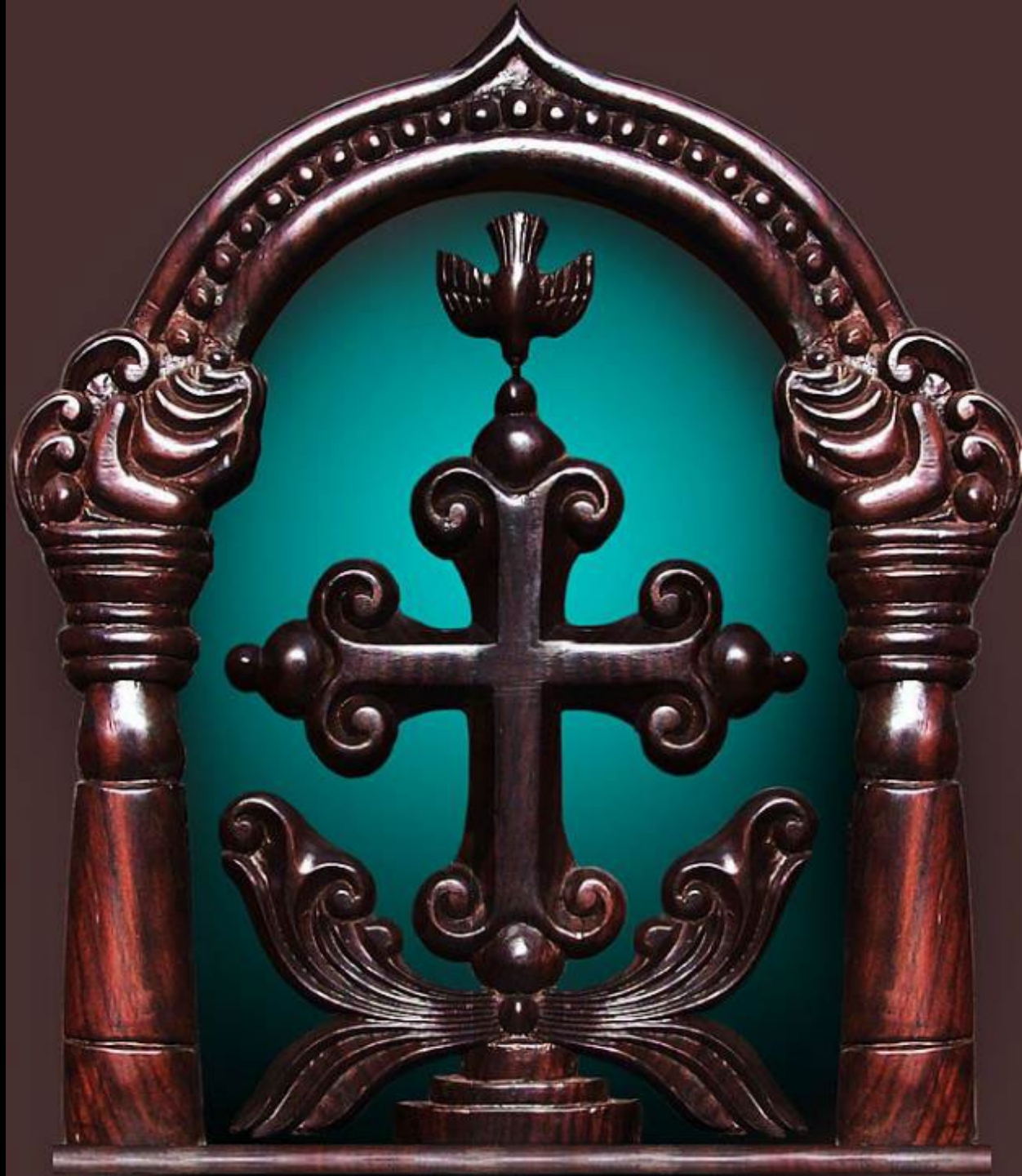
Mar Thoma Sliva Cross – St. Thomas Cross