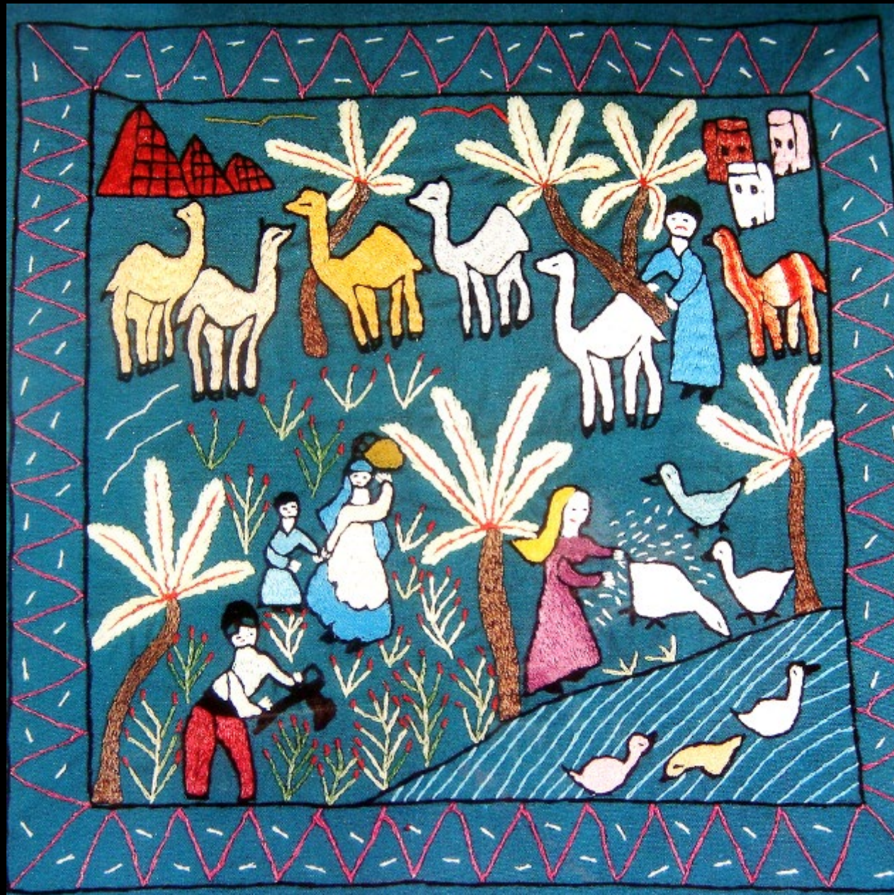
Daily Life -- Mottamadya Women's Association, Cairo, Egypt