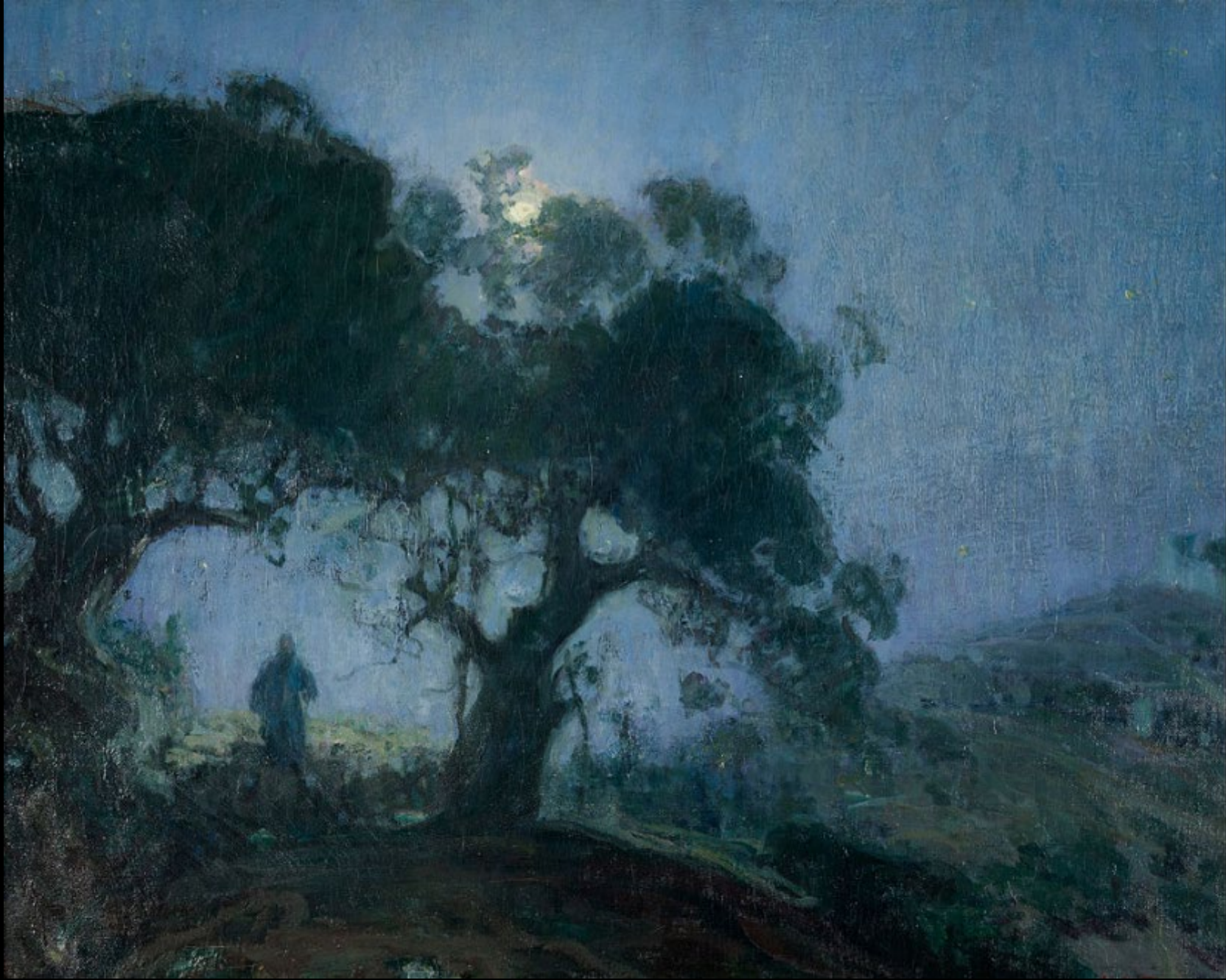
The Good Shepherd -- Henry Ossawa Tanner, Zimmerli Museum, Rutgers, NJ