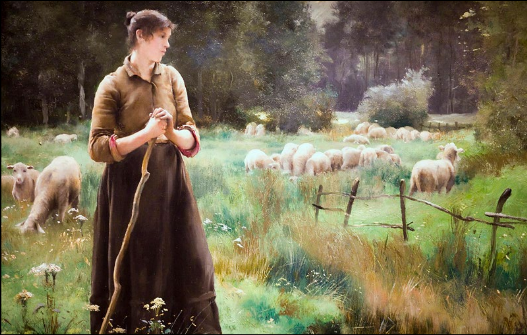
The Good Shepherd -- Julien Dupre, Legion of Honor Museum, San Francisco, CA