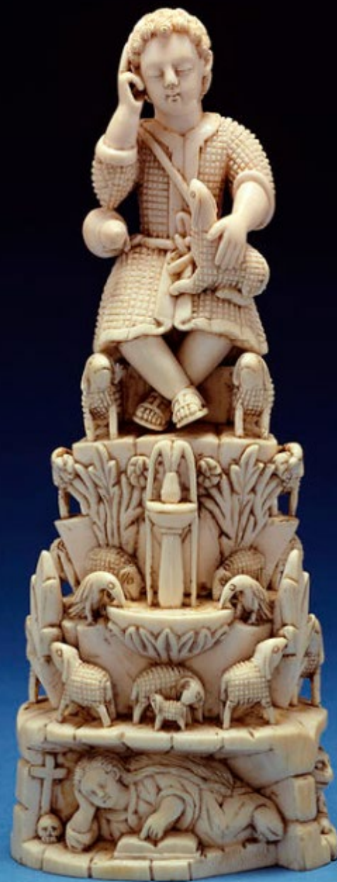
The Christ Child as Good Shepherd Goa, India