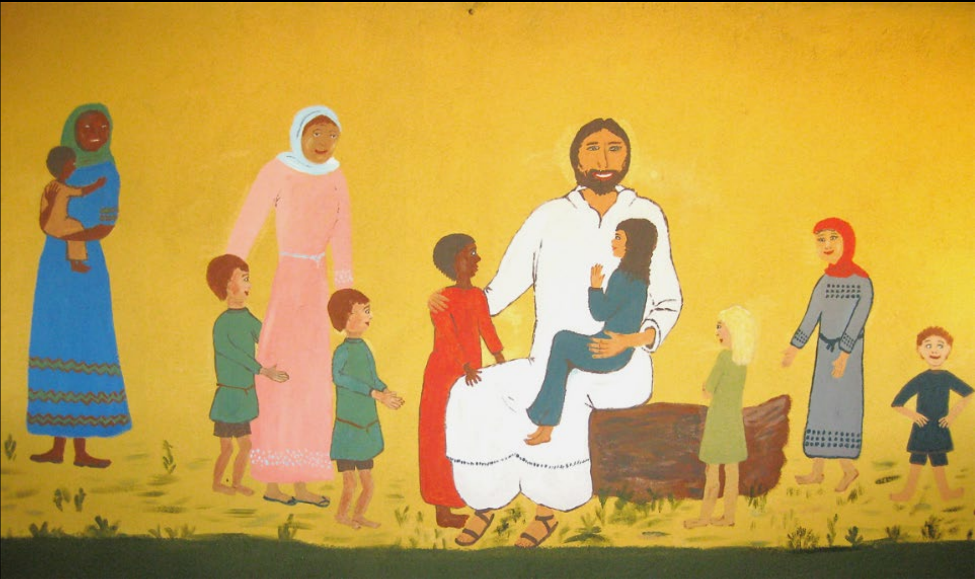
Jesus Welcomes All -- Church Mural, Sudan