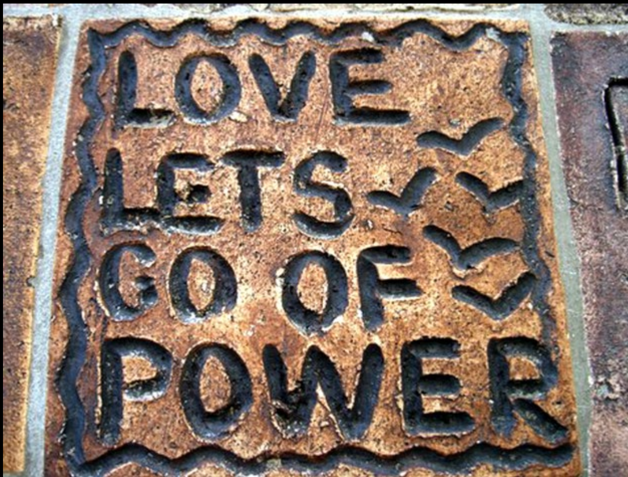
Tile from Peace Wall, Hamilton, New Zealand