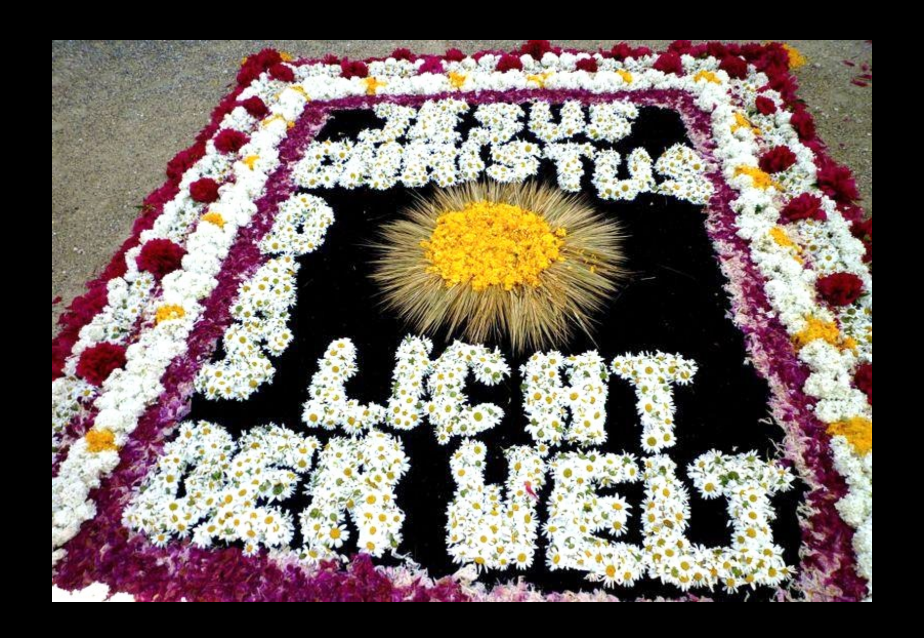
Jesus Christus das Licht der Welt -- Flower Festival, Aulendorf, Germany