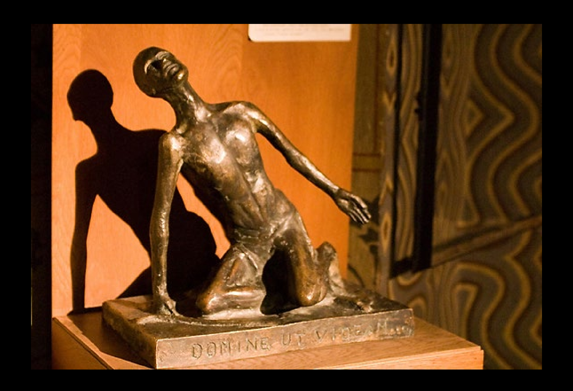
Christ Heals the Blind Man -- Matyas Church, Budapest, Hungary