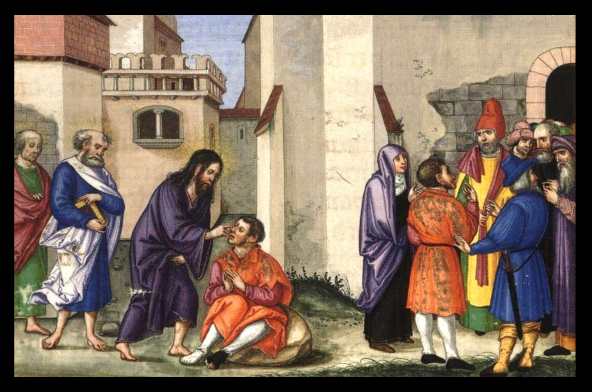
Healing of the Man Born Blind -- Matthias Gerung, Bayerische Staatsbibliothek, Munich