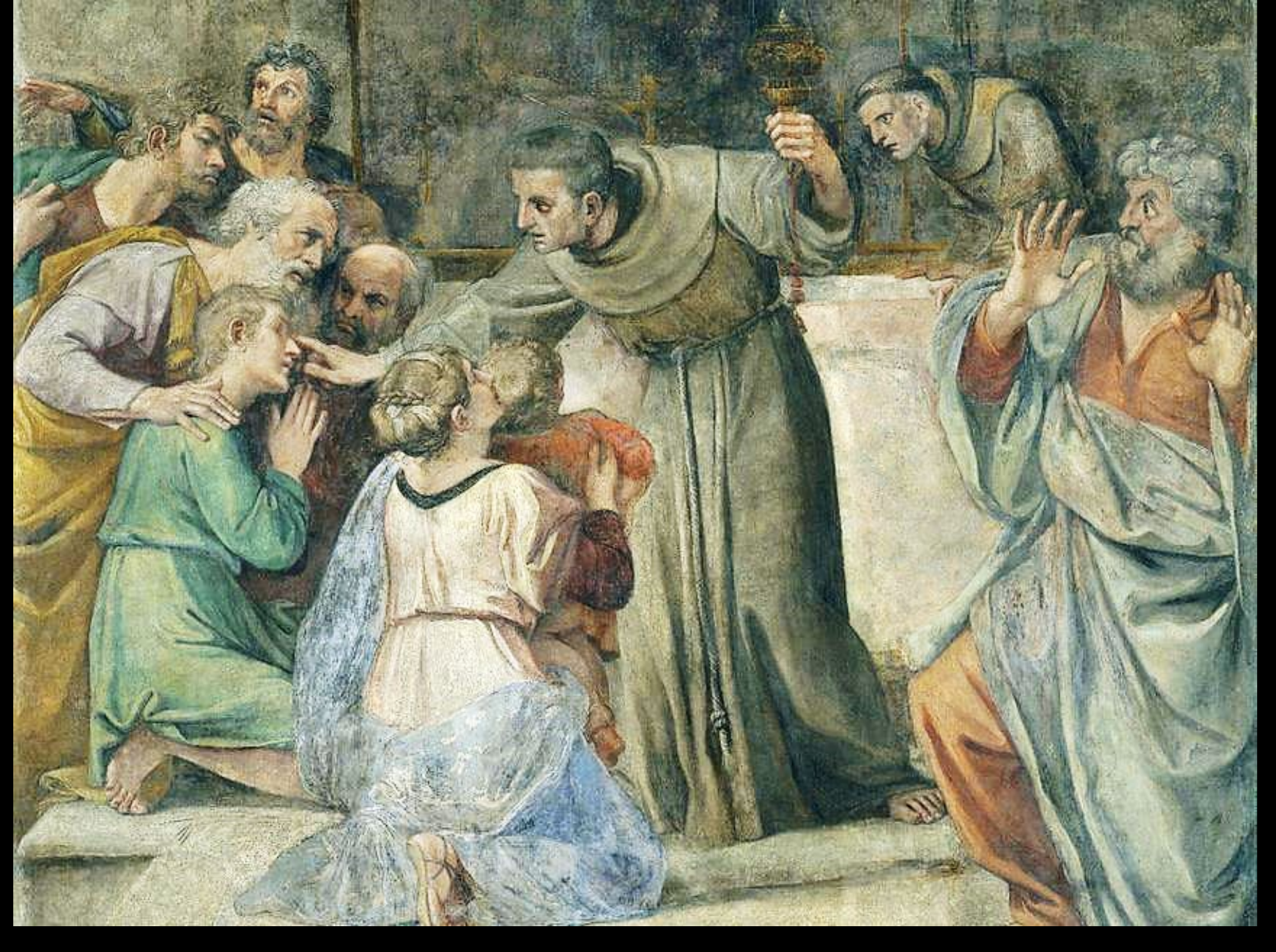
Healing the Man Born Blind -- A. Carraci, Museu Nacional d'Art de Catalunya, Barcelona