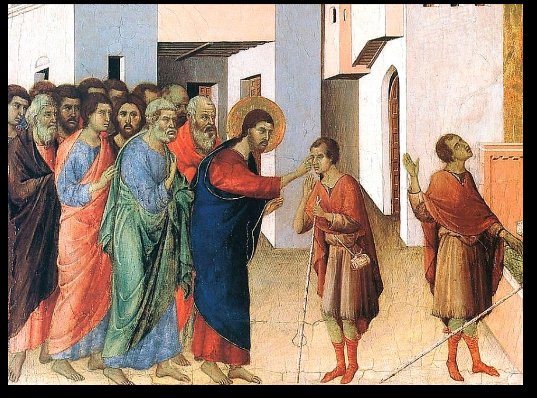
Healing of the Man Born Blind -- Duccio, National Gallery, London