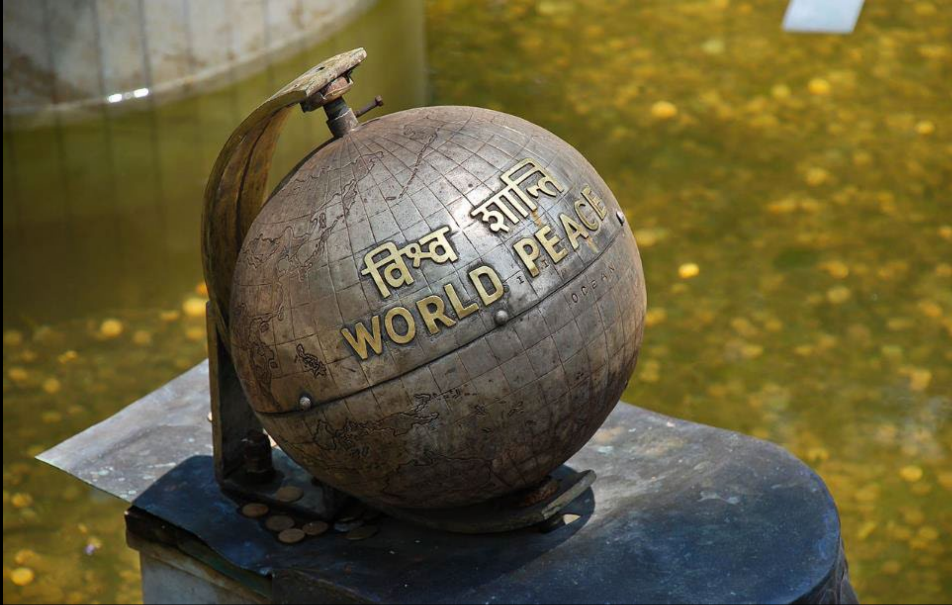
World Peace Monument -- Swayambhunath Temple Garden, Kathmandu, Nepal