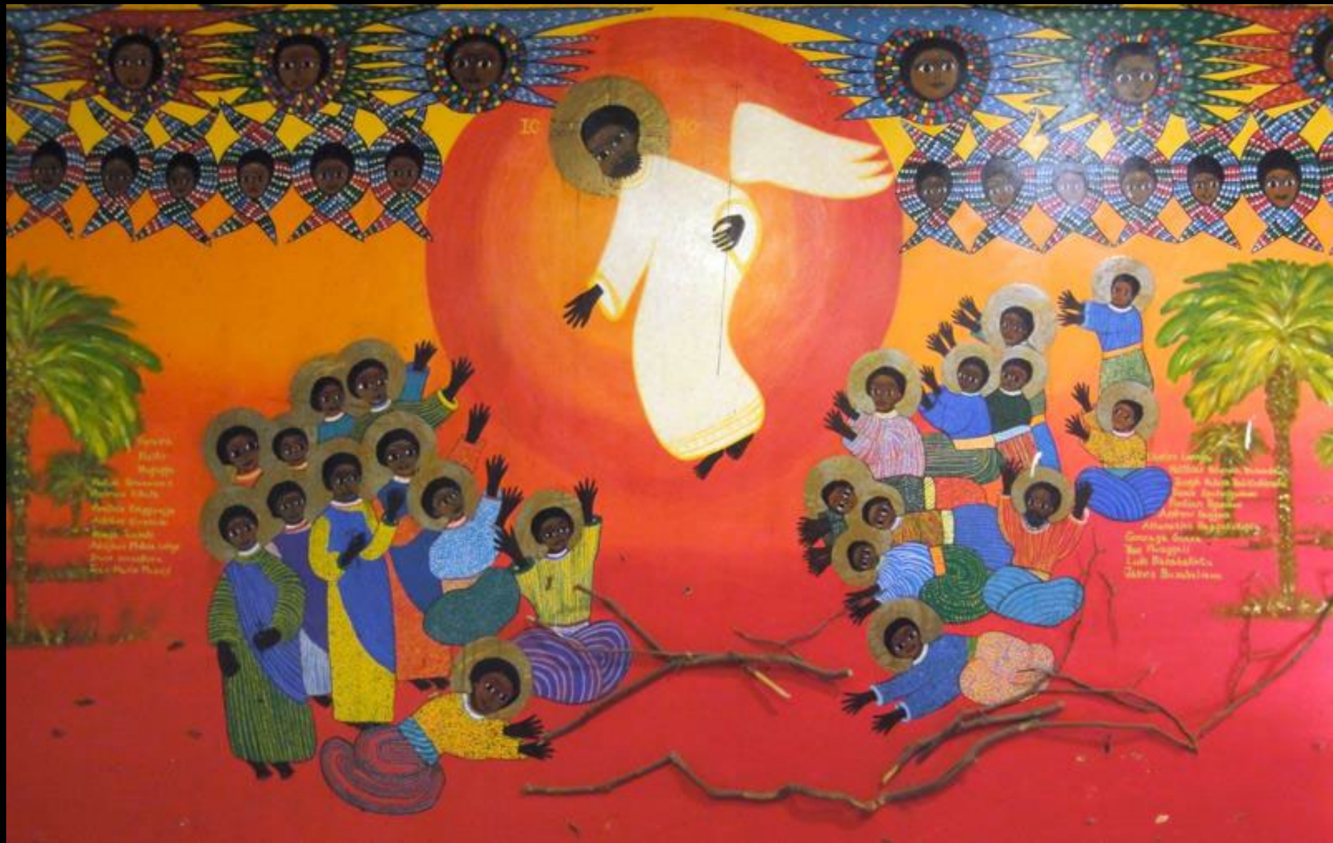
Martyrs of Uganda -- Emmaus House, Kampala, Uganda