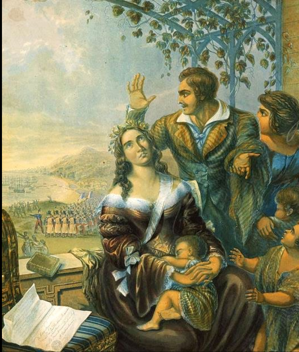
Pomare, Queen of Tahiti, Persecuted for her Faith