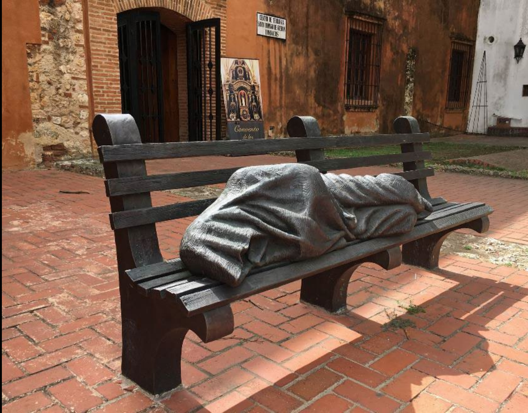
Homeless Jesus -- Timothy Schmalz, Dominican Convent, Santo Domingo, Dominican Republic