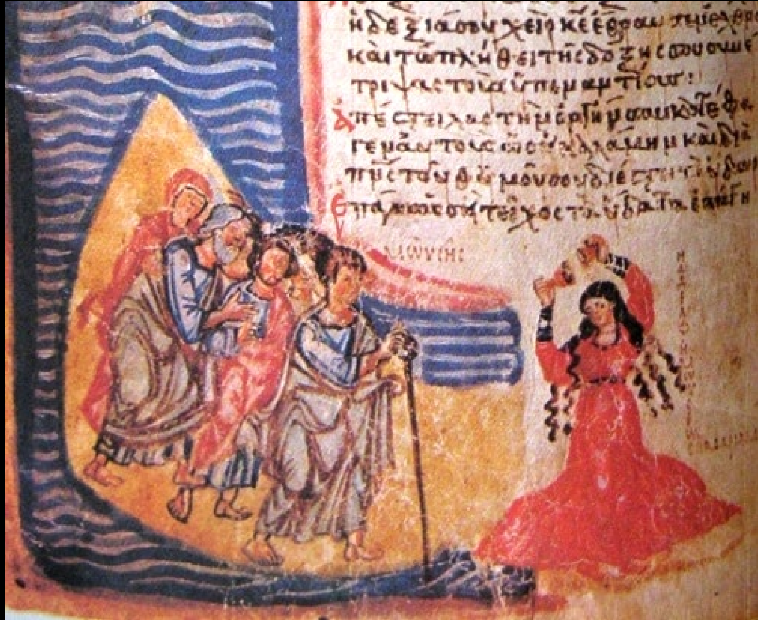
Dance of Miriam upon Crossing the Red Sea -- Chludov Psalter, State Hist. Museum, Moscow