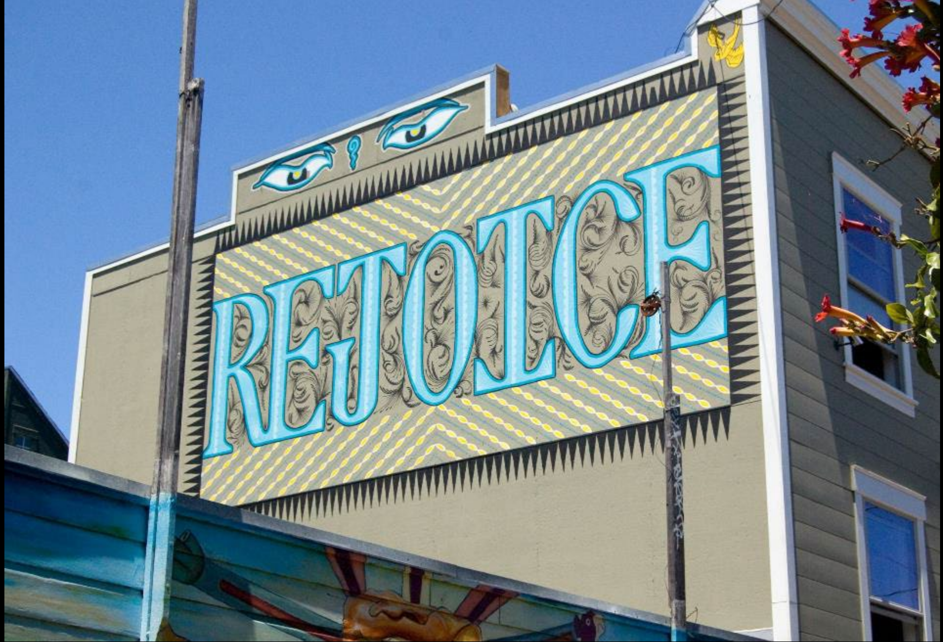
Rejoice! -- Mural in Mission District, San Francisco, CA