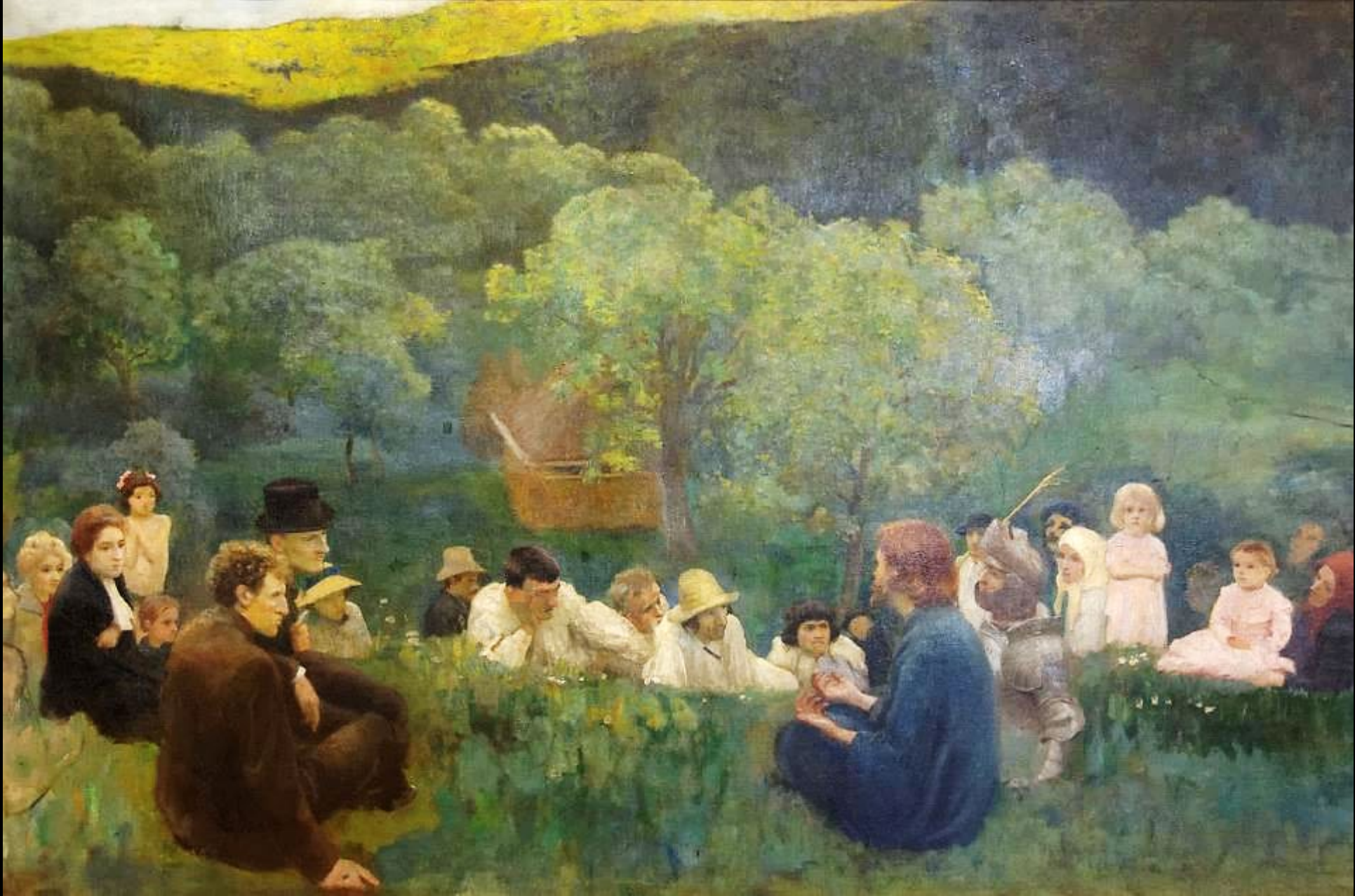
Sermon on the Mountain -- Karoly Ferenczy, Hungarian National Gallery, Budapest, Hungary