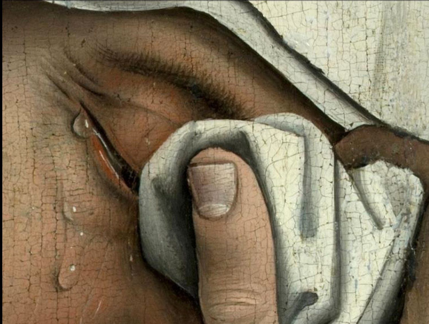
Mary's Tears, detail from Descent from the Cross-- Rogier van der Weyden, Prado, Madrid