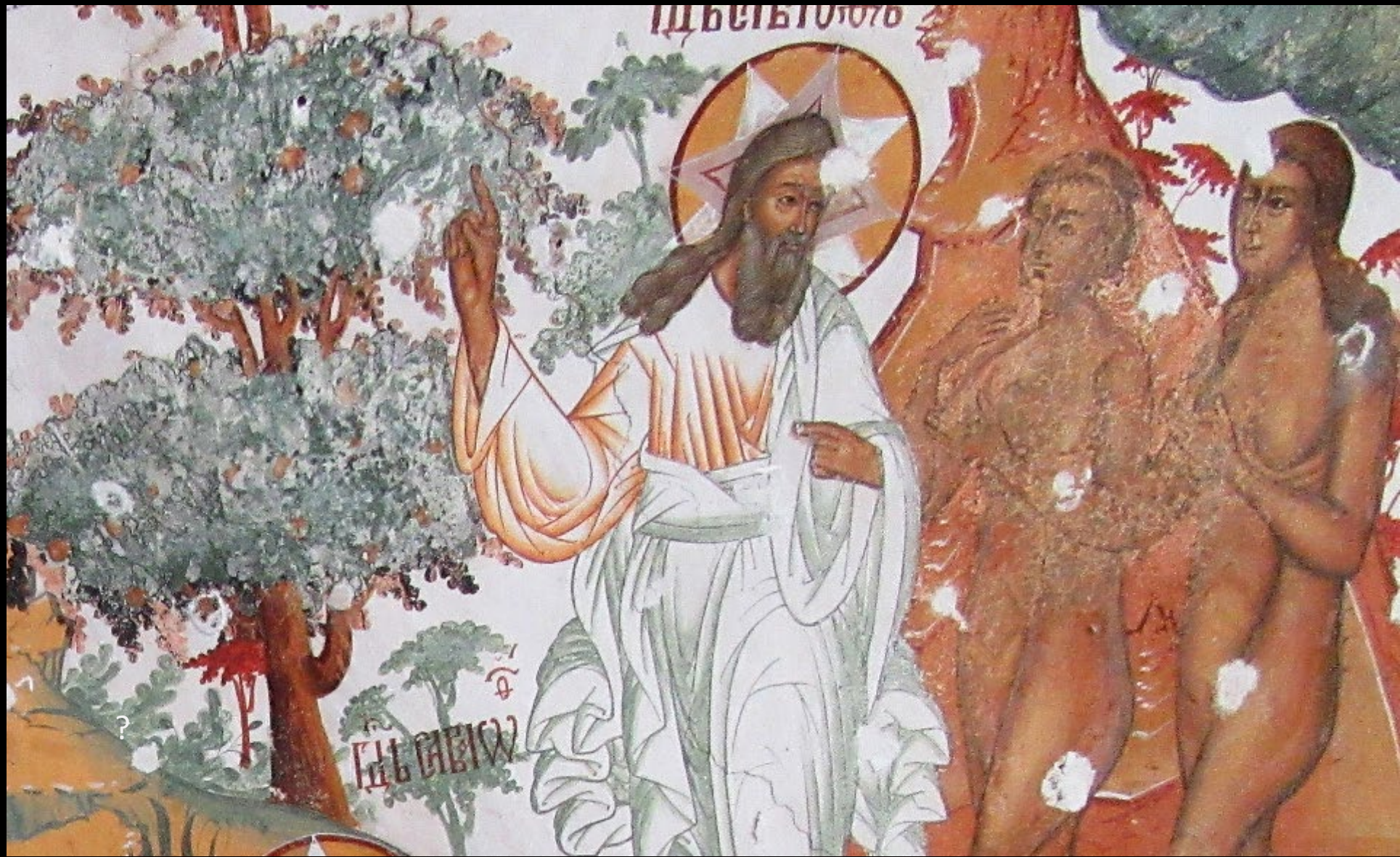
Heavenly Paradise, detail -- Cathedral of the Resurrection, Toutaiev, Russia