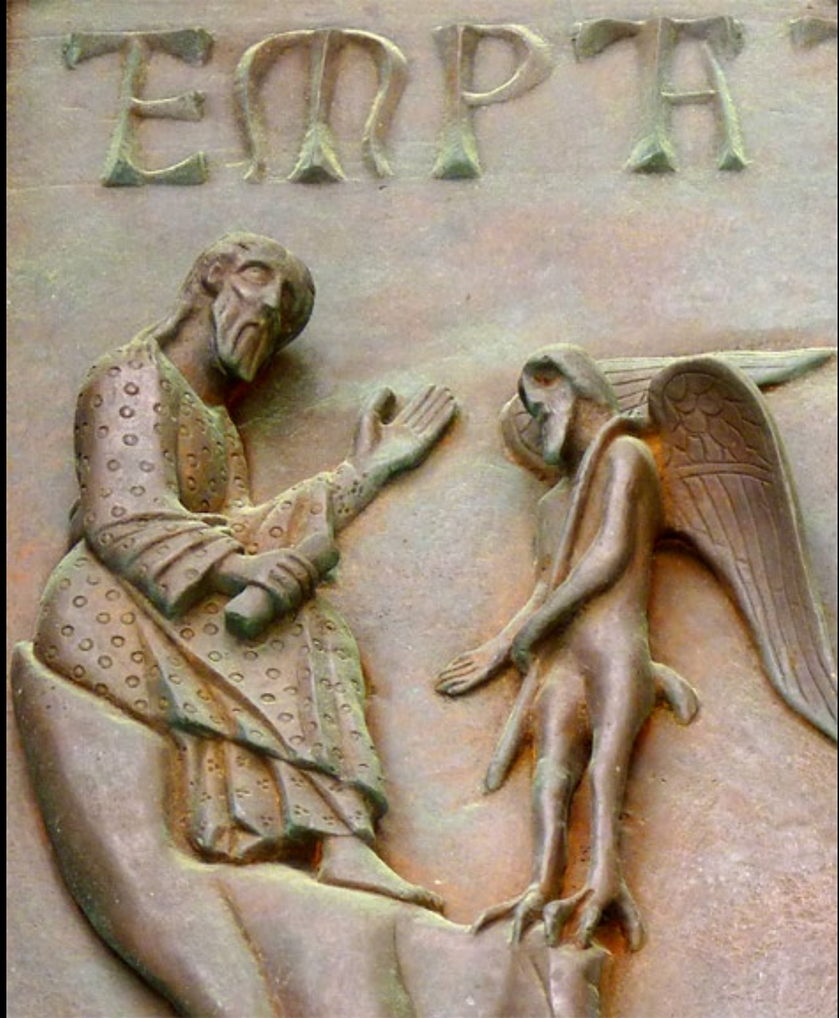
Temptation of Christ