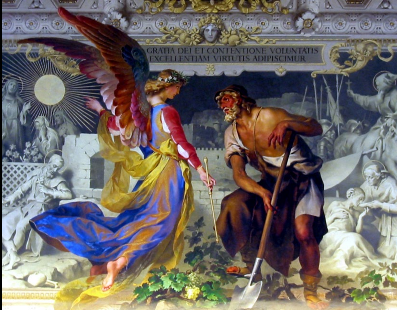
"With the grace of God and the effort of will, we obtain the excellence of virtue" -- Vatican Museum