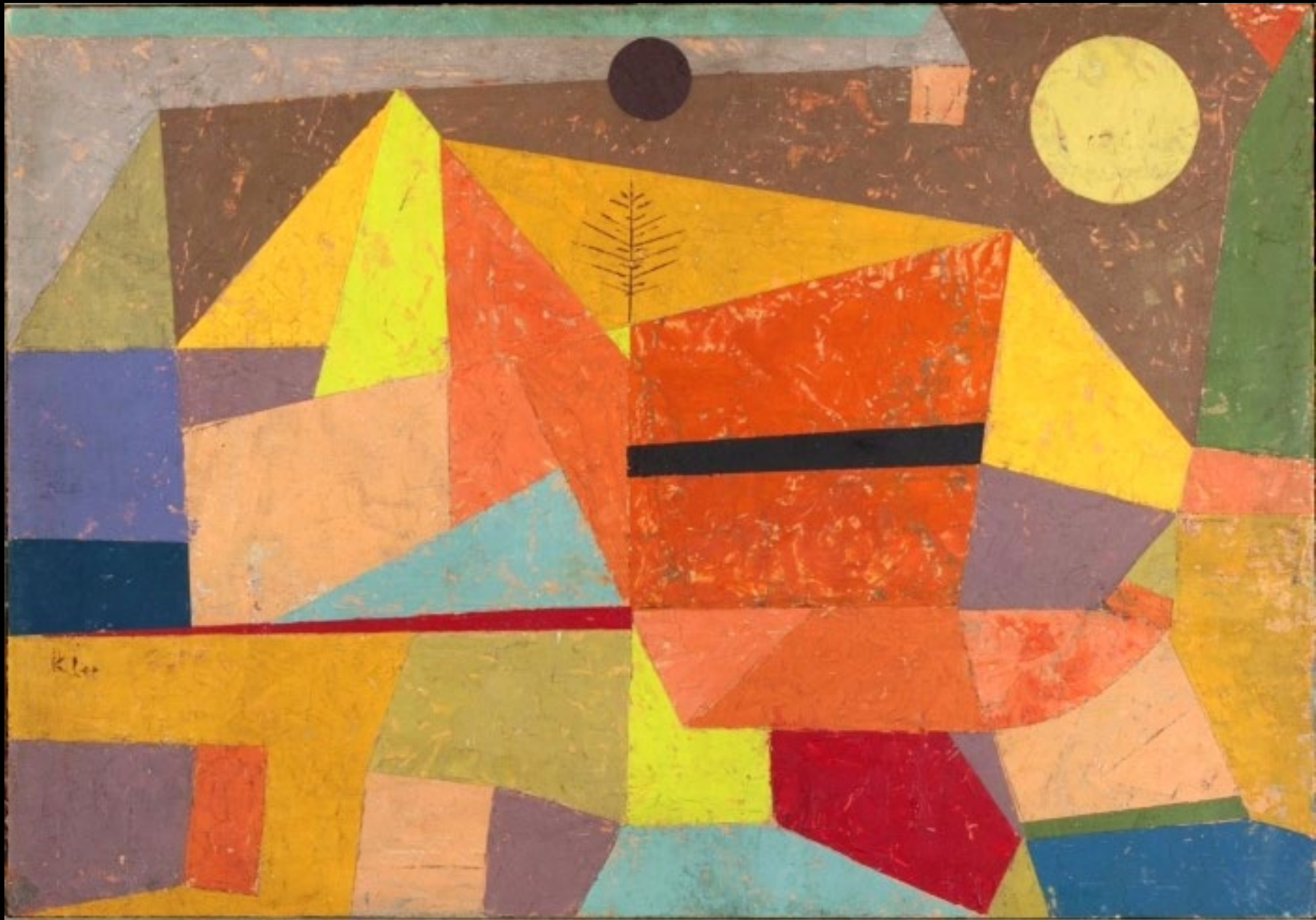
Joyful Mountain Landscape -- Paul Klee, Yale University Art Gallery, New Haven, CT