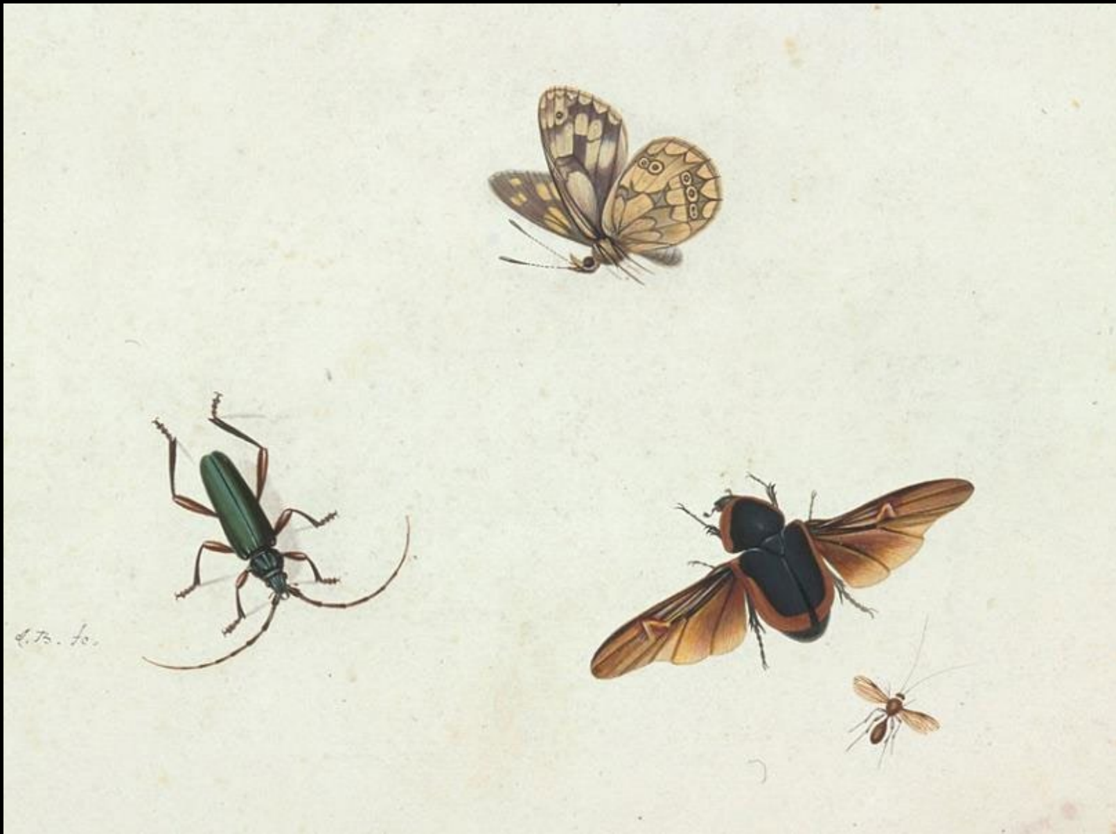
Four Insects -- Johannes Bronkhorst, Centraal Museum, Utrecht, Netherlands