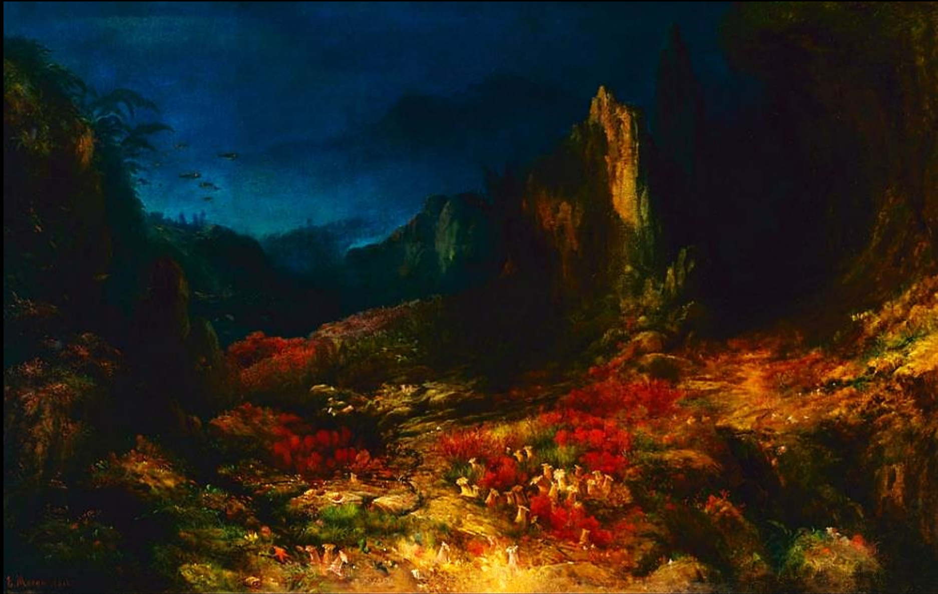
The Valley in the Sea (1862) -- Edward Moran, Indianapolis Museum of Art