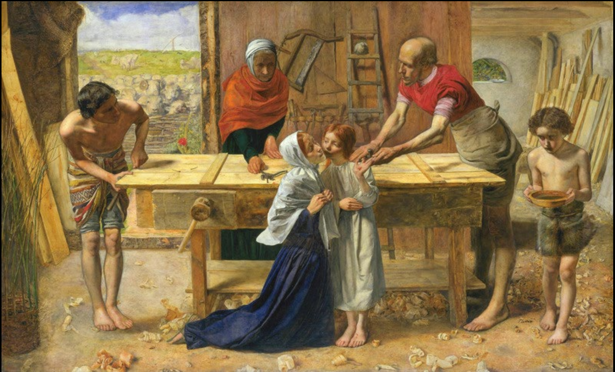
Christ in the House of His Parents -- John Everett Millais, Tate Britain, London