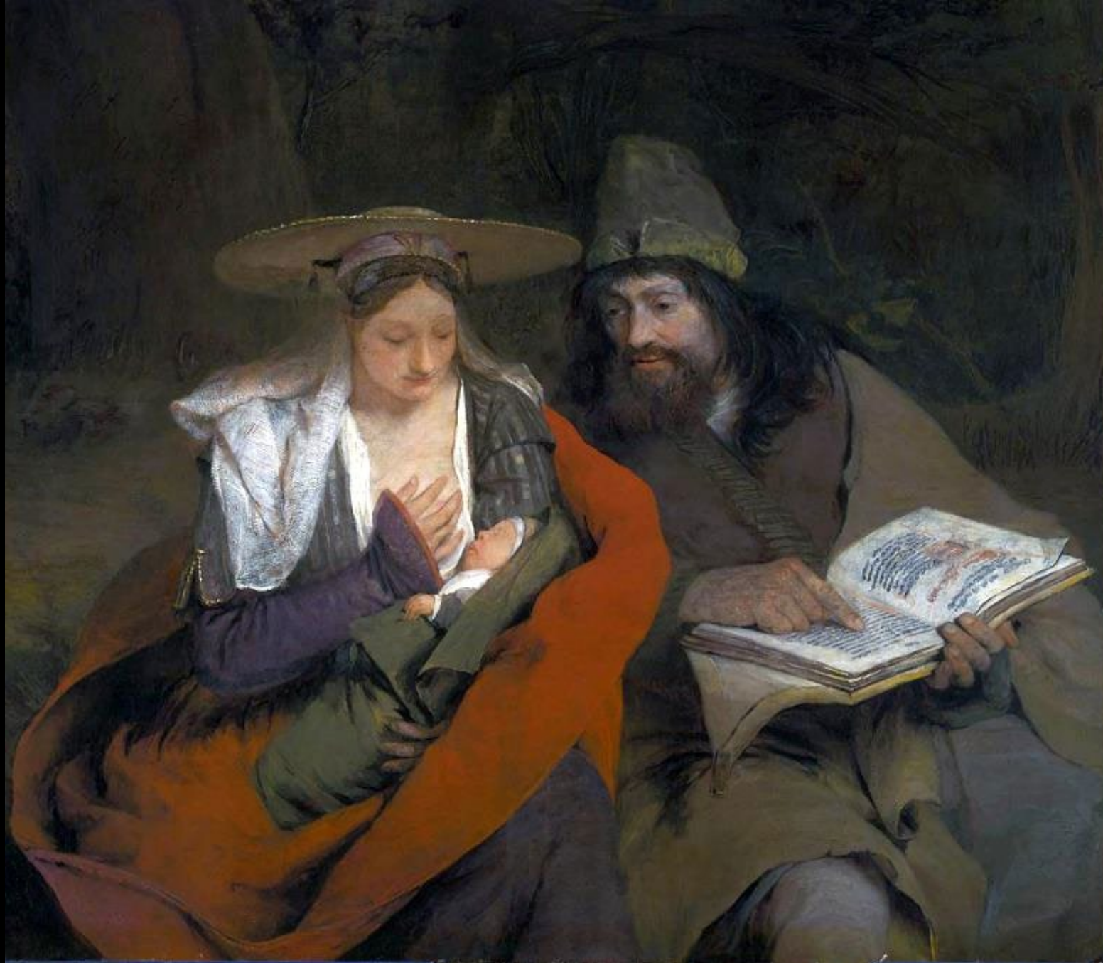
Rest on the Flight into Egypt -- Aert de Gelder, MFA, Boston