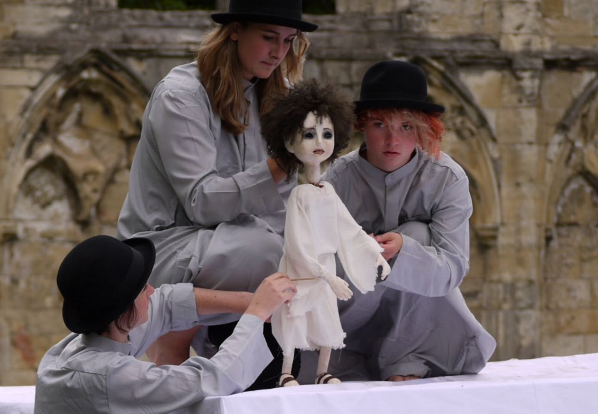
Massacre of the Innocents, a Mystery Play -- York Cathedral, York, England