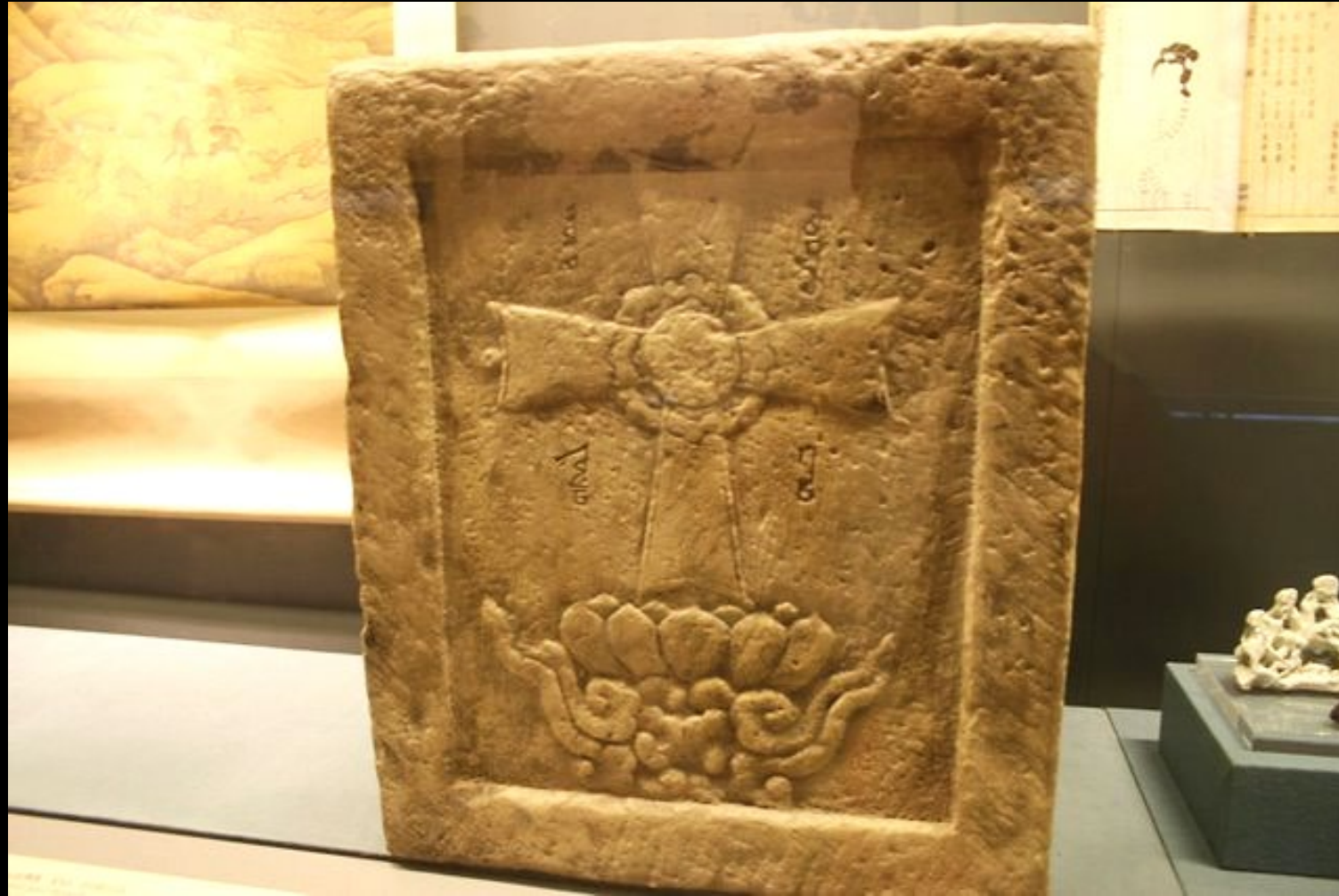
Nestorian Stone Cross from location of ancient monastery, Beijing, China, 1271-1368