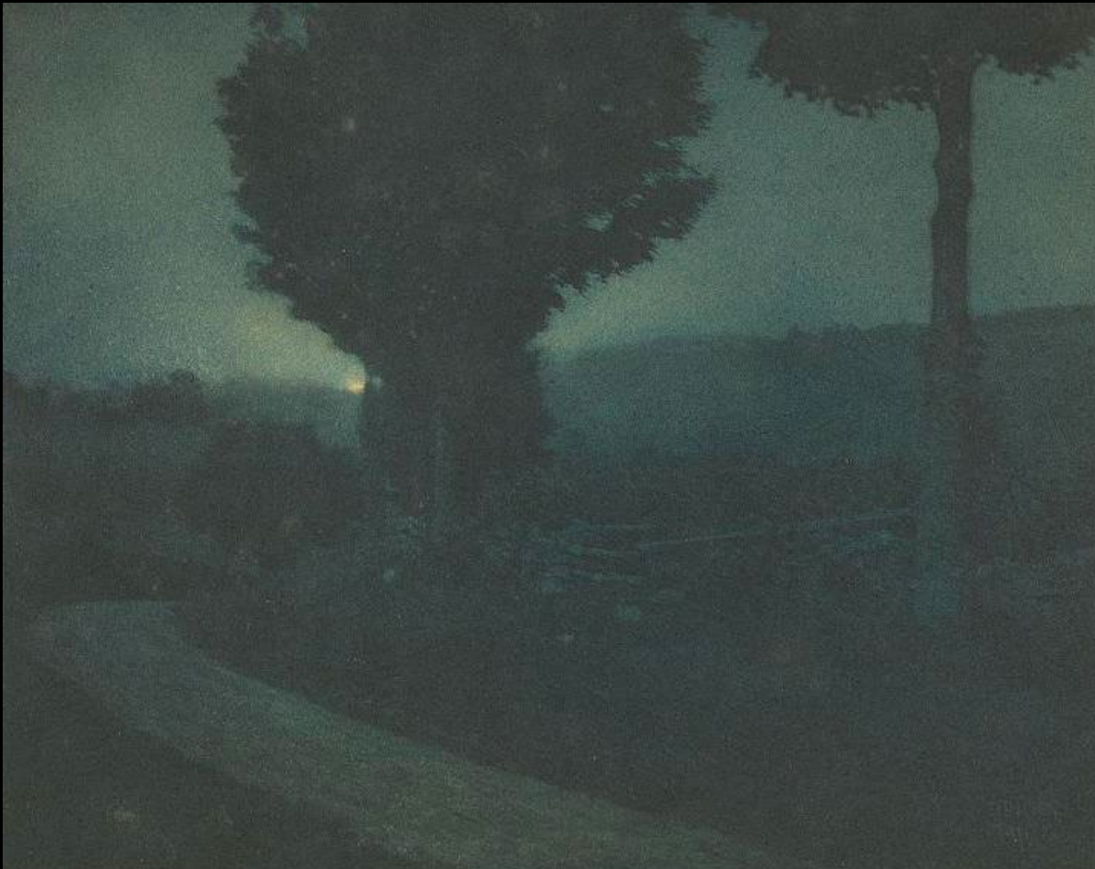
Road Into the Valley – Moonrise -- Edward Steichen, photo gravure