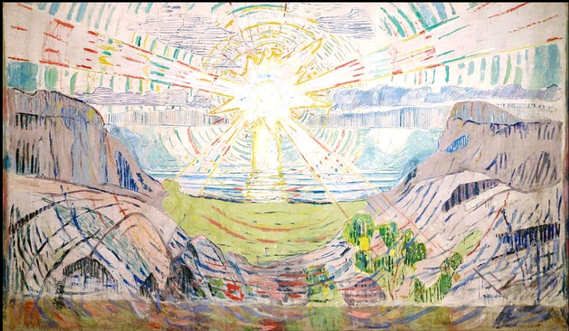
The Sun -- Edvard Munch, Munch Museum, Oslo, Norway