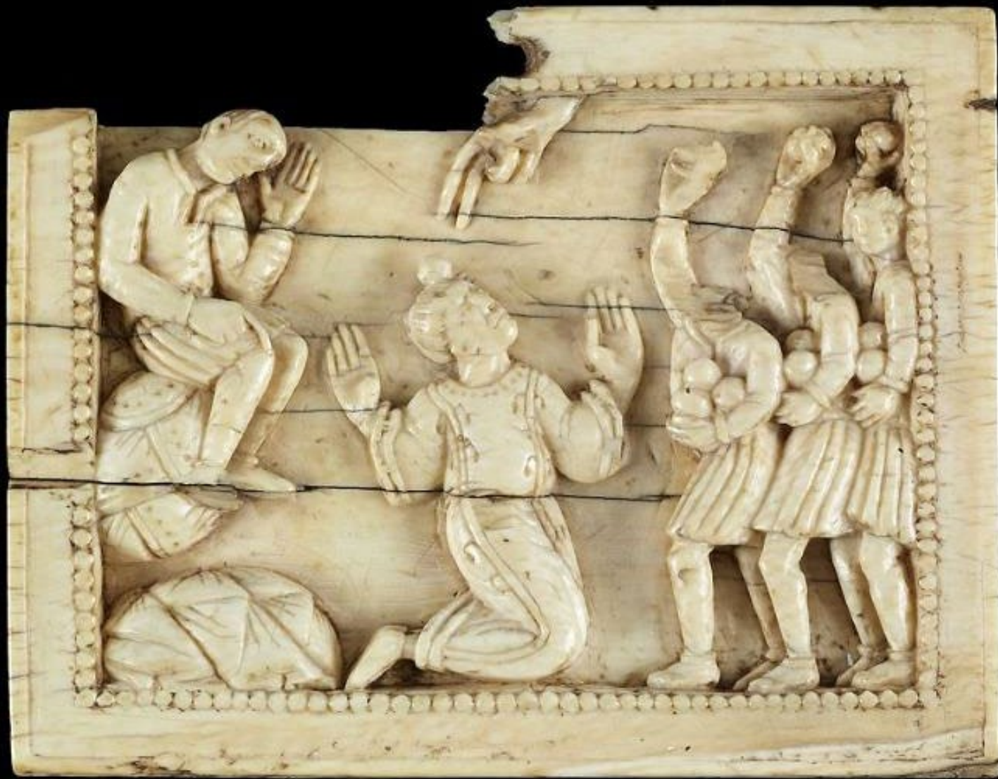
The Stoning of Stephen -- Mosan Workshop, Walters Art Museum, Baltimore, MD