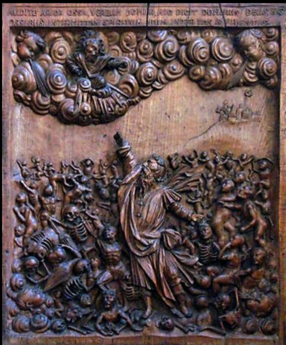
Ezekiel in Valley of Bones

St Nicholas Church Deptford Green, England