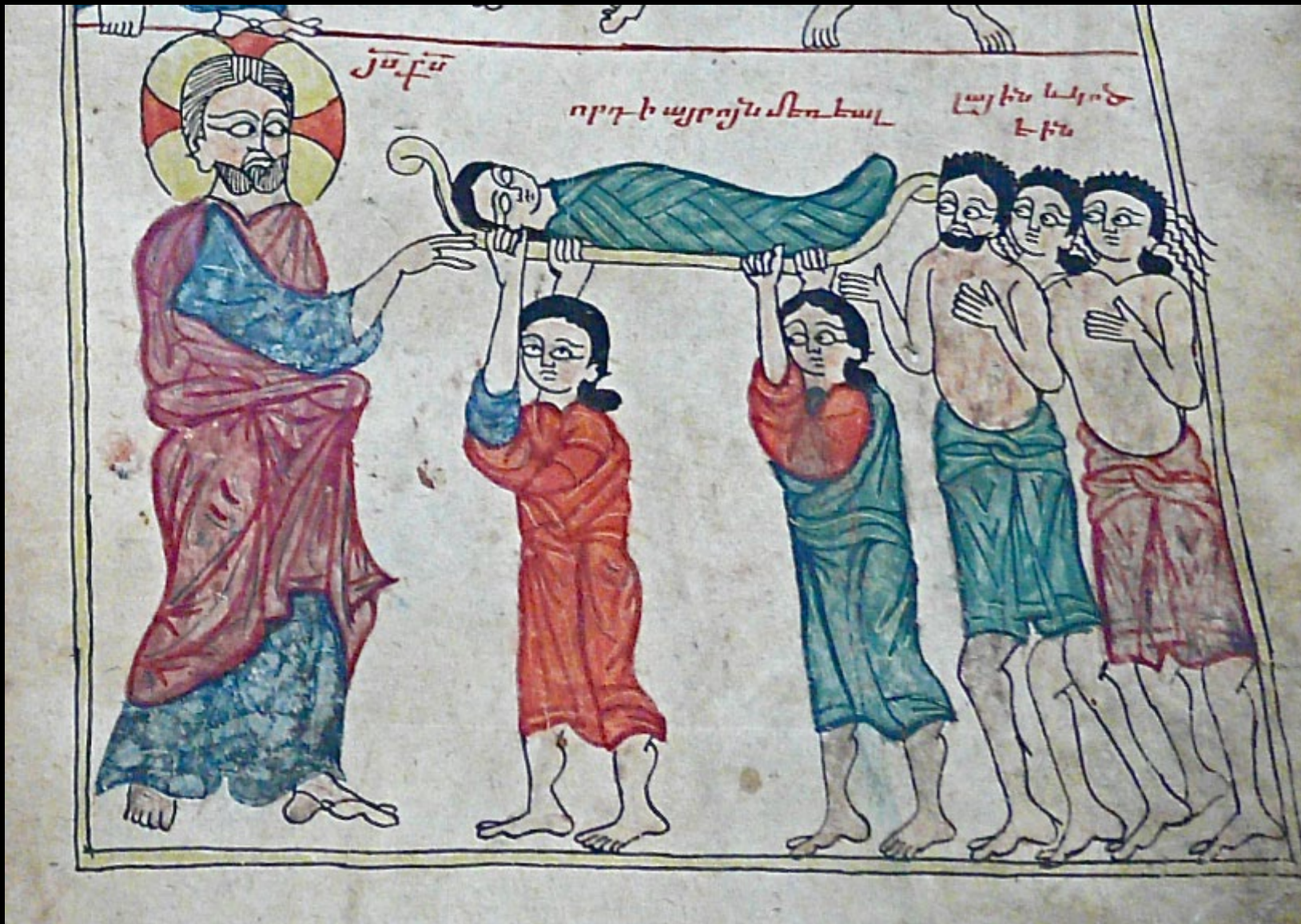
Gospel of Lazarus, 887 AD -- Mesrops Mashtots Institute of Ancient Manuscripts, Yerevan, Armenia