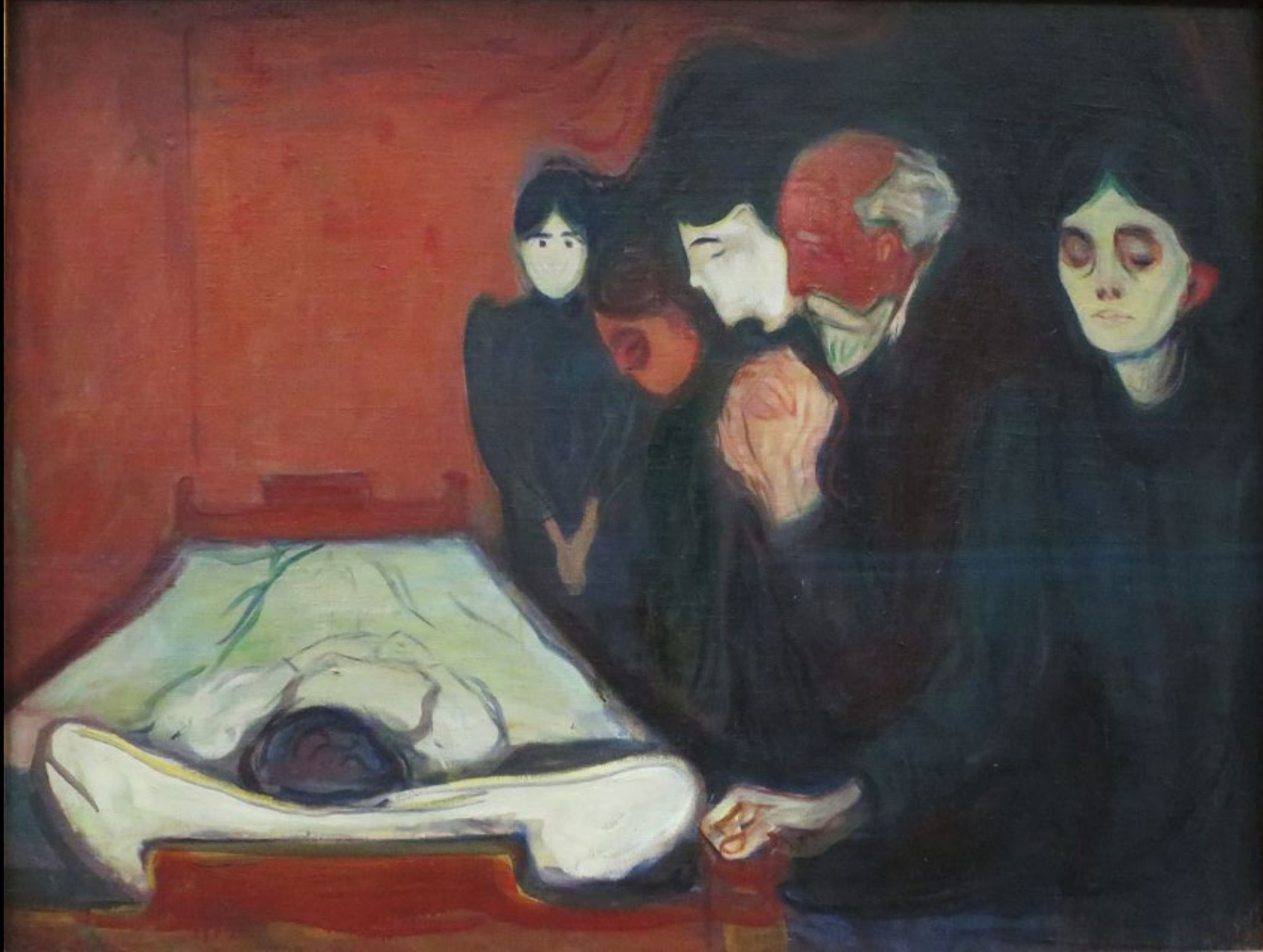
At the Deathbed -- Edvard Munch, Bergen Kunstmuseum, Bergen, Norway