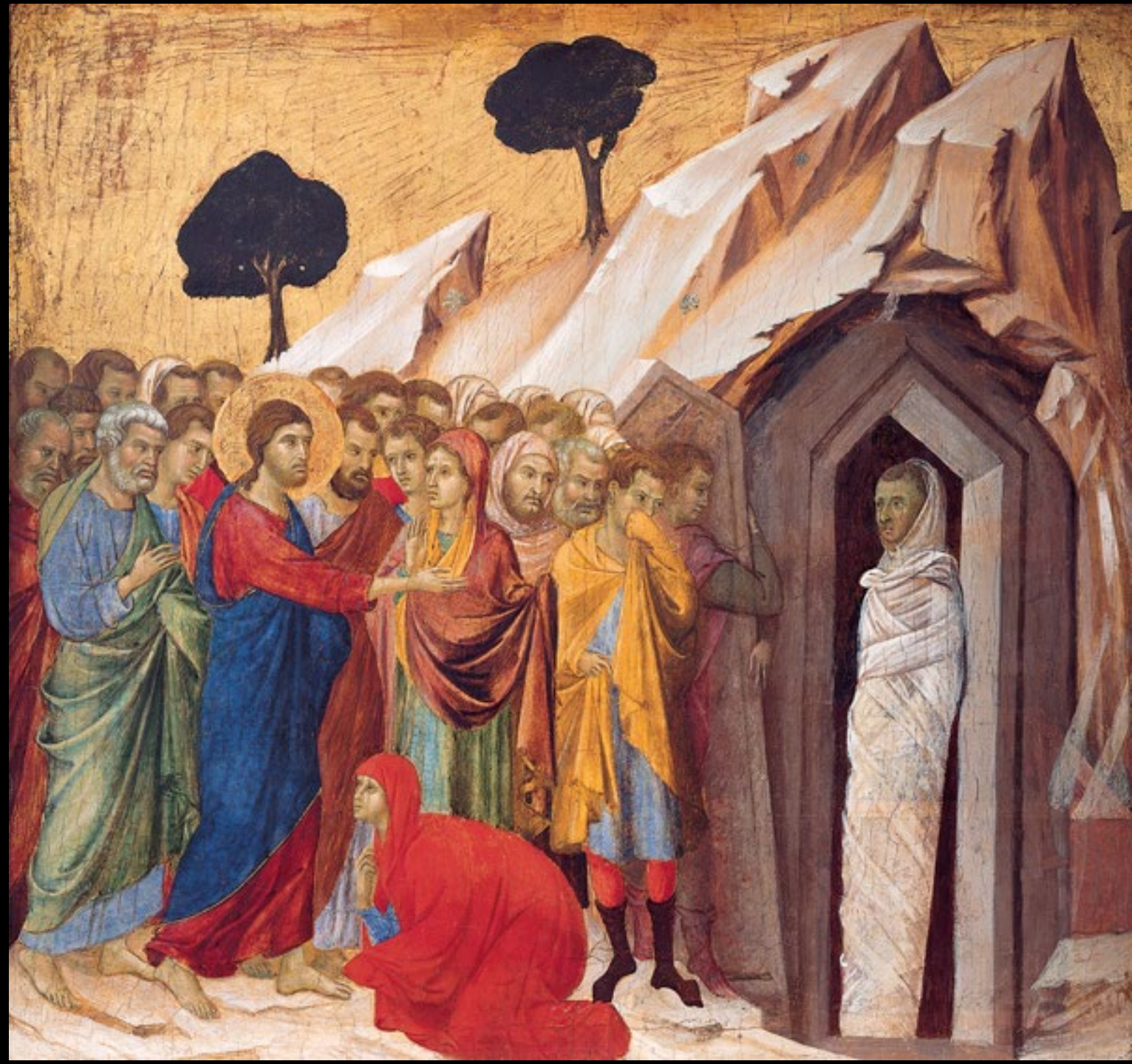
Raising of Lazarus Duccio Kimbell Art Museum Fort Worth, TX