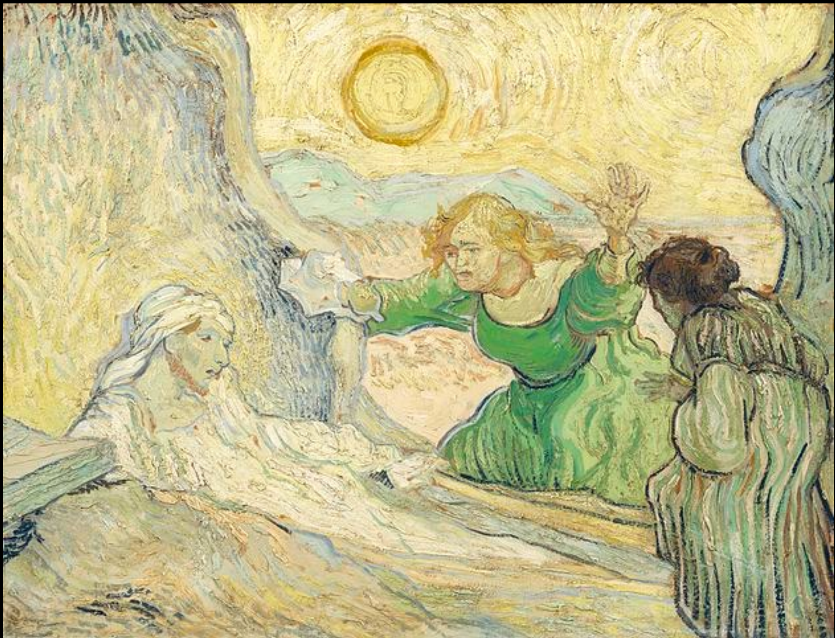
Resurrection of Lazarus -- Vincent van Gogh, Van Gogh Museum, Amsterdam