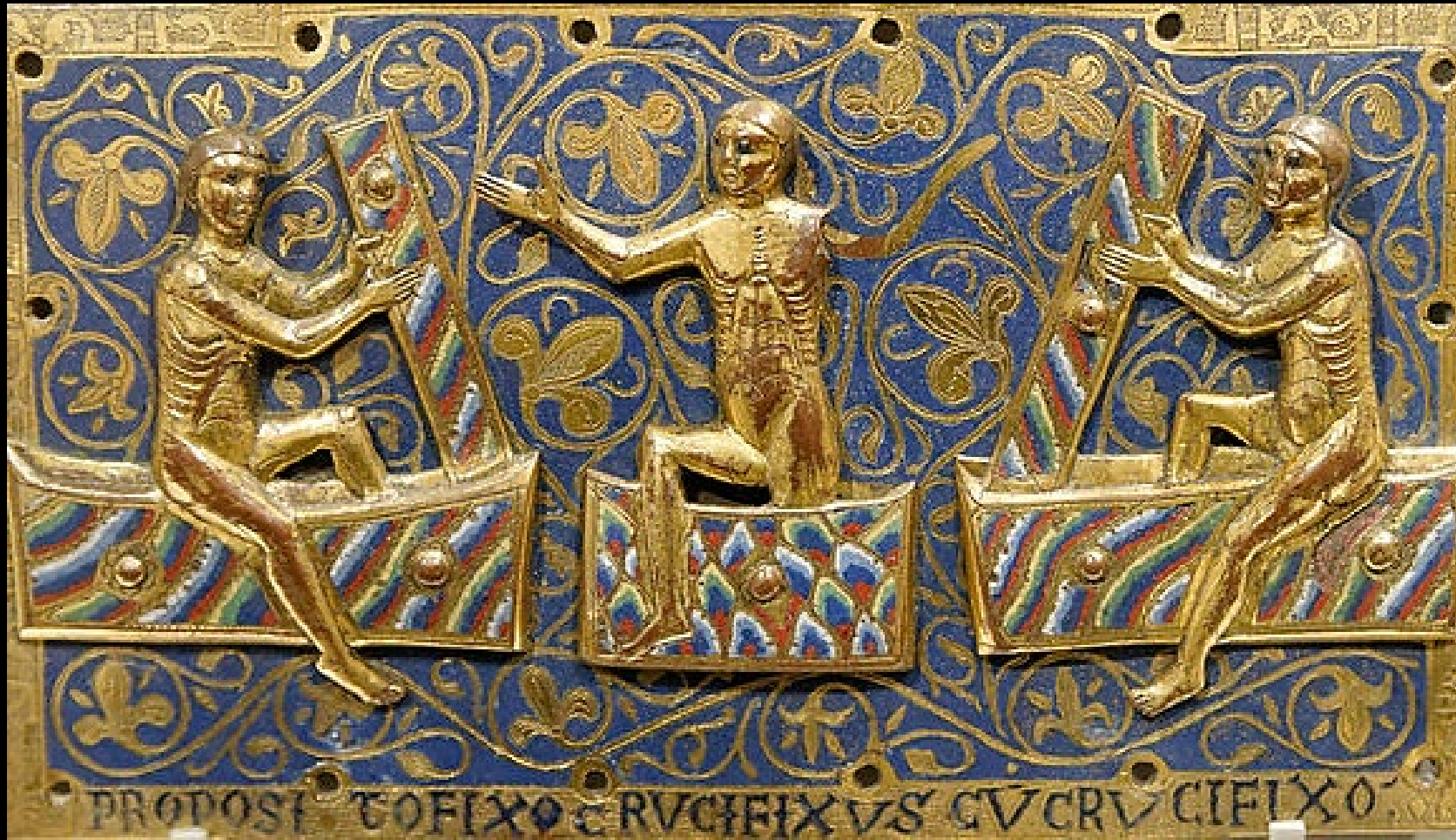
Resurrection of the Dead -- Limoges, Victoria and Albert Museum, London