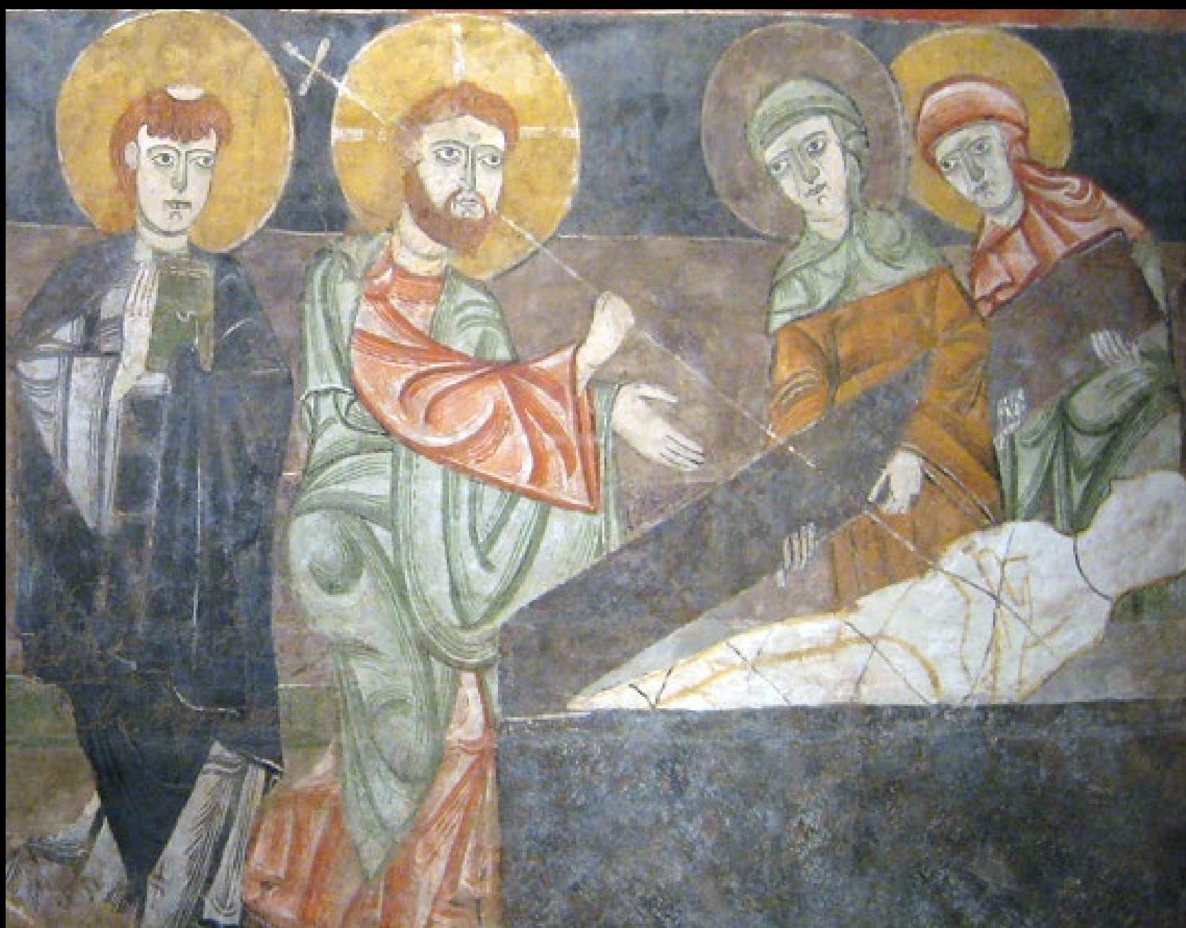
Raising of Lazarus -- Spanish, Cloisters Museum, New York City