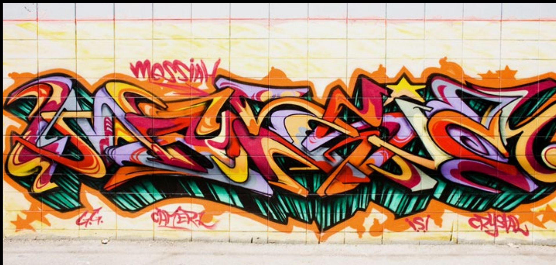
Messiah! -- Mural, San Jose, CA