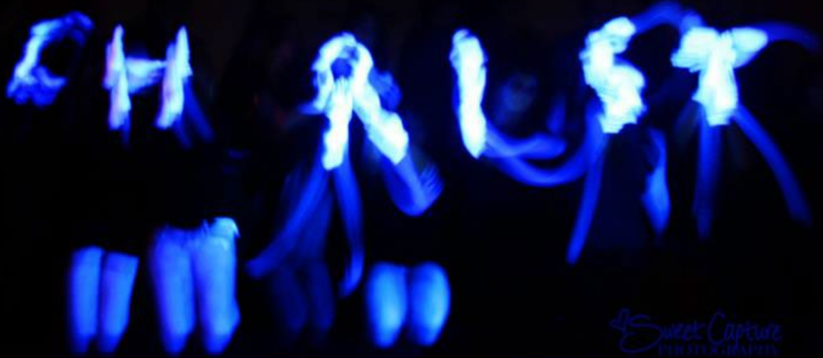
Light of the World -- Presentation by church youth with gloves in dark space