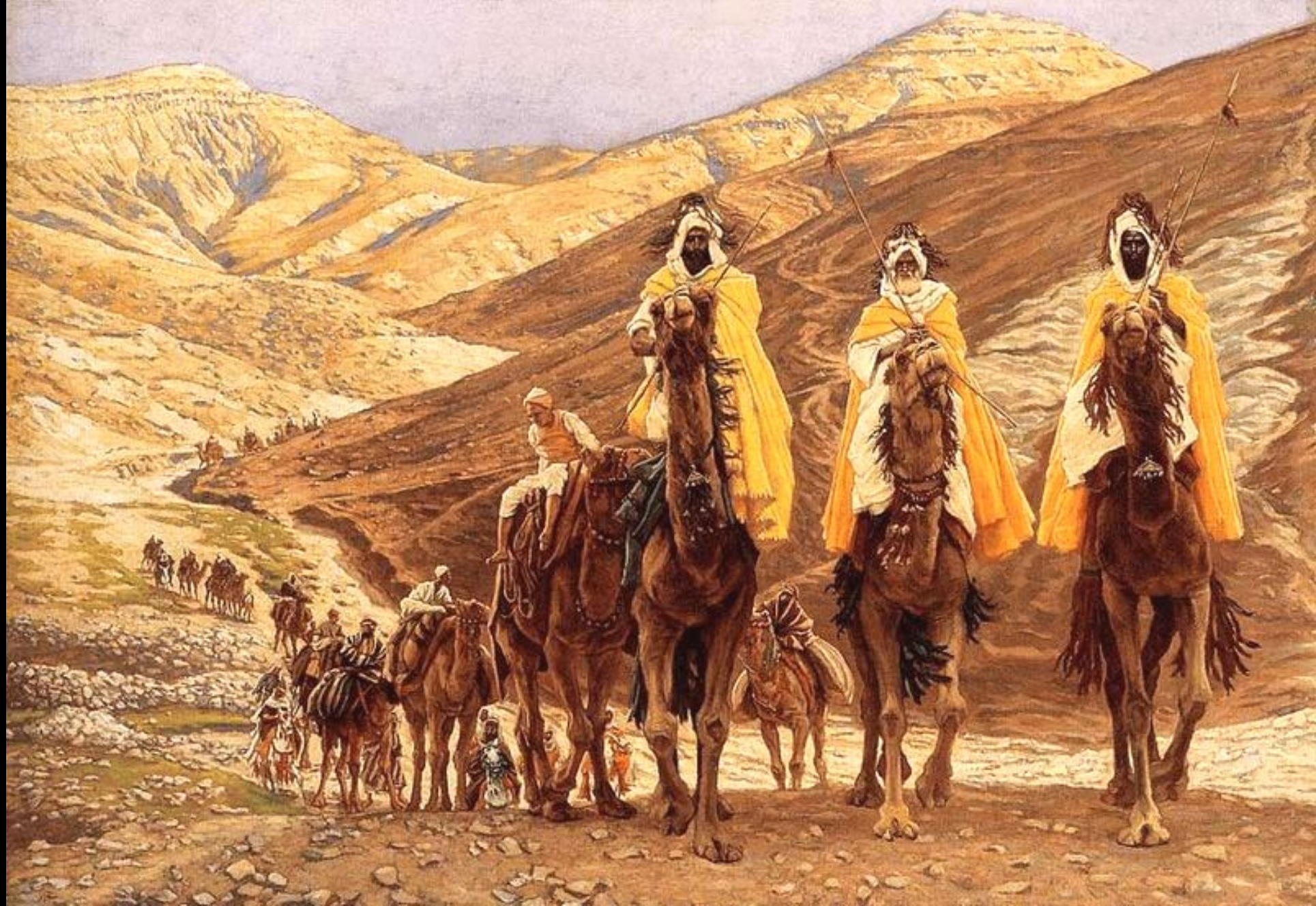
Journey of the Magi -- James Tissot, Minneapolis Institute of Art