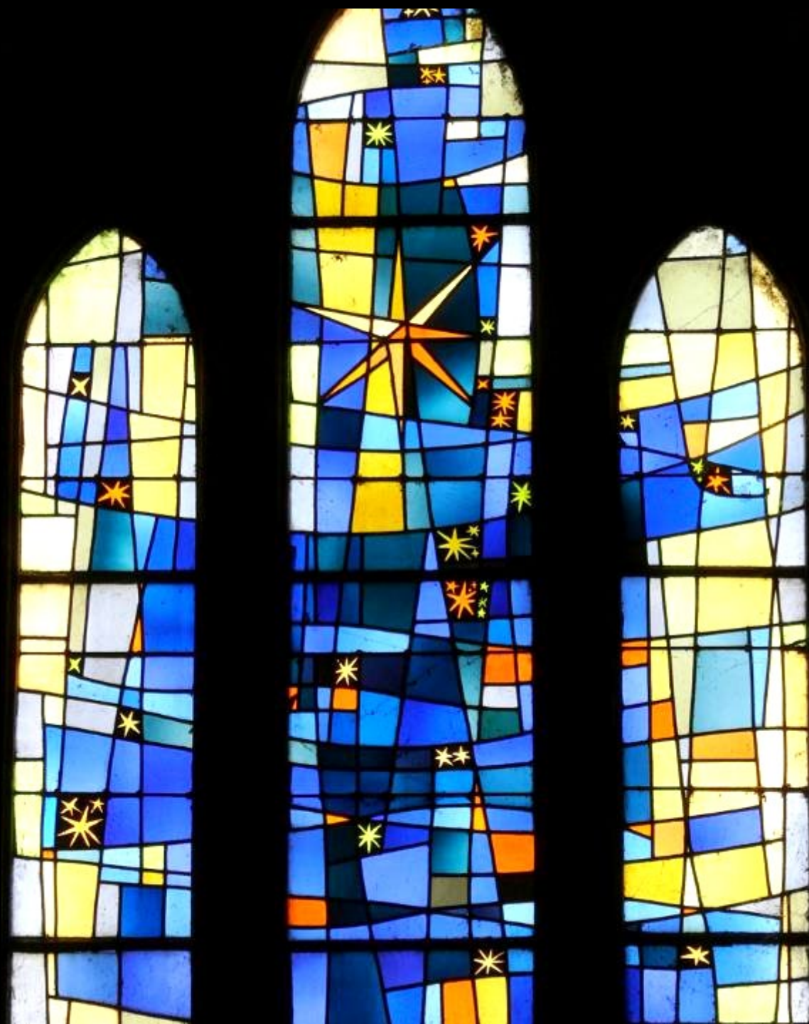
Heavenly Star Chapelle Notre Dame de Grace Villeneuve-sur-Lot, France