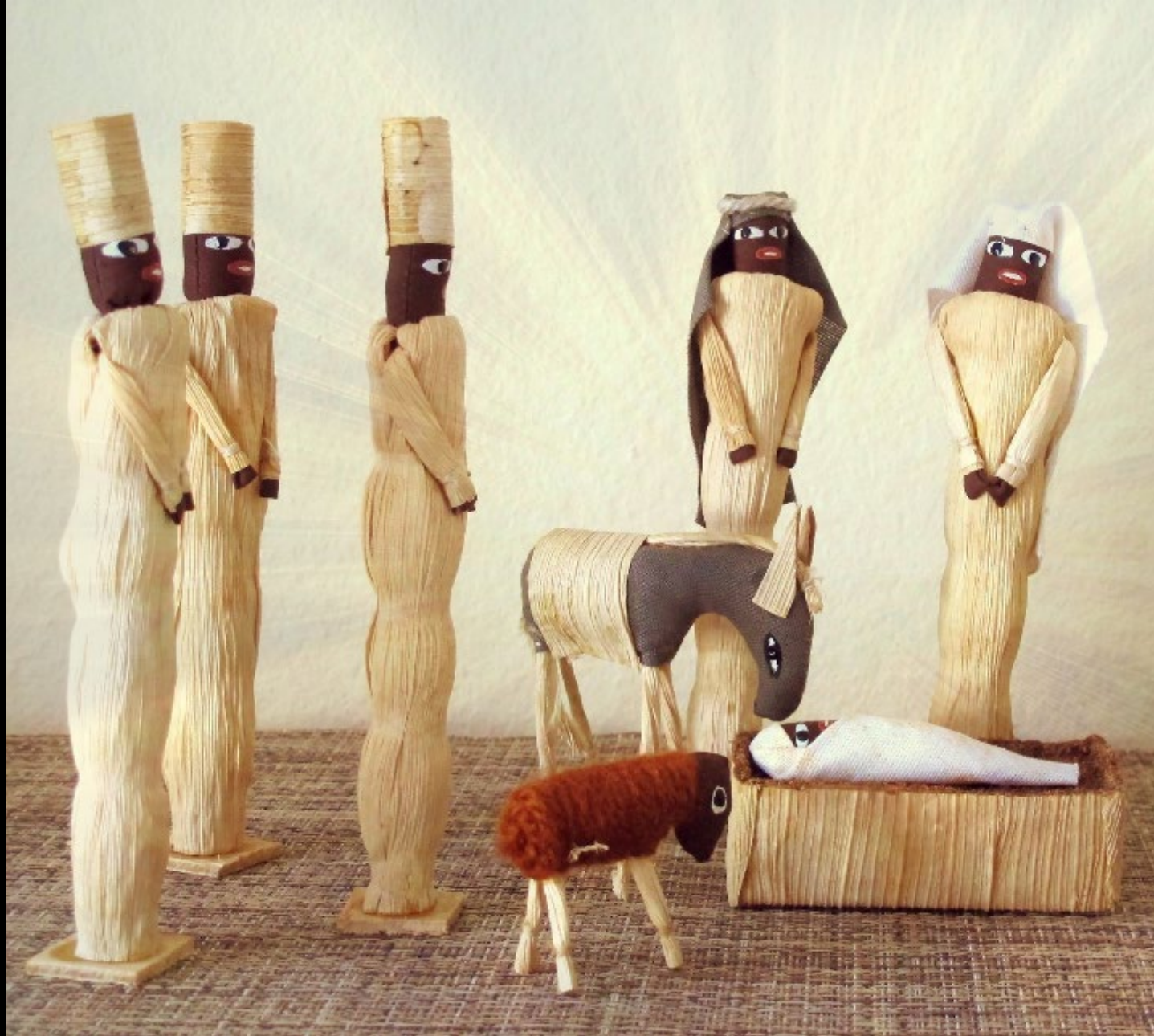
Krismasi Njema! -- Kenyan Nativity