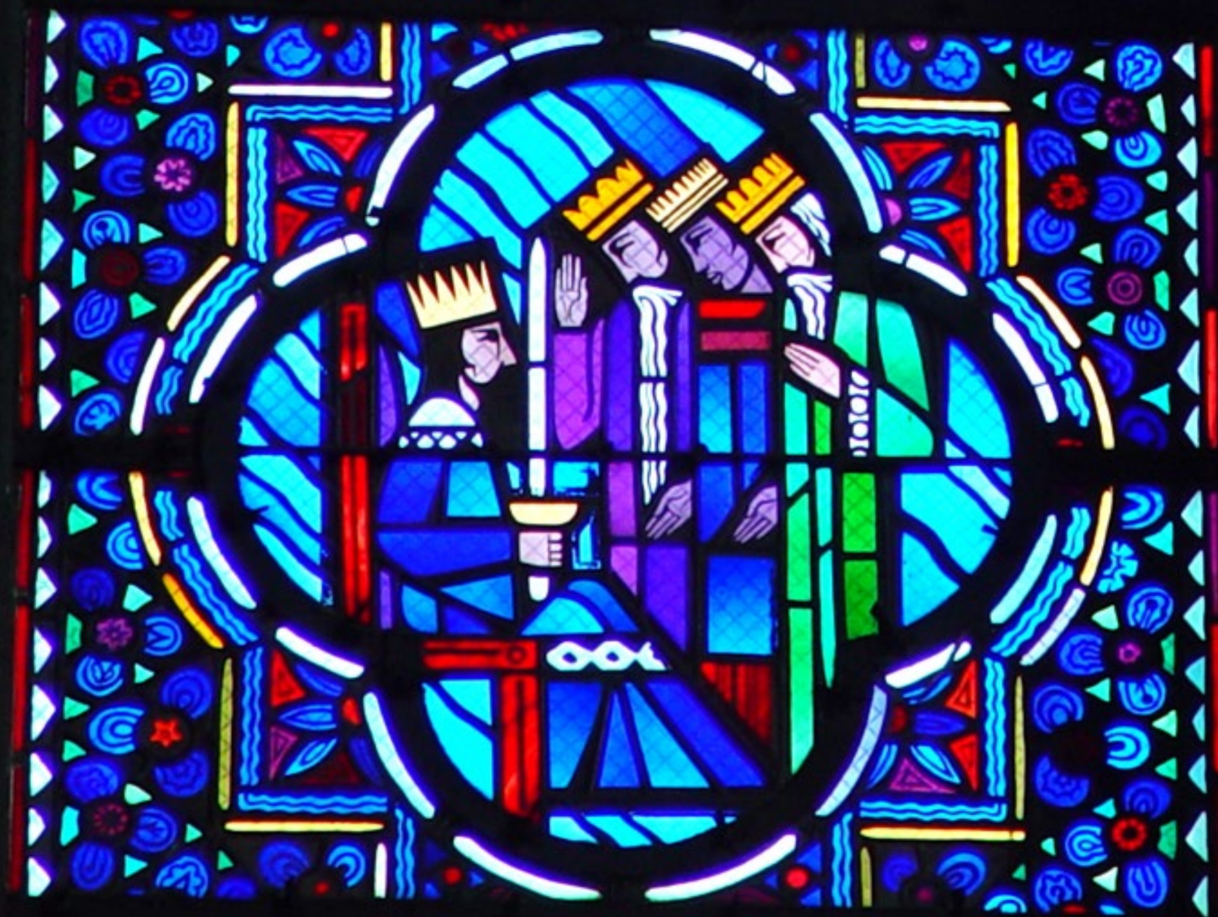
Wise Men Visit Herod -- Le Breton/Gaudin, Amiens Cathedral