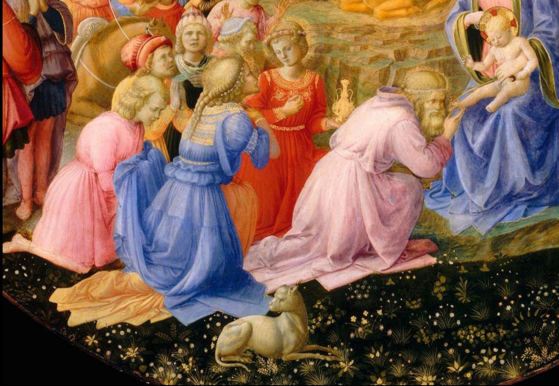
Adoration of the Magi -- Fra Angelico and Filippo Lippi, National Gallery of Art, Washington, DC