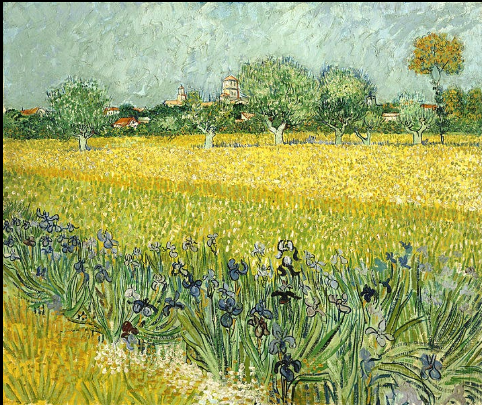
Field With Flowers Near Arles -- Vincent Van Gogh, Van Gogh Museum, Amsterdam