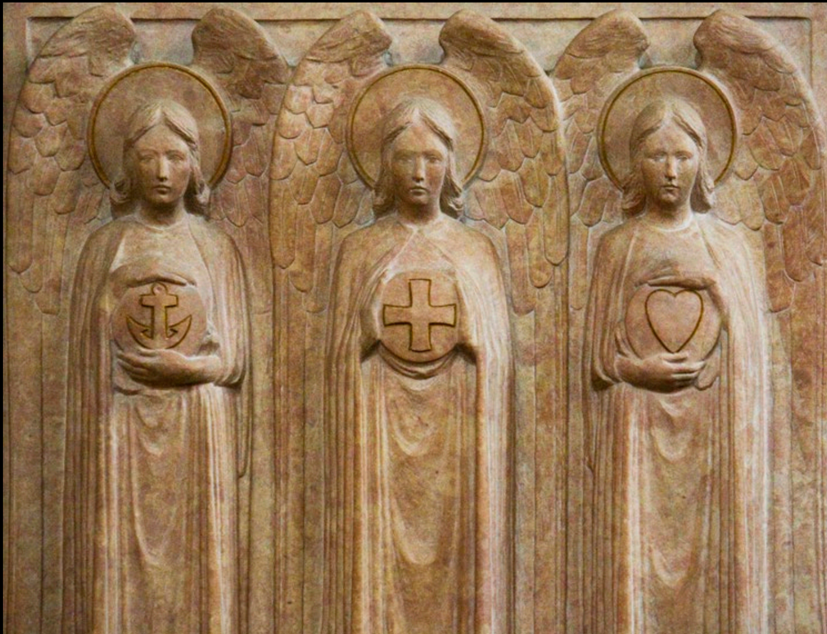
Faith, Hope, Charity -- St. Giles Cathedral, Edinburgh, Scotland