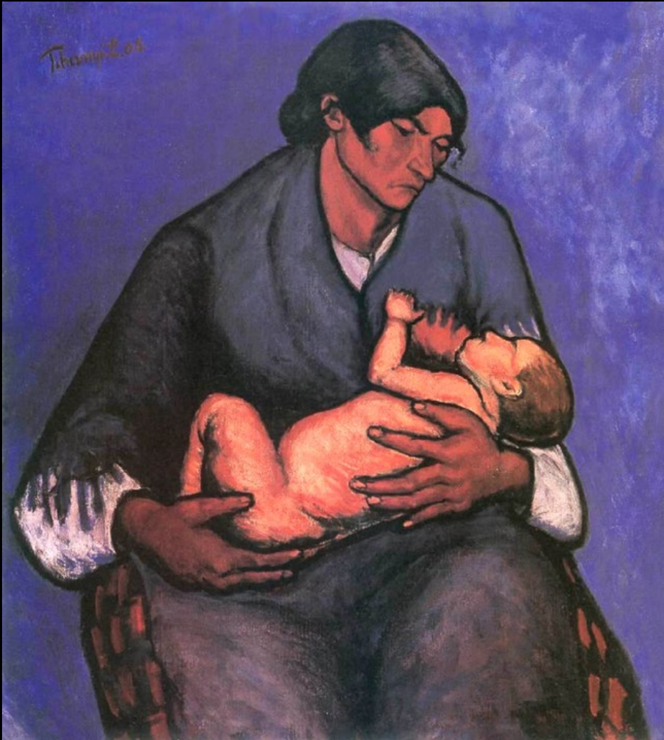
Gipsy Woman with Child