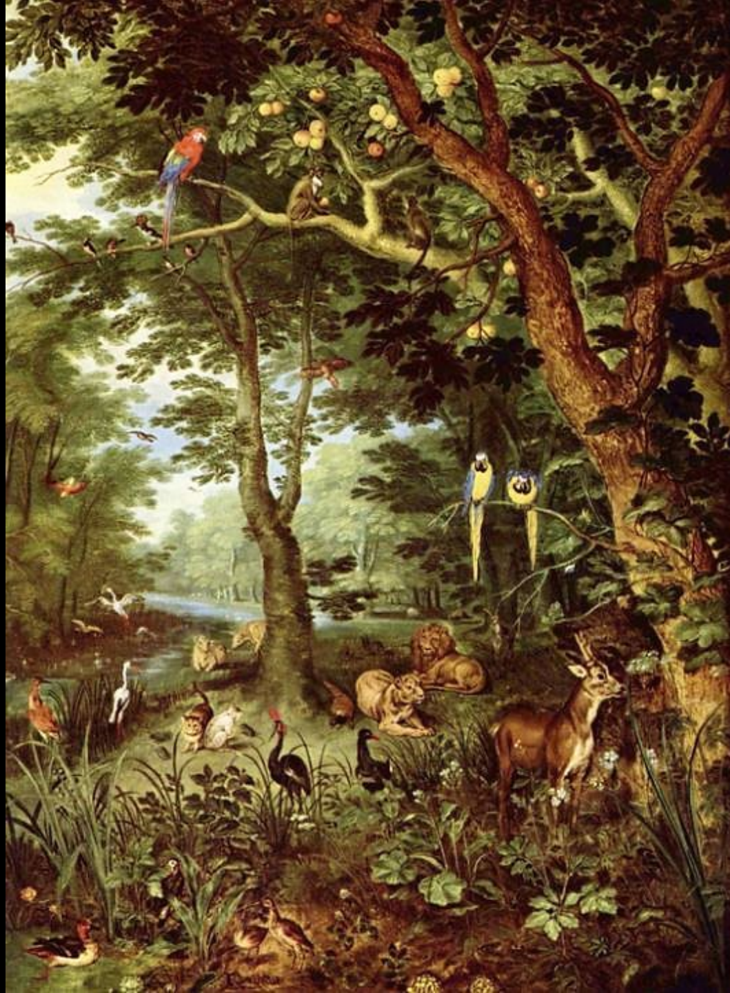
Paradise Jan Brueghel Gemaldegalerie Berlin, Germany