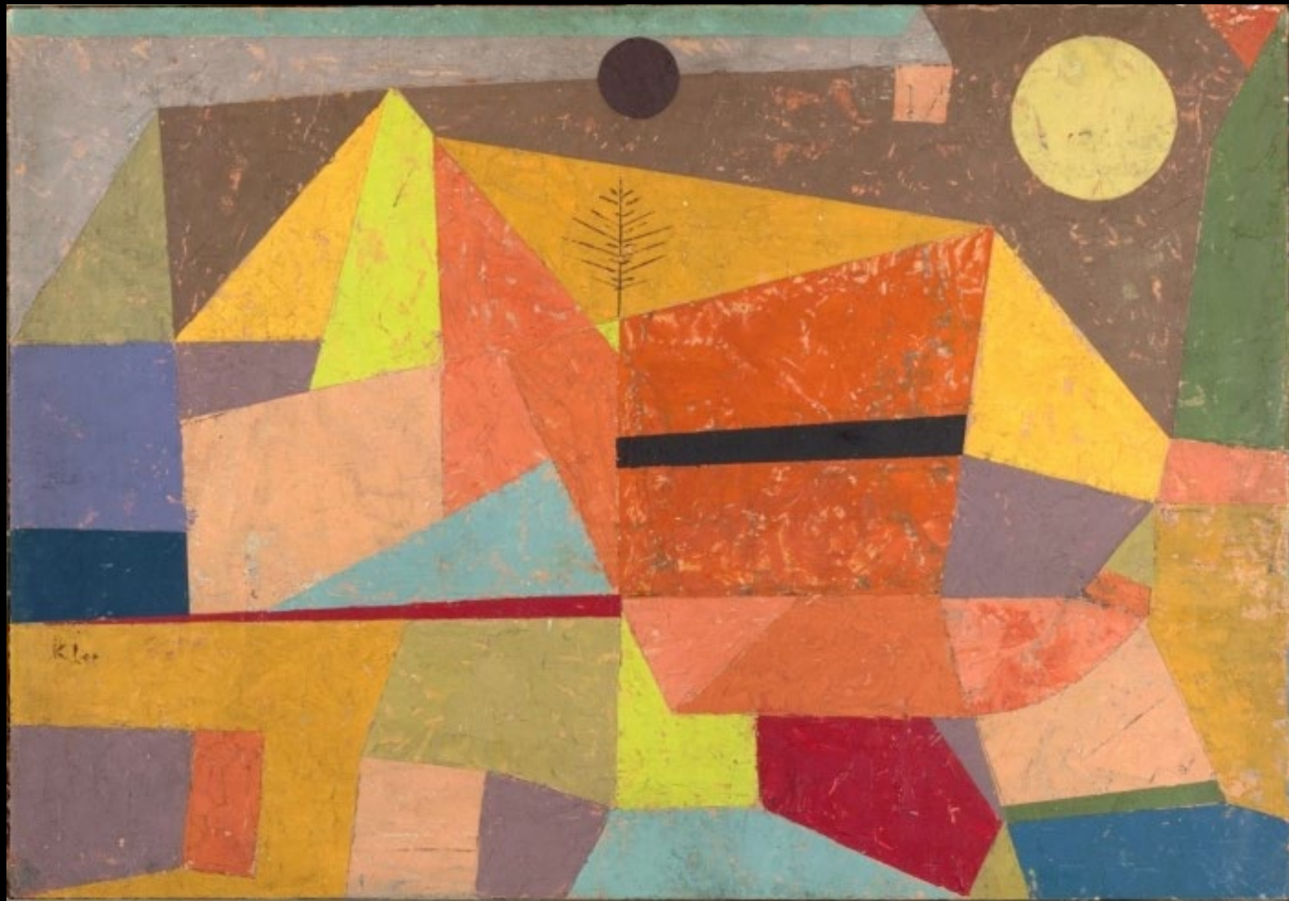
Joyful Mountain Landscape -- Paul Klee, Yale University Art Gallery, New Haven , CT