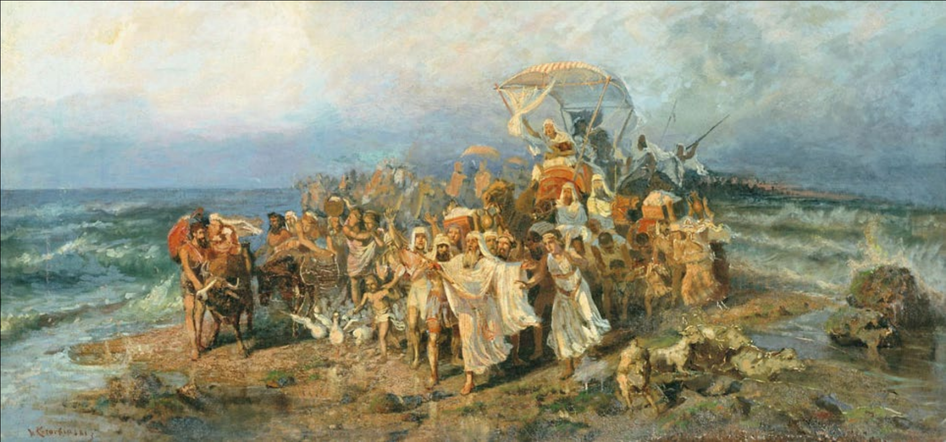
Crossing the Red Sea -- Wilhelm Kotarbiński, Kiev National Museum, Kiev, Ukraine