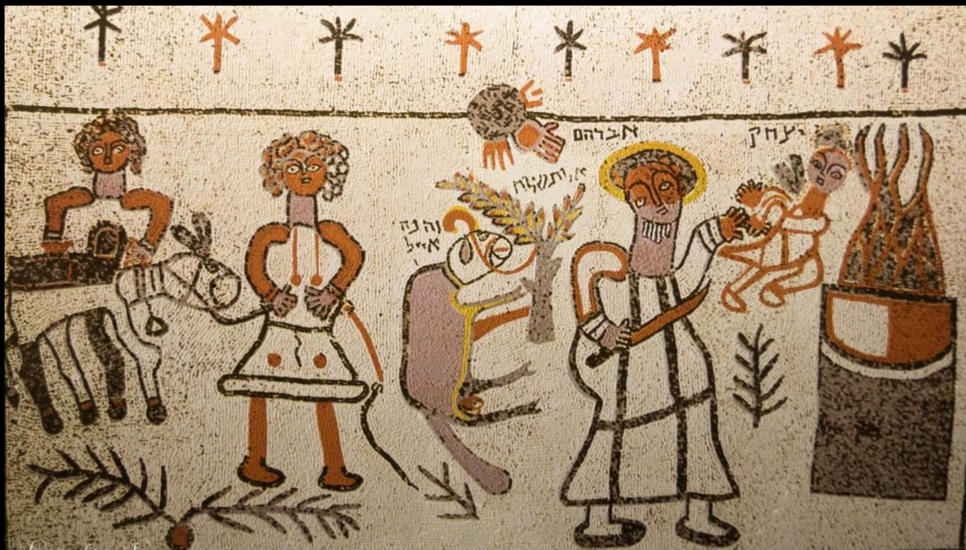
Bet Alfa Synagogue 5 th century floor mosaic -- Bet Alfa, Israel