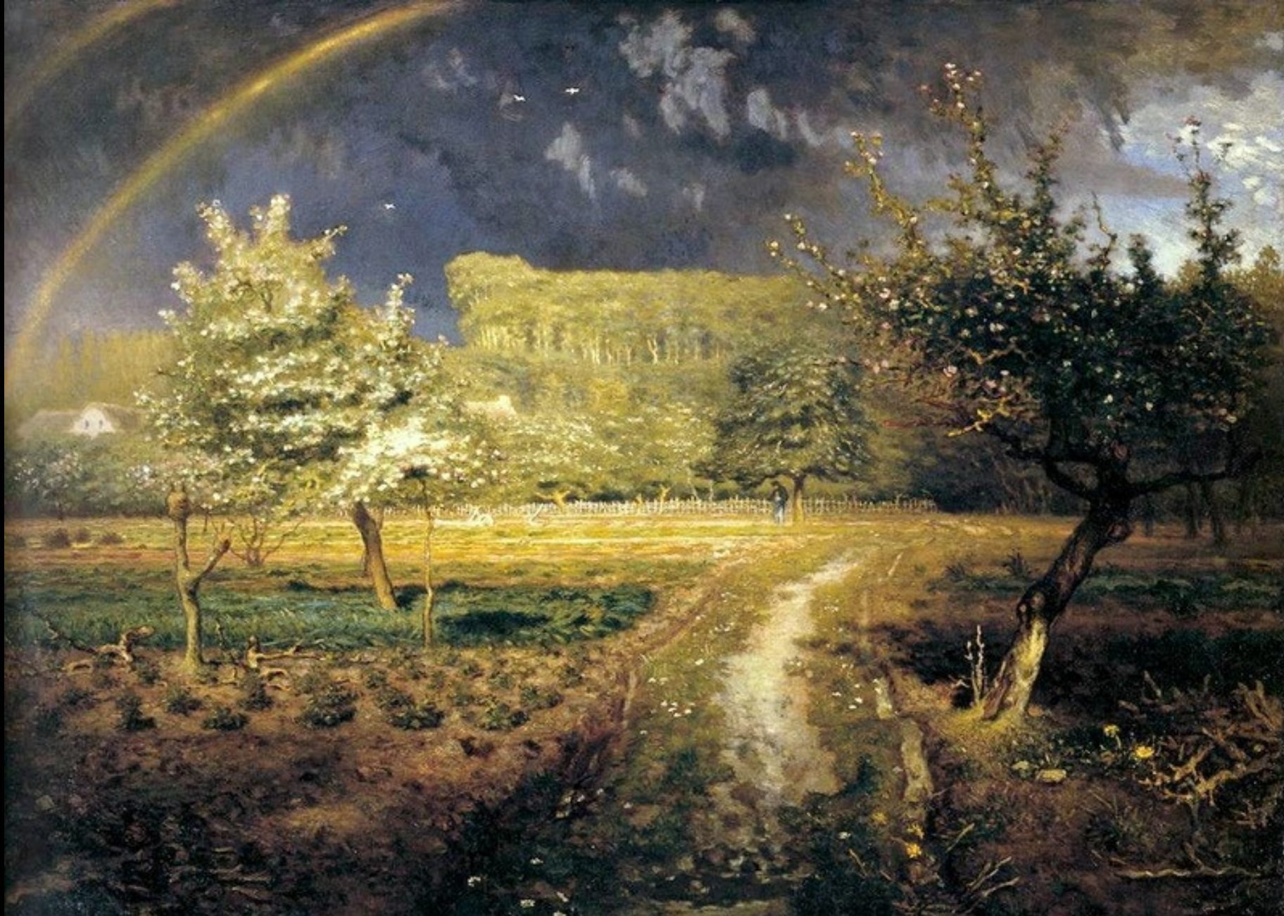
Spring -- Jean Millet, Musee D'Orsay, Paris, France