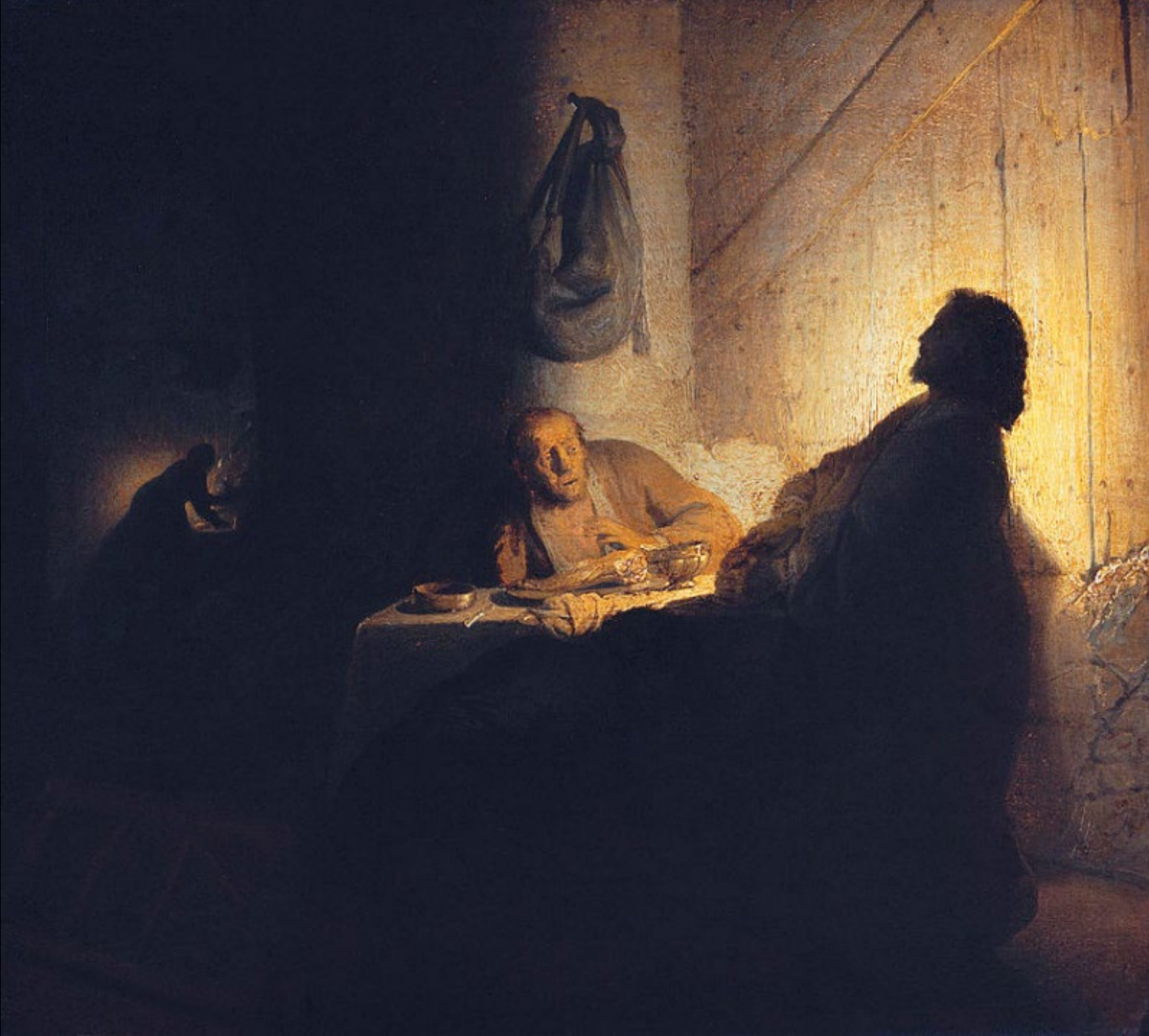
Supper at Emmaus

Rembrandt Musée Jacquemart- André, Paris