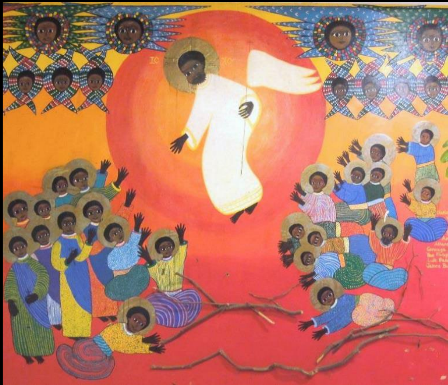
Emmaus House – Martyrs of Uganda, Kamapala, Uganda