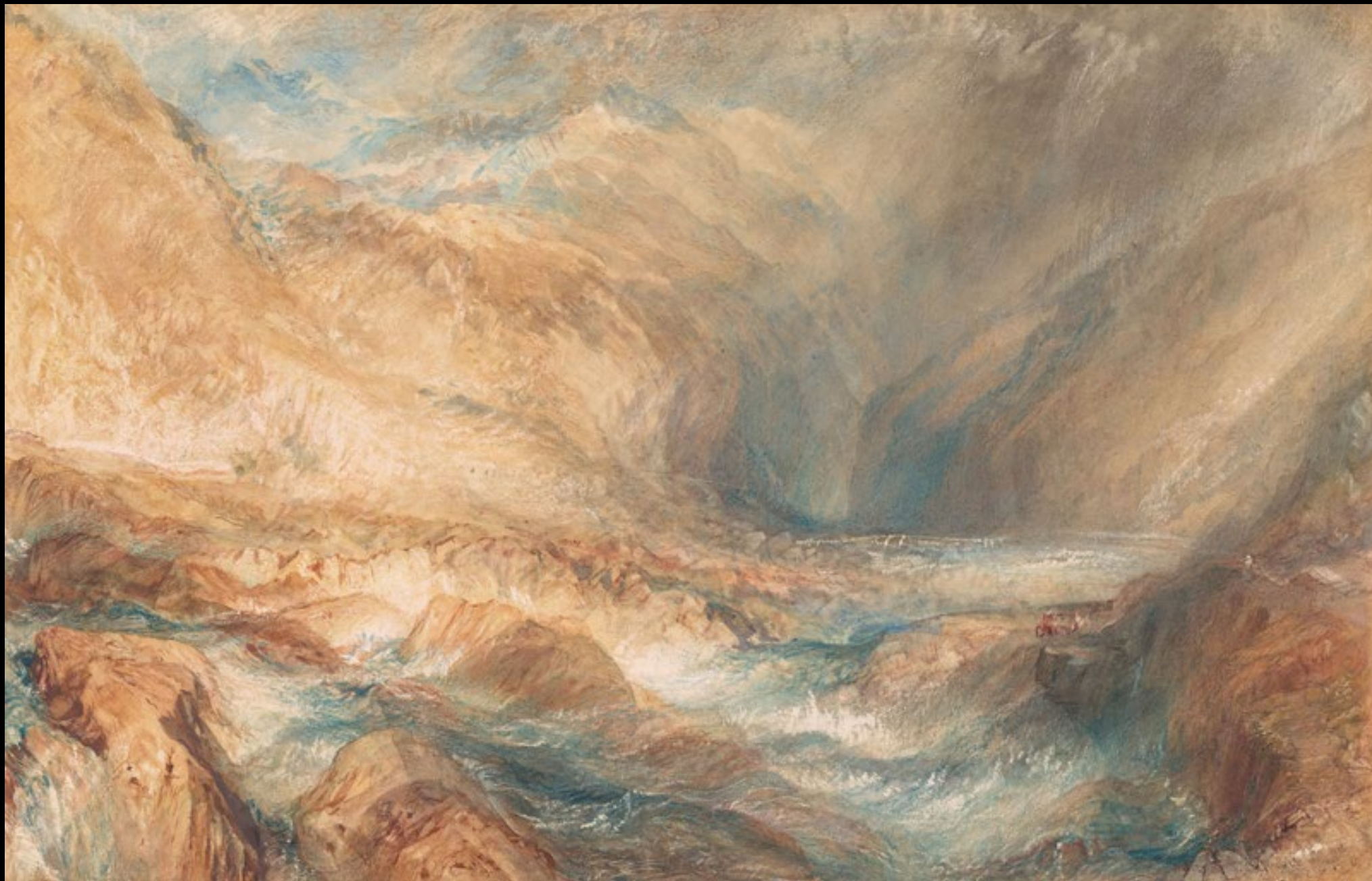
Pass at Faido -- J. M. W. Turner, Morgan Library, New York City