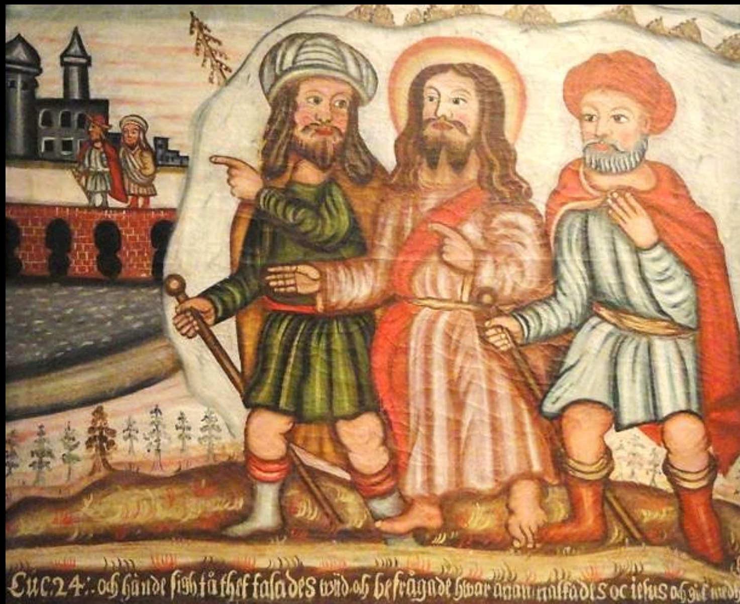
Road to Emmaus -- National Museum of Finland, Helsinki