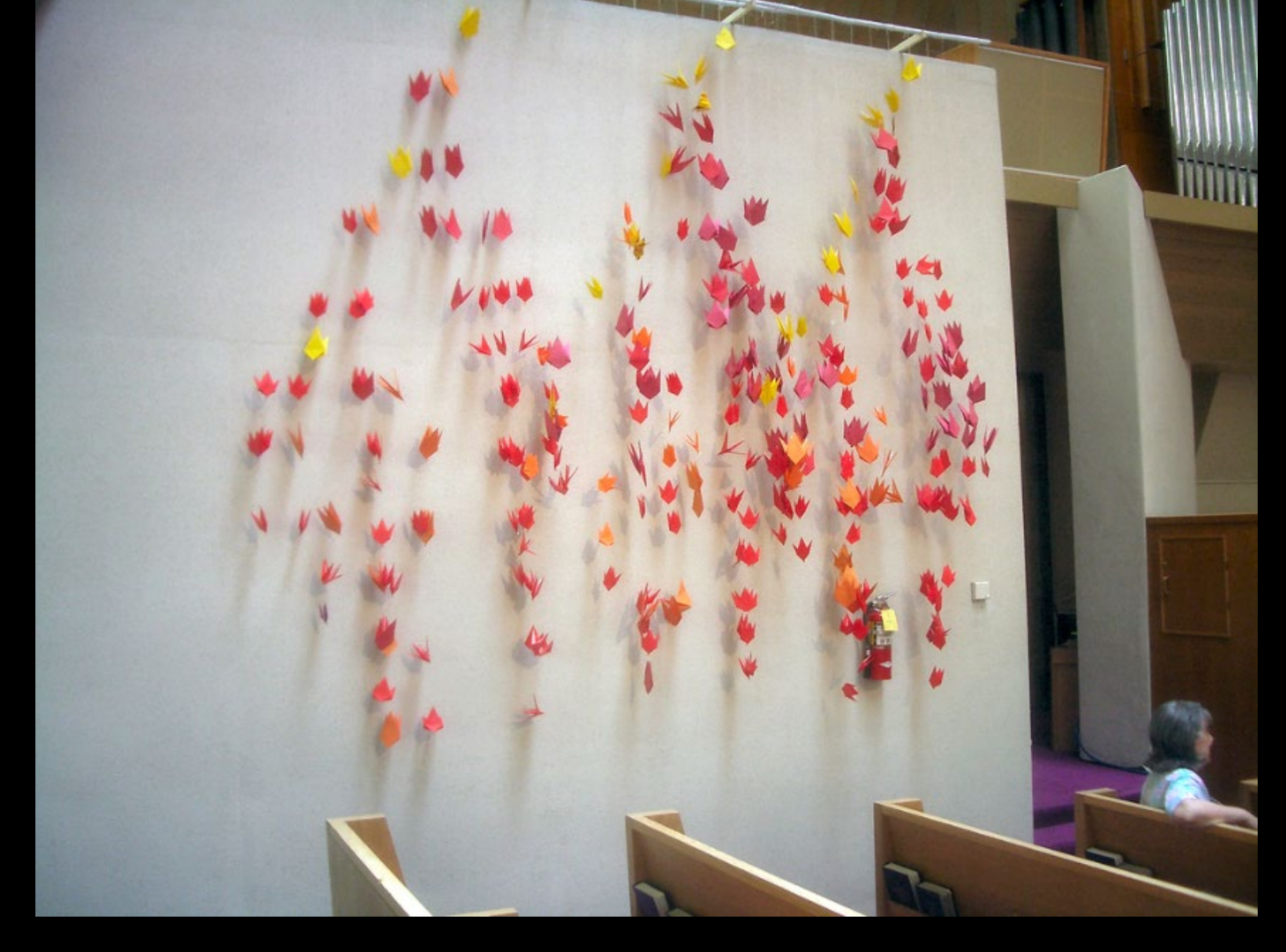
Pentecost -- First Presbyterian Church, Berkeley, CA