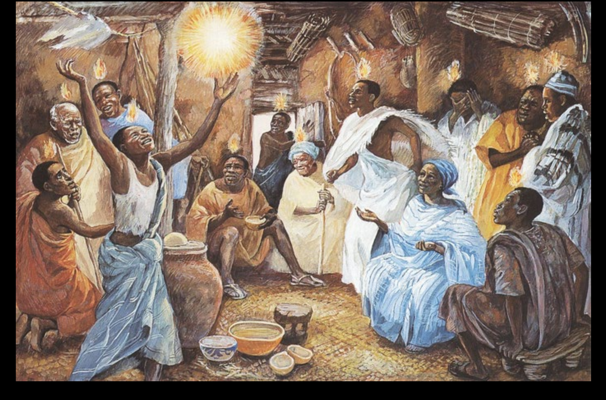
Pentecost -- JESUS MAFA, Cameroon