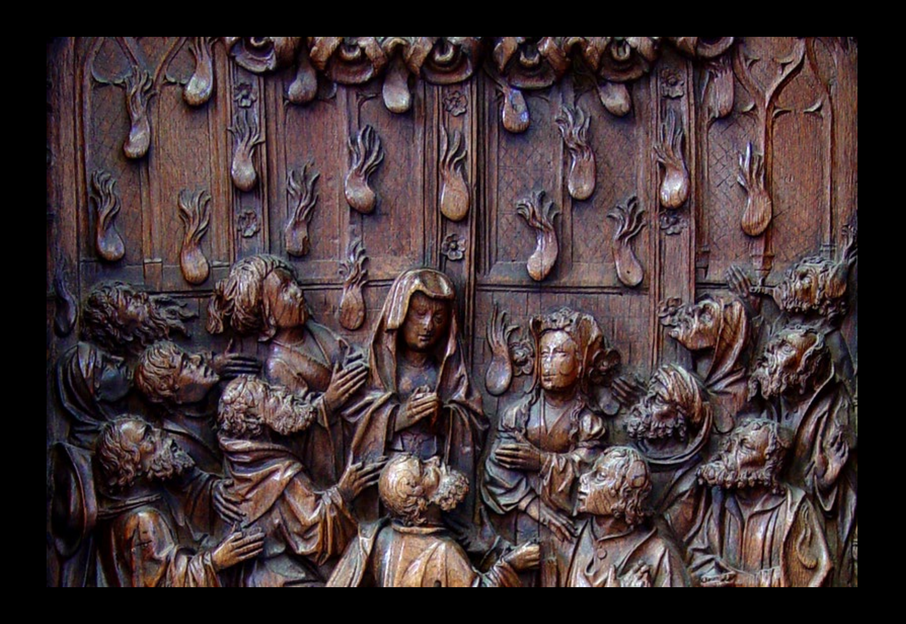
Pentecost -- Early 16<sup>th</sup> century Choirstall, Amiens Cathedral, Amiens, France