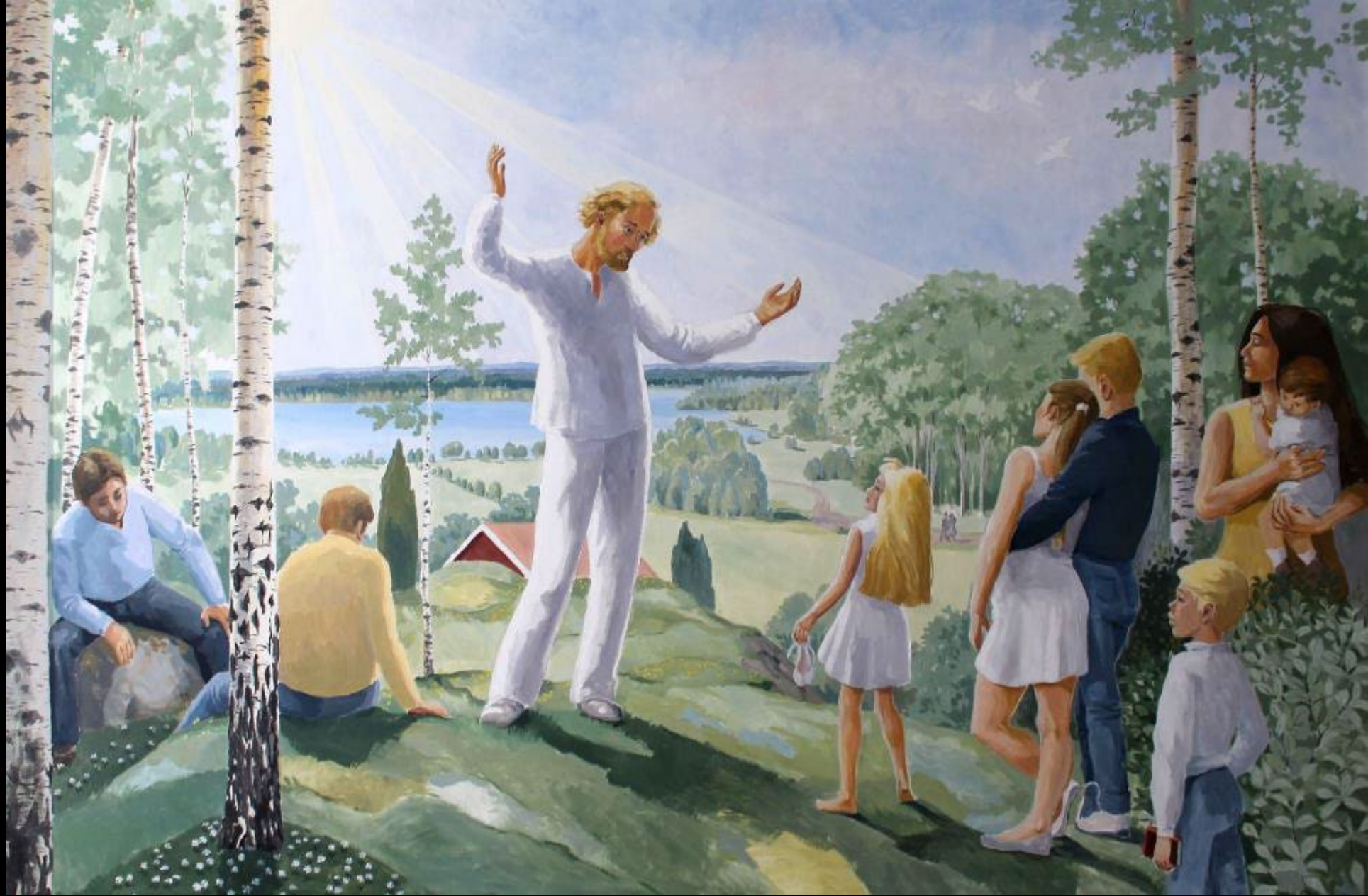
Jesus Preaching in the Present -- Soraby Church, Vaxjo, Sweden