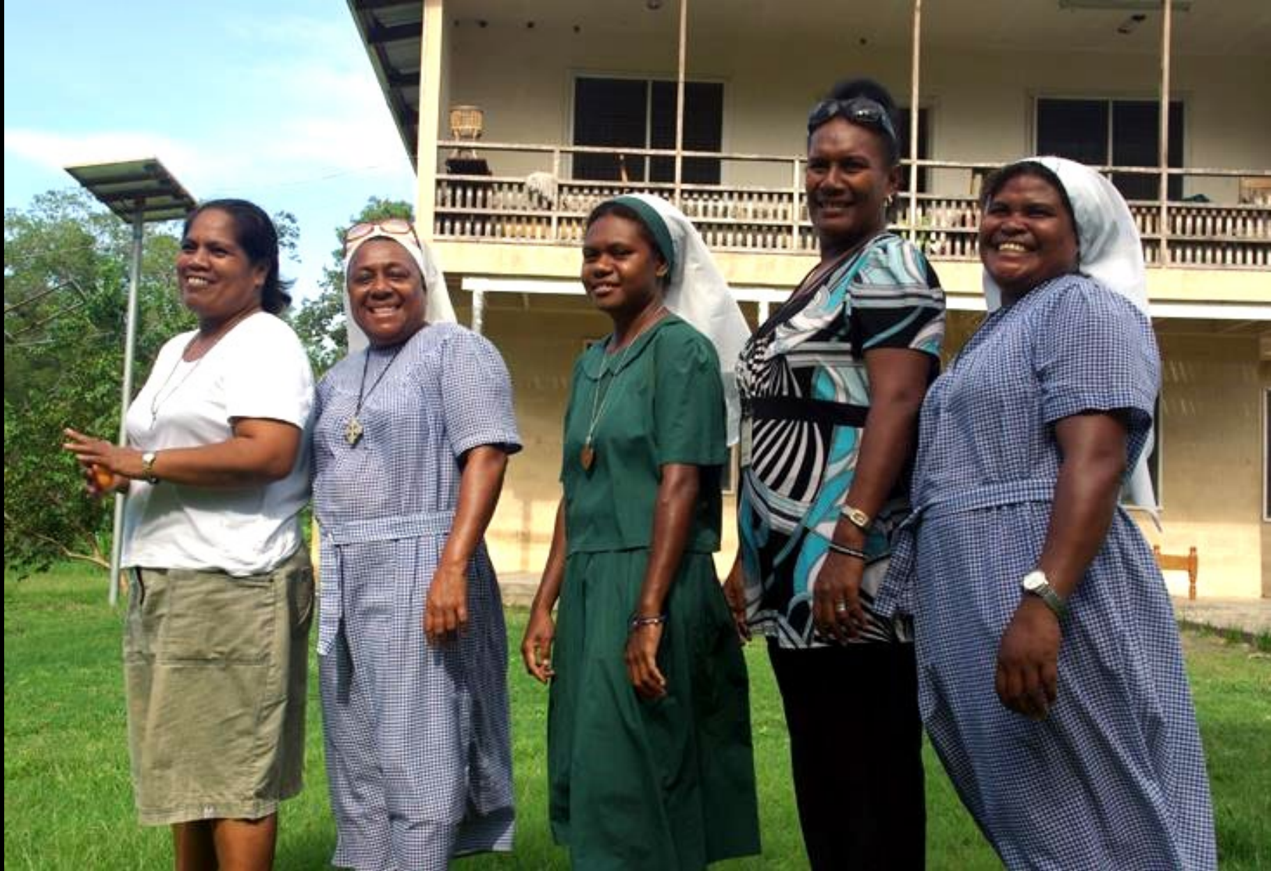
Nuns of the Christian Care Centre Community of Sisters of the Church, Honiara, Solomon Islands