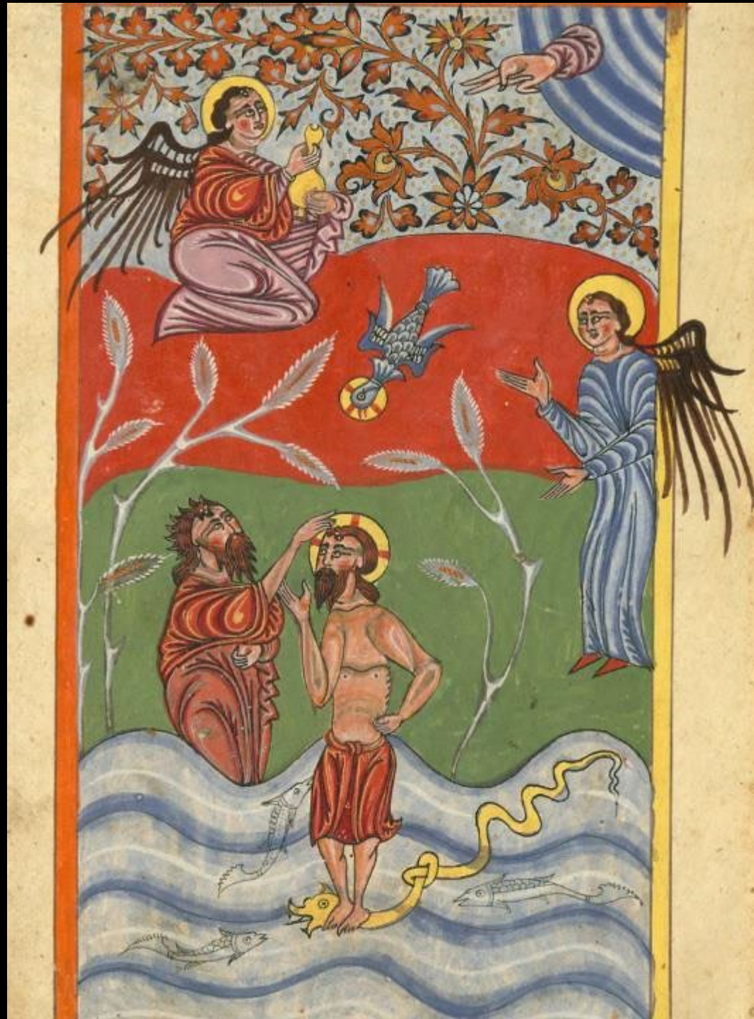
Baptism of Christ 15 th c. Armenian Walters Art Museum Baltimore, MD