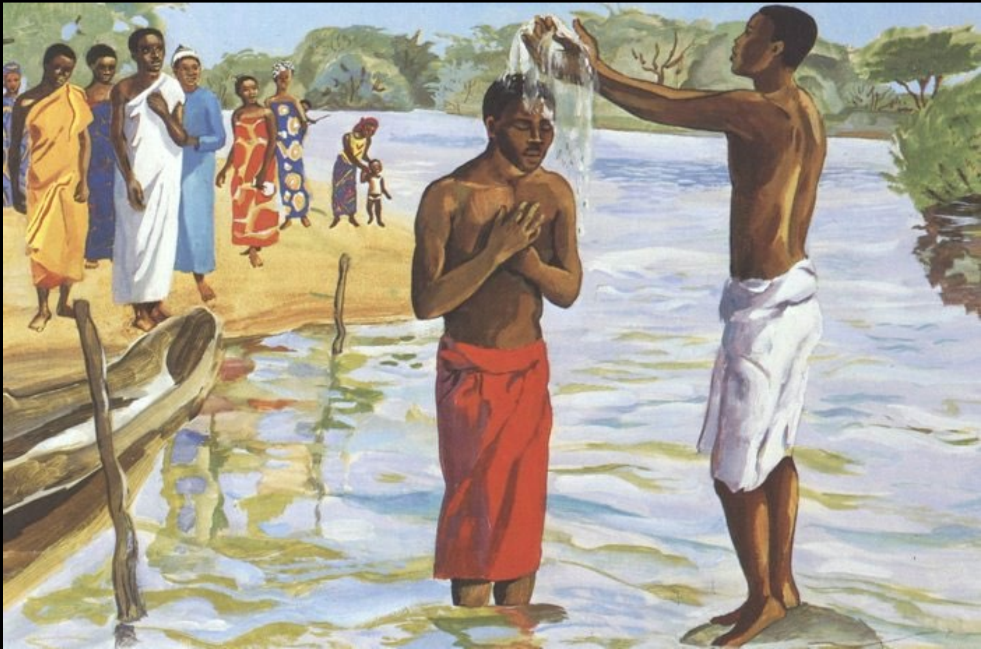
John Baptizes Jesus -- JESUS MAFA, Cameroon