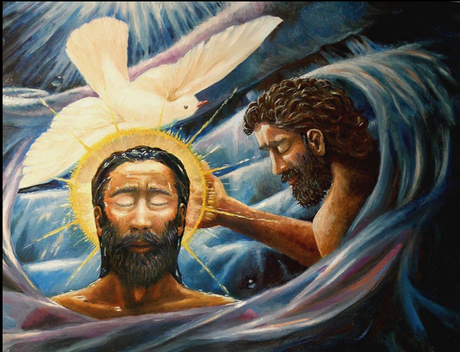
Baptism of Christ -- Dave Zelenka