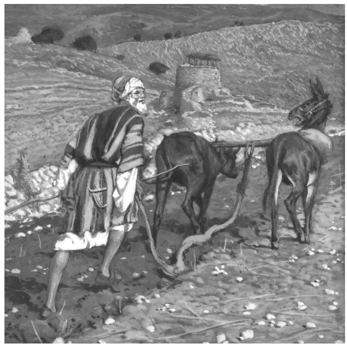
THE MAN AT THE PLOUGH James Tissot, Brooklyn Museum, between 1886 and 1894.

June 29, 2025 Year C, Revised Common Lectionary