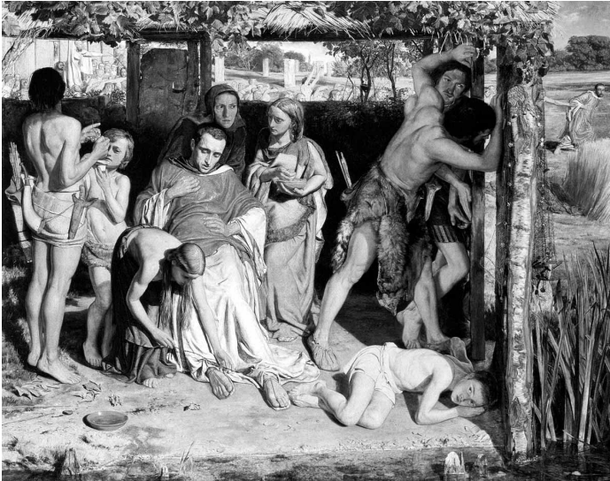
A CONVERTED BRITISH FAMILY SHELTERING A CHRISTIAN MISSIONARY FROM THE PERSECUTION OF THE DRUIDS, William Holman Hunt, Ashmolean Museum, Oxford, UK, 1850.

Isaiah 65:17-25 For I am about to create new heavens and a new earth; the former things shall not be remembered or come to mind. But be glad and rejoice forever in what I am creating, for I am about to create Jerusalem as a joy and its people as a delight. I will rejoice in Jerusalem and delight in my people; no more shall the sound of weeping be heard in it or the cry of distress. No more shall there be in it an infant who lives but a few days or an old person who does not live out a lifetime, for one who dies at a hundred years will be considered a youth, and one who falls short of a hundred will be considered accursed. They shall build houses and inhabit them; they shall plant vineyards and eat their fruit. They shall not build and another inhabit; they shall not plant and another eat, for like the days of a tree shall the days of my people be, and my chosen shall long enjoy the work of their hands. They shall not labor in vain or bear children for calamity, for they shall be offspring blessed by the LORD— and their descendants as well. Before they call I will answer, while they are yet speaking I will hear. The wolf and the lamb shall feed together; the lion shall eat straw like the ox, but the serpent—its food shall be dust! They shall not hurt or destroy on all my holy mountain, says the LORD.