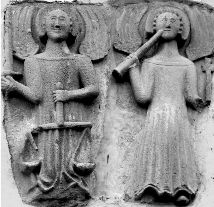
ANGELS OF JUSTICE, parish church at Maria Gail, Villach, Austria, early medieval.

Jeremiah 31:27-34 The days are surely coming, says the LORD, when I will sow the house of Israel and the house of Judah with the seed of humans and the seed of animals. And just as I have watched over them to pluck up and break down, to overthrow, destroy, and bring evil, so I will watch over them to build and to plant, says the LORD. In those days they shall no longer say: “The parents have eaten sour grapes, and the children’s teeth are set on edge.” But all shall die for their own sins; the teeth of the one who eats sour grapes shall be set on edge. The days are surely coming, says the LORD, when I will make a new covenant with the house of Israel and the house of Judah. It will not be like the covenant that I made with their ancestors when I took them by the hand to bring them out of the land of Egypt—a covenant that they broke, though I was their husband, says the LORD. But this is the covenant that I will make with the house of Israel after those days, says the LORD: I will put my law within them, and I will write it on their hearts, and I will be their God, and they shall be my people. No longer shall they teach one another or say to each other, “Know the LORD,” for they shall all know me, from the least of them to the greatest, says the LORD, for I will forgive their iniquity and remember their sin no more.