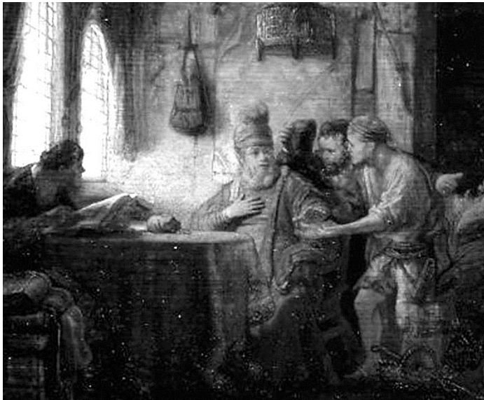
Parable of the Laborers in the Vineyard Rembrandt, The Hermitage, St. Petersburg, Russia, 1637.